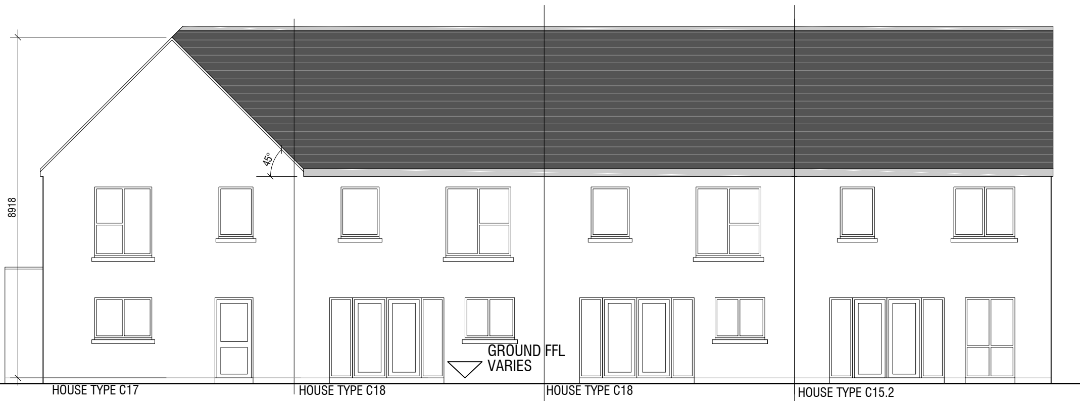
REAR ELEVATION C15.2, C18 & C17 SCALE 1:100