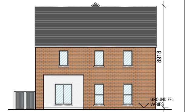
SIDE ELEVATION C17 SCALE 1:200