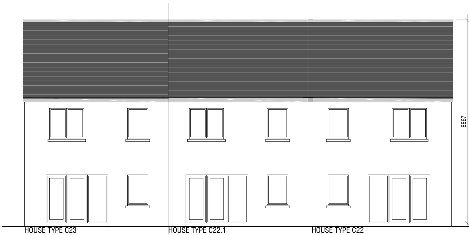
REAR ELEVATION C22 C22.1 & C23 SCALE 1:100