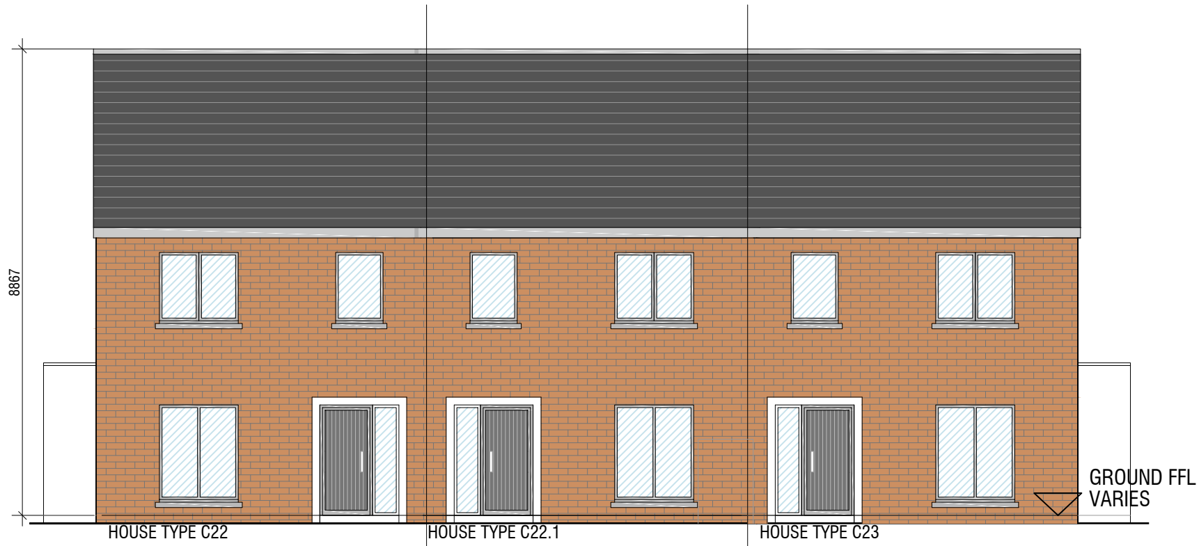
FRONT ELEVATION C22 C22.1 & C23 SCALE 1:100