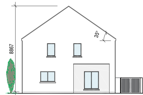
SIDE ELEVATION C22 SCALE 1:200