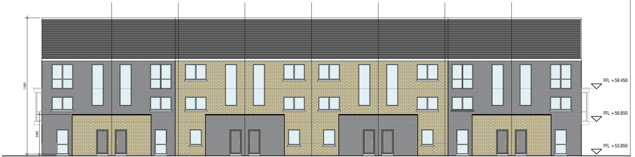
FRONT ELEVATION SCALE 1:200