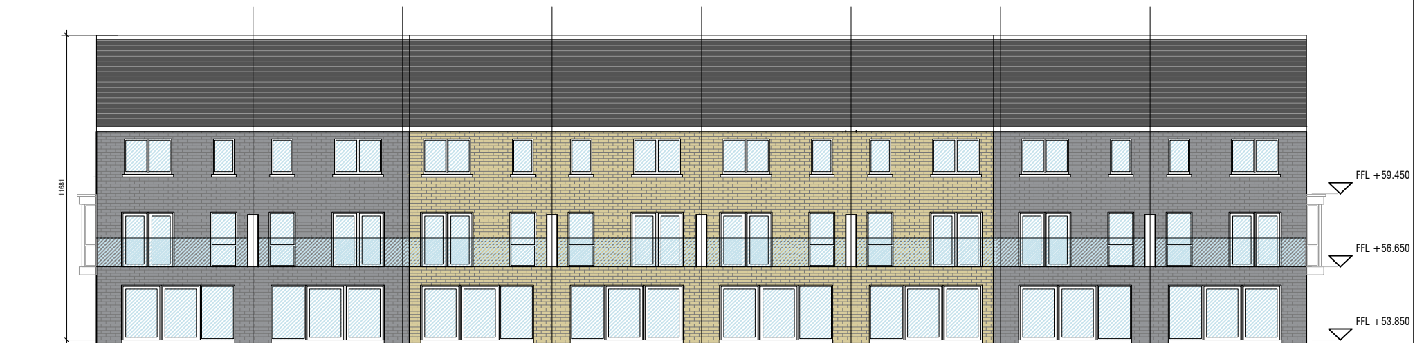
REAR ELEVATION SCALE 1:200