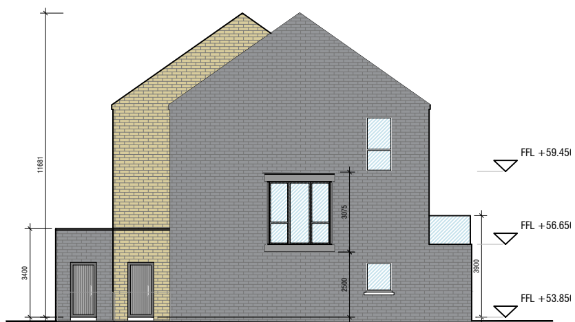
RHS ELEVATION SCALE 1:200