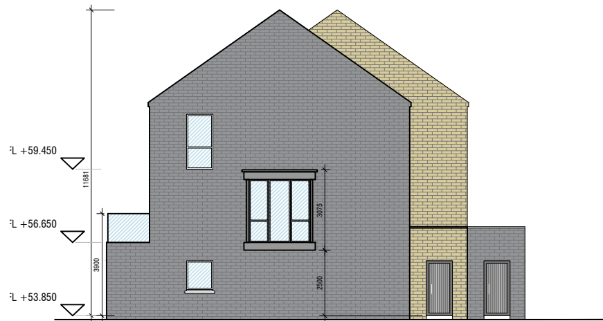
LHS ELEVATION SCALE 1:200