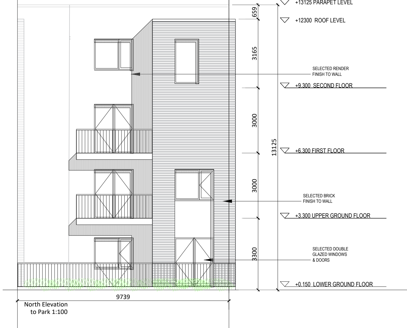
North Elevation to Park 1:100