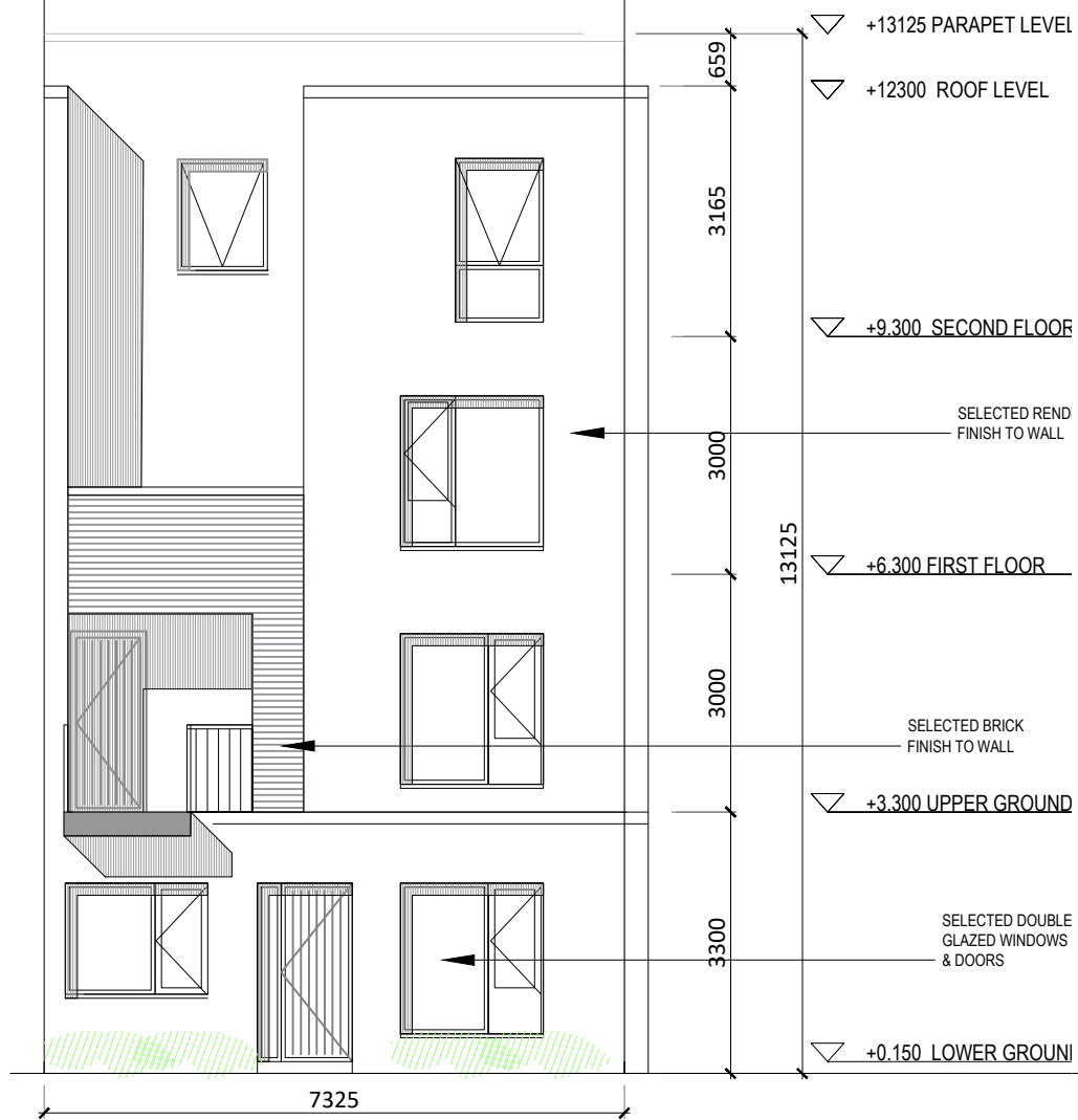
South Elevation to street 1:100