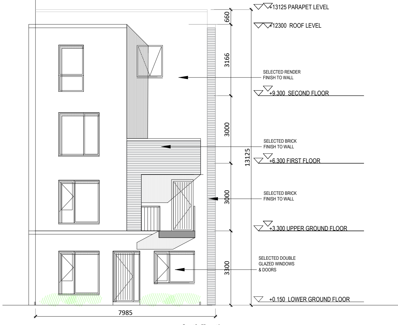
South Elevation to street 1:100