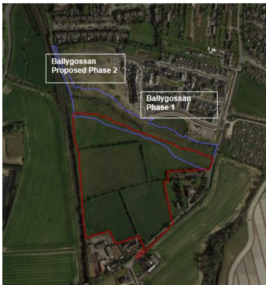
Figure 8.3: Site Location with approximate SHD site outlined in red and approximate Advanced infrastructure application outlined in Blue (Source: Google Maps, 2022).

The project, which is the subject of assessment in this EIAR and the accompanying Appropriate Assessment Report and Natura Impact Statement, will be facilitated by advance infrastructural works. These works were the subject of a Section 34 application to Fingal County Council (FCC F21A/0287) and are currently on appeal to An Bord Pleanála (ABP Reg. Ref. 312189). They consist of a connecting road to the north, drainage infrastructure, cycle and pedestrian facilities, and associated landscaping (the “AI Works”). The Project, is assessed to ensure that all cumulative and in combination effects of the Project with other plans and projects within the zone of influence, including the Advance Infrastructure Works (Ref. ABP-312189-21), the prior application for off-site road improvements serving the wider area (ABP Reg. Ref. 309409; FCC Reg. Ref. F20A/0324), and the proposals by Noonan Construction for Ballygossan Park Phase 2 have been fully assessed in order to enable the competent authority to undertake a lawful environmental impact assessment (“EIA”), appropriate assessment screening (“AA Screening”) and appropriate assessment (“AA”).