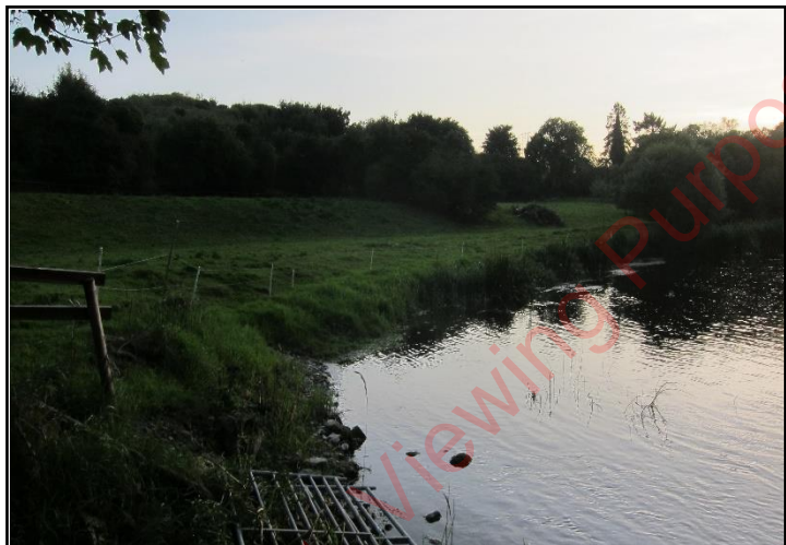
Plate 2: View towards discharge location