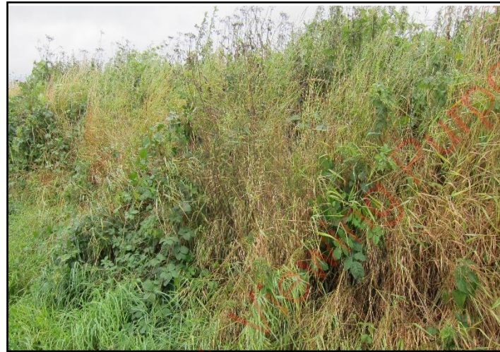
Plate 10: Dry meadows and grassy verges (GS2) habitat