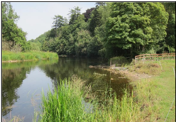
Plate 1: River Boyne and River Blackwater SAC and SPA