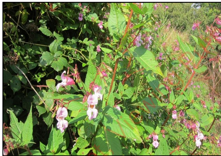
Plate 2: Indian Balsam ( Impatiens glandulifera ) (Not at Site)