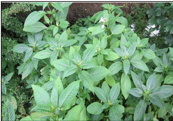
Plate 1: Indian Balsam ( Impatiens glandulifera ) (Not at Site)