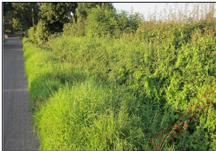
Plate 19: Hedgerows (WL1) and GA2