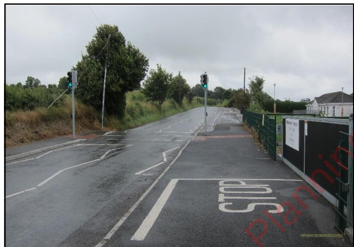
Plate 15: Yellow Furze village with (BL3) habitat