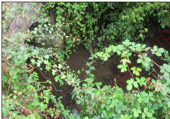
Plate 6: Dollardstown Stream at railway bridge