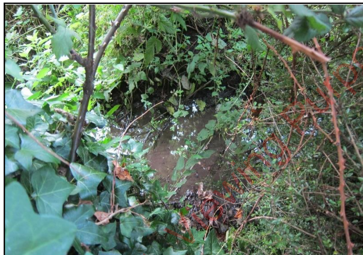
Plate 18: Drainage ditches (FW4) habitat (summer)