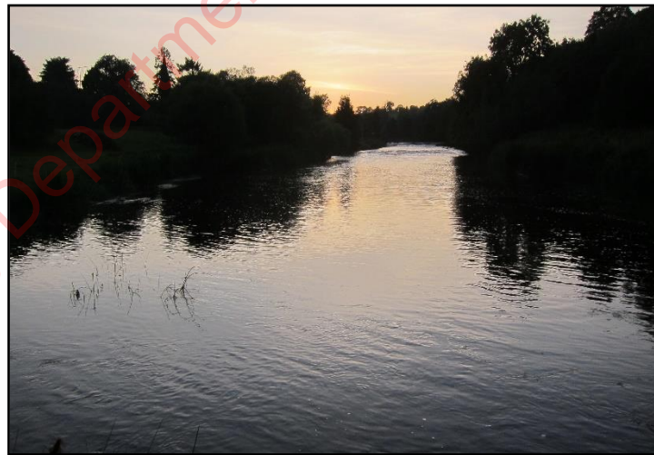
Plate 4: River Boyne at dusk, bats are active here