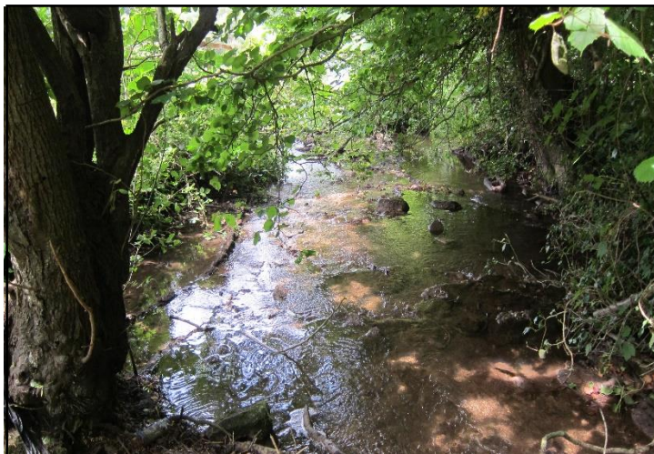
Plate 5: Dollardstown Stream just before confluence with Boyne