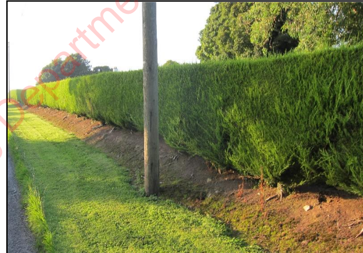
Plate 12: GA2 and WL1 habitats