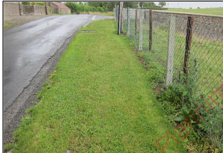
Plate 11: Amenity grassland (GA2) habitat