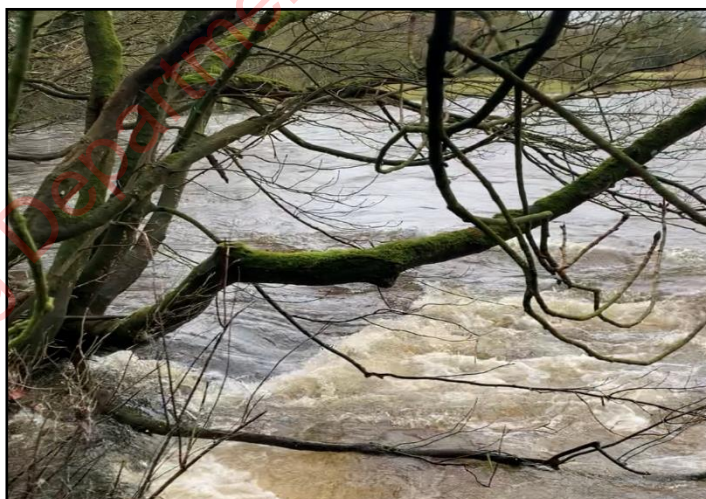
Plate 8: River Boyne in flood