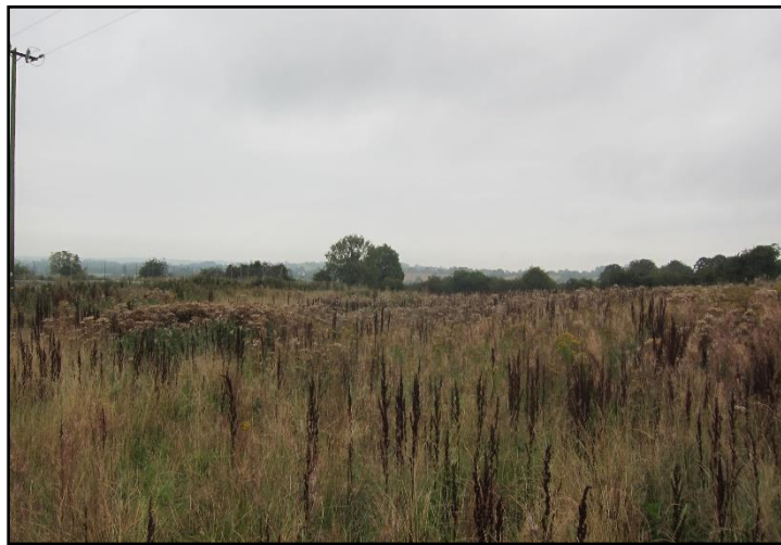
Plate 21: Recolonising bare ground (ED3) habitat at Dawn Meats