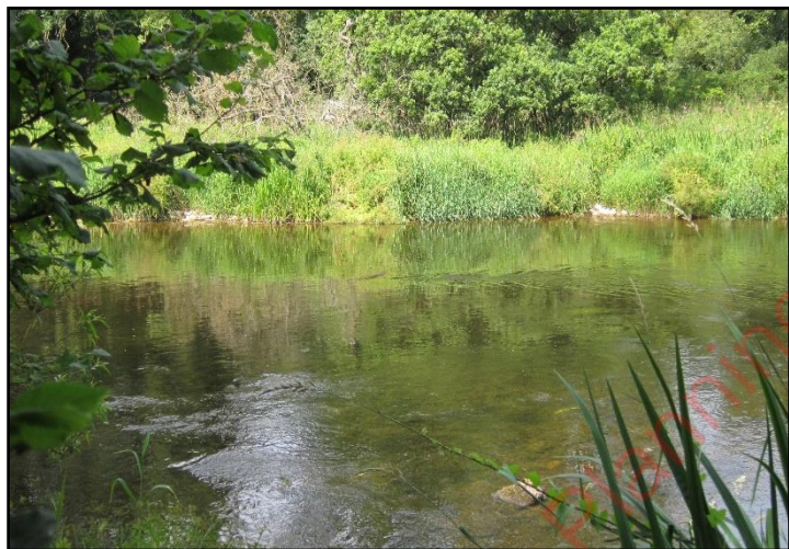
Plate 3: River Boyne (FW2) habitat