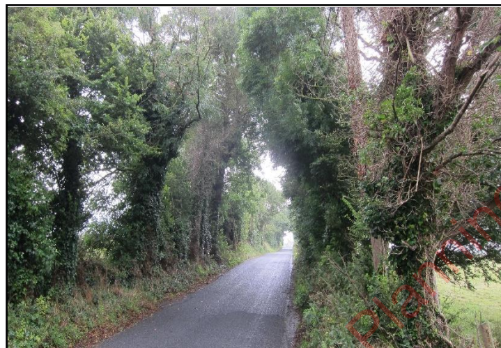
Plate 23: Treelines (WL2) habitat