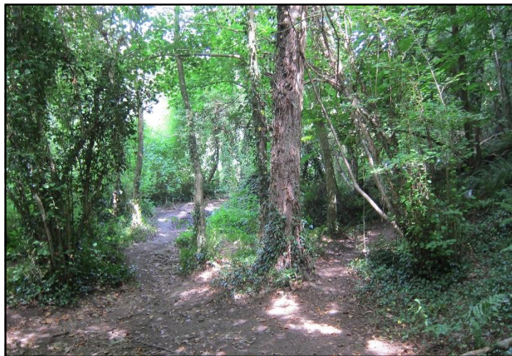
Plate 13: Boyne Woods pNHA beside proposed route