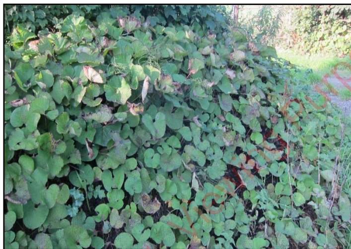
Plate 22: Earth banks (BL2) habitat