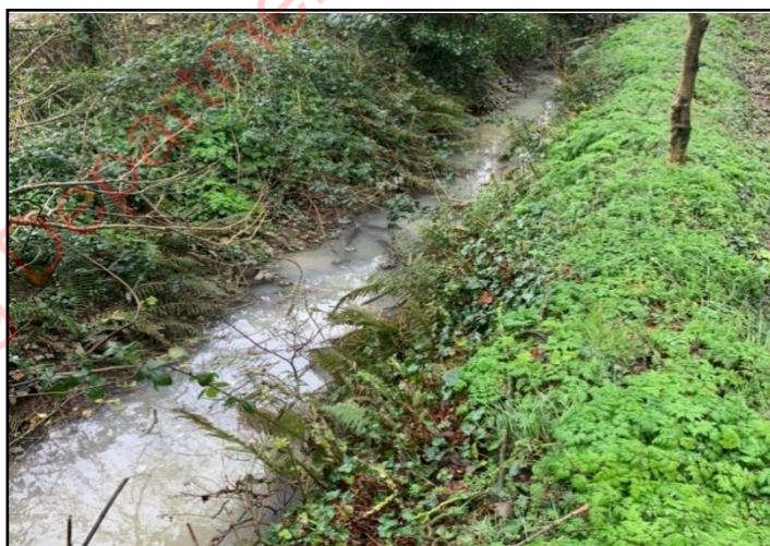
Plate 16: Drainage ditches (FW4) habitat (winter)