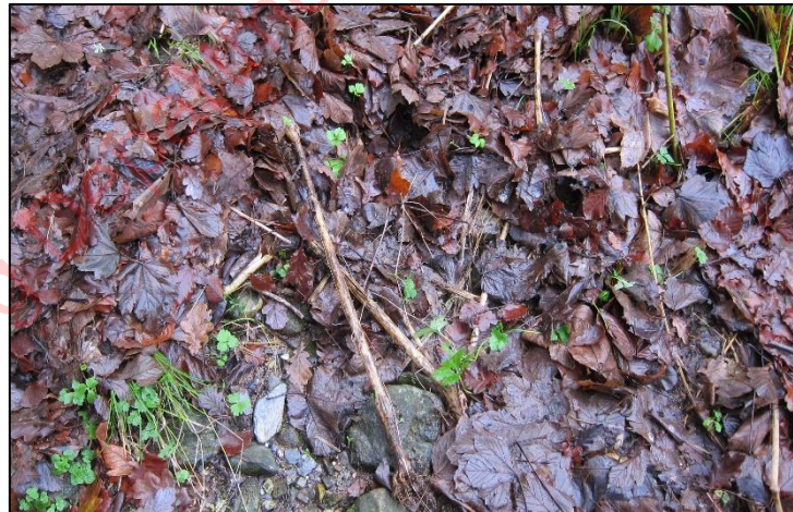
Plate 4: Indian Balsam in winter – plant dies completely (Not at Site)