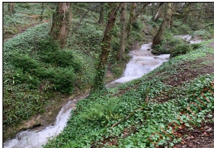
Plate 7: Dollardstown Stream (FL1) habitat