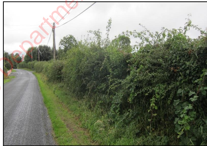
Plate 20: The dominant habitat is hedgerow and grassy verges