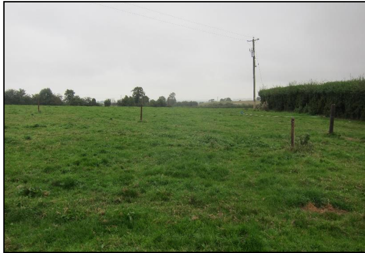
Plate 9: GA1 habitat at Dawn Meats