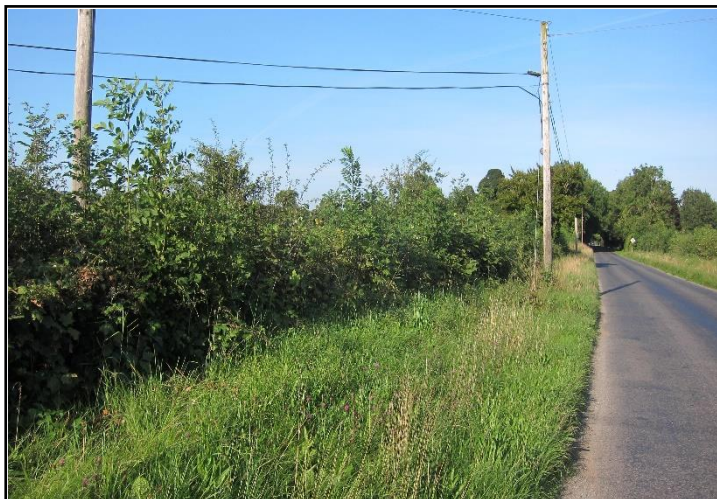
Plate 17: Hedgerows (WL1) and GA2