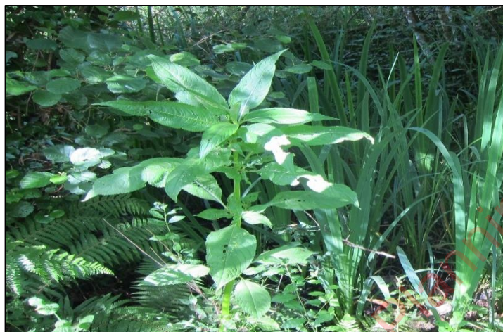
Plate 3: Indian Balsam before flowers develop (Not at Site)