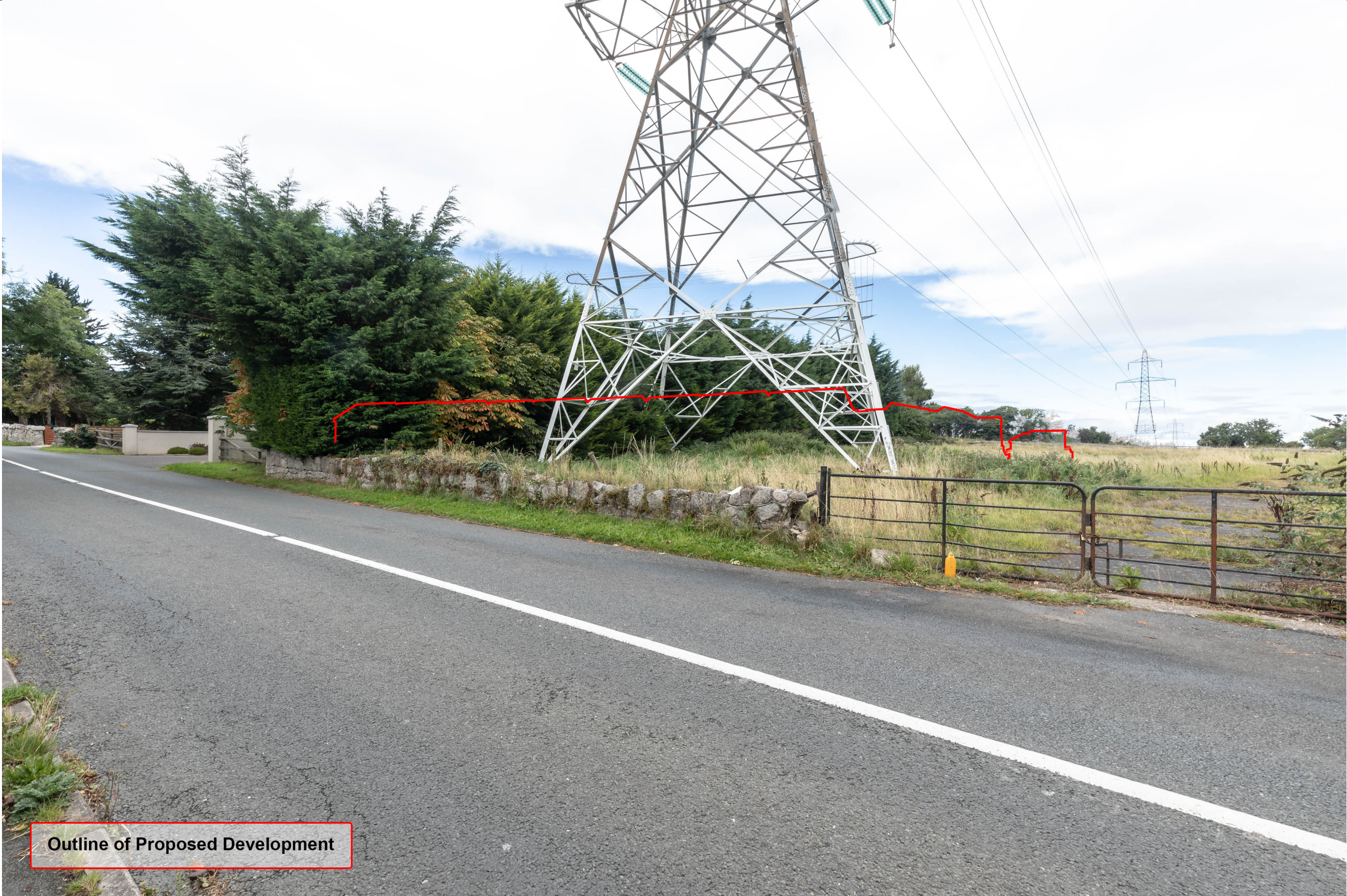
Outline of Proposed Development