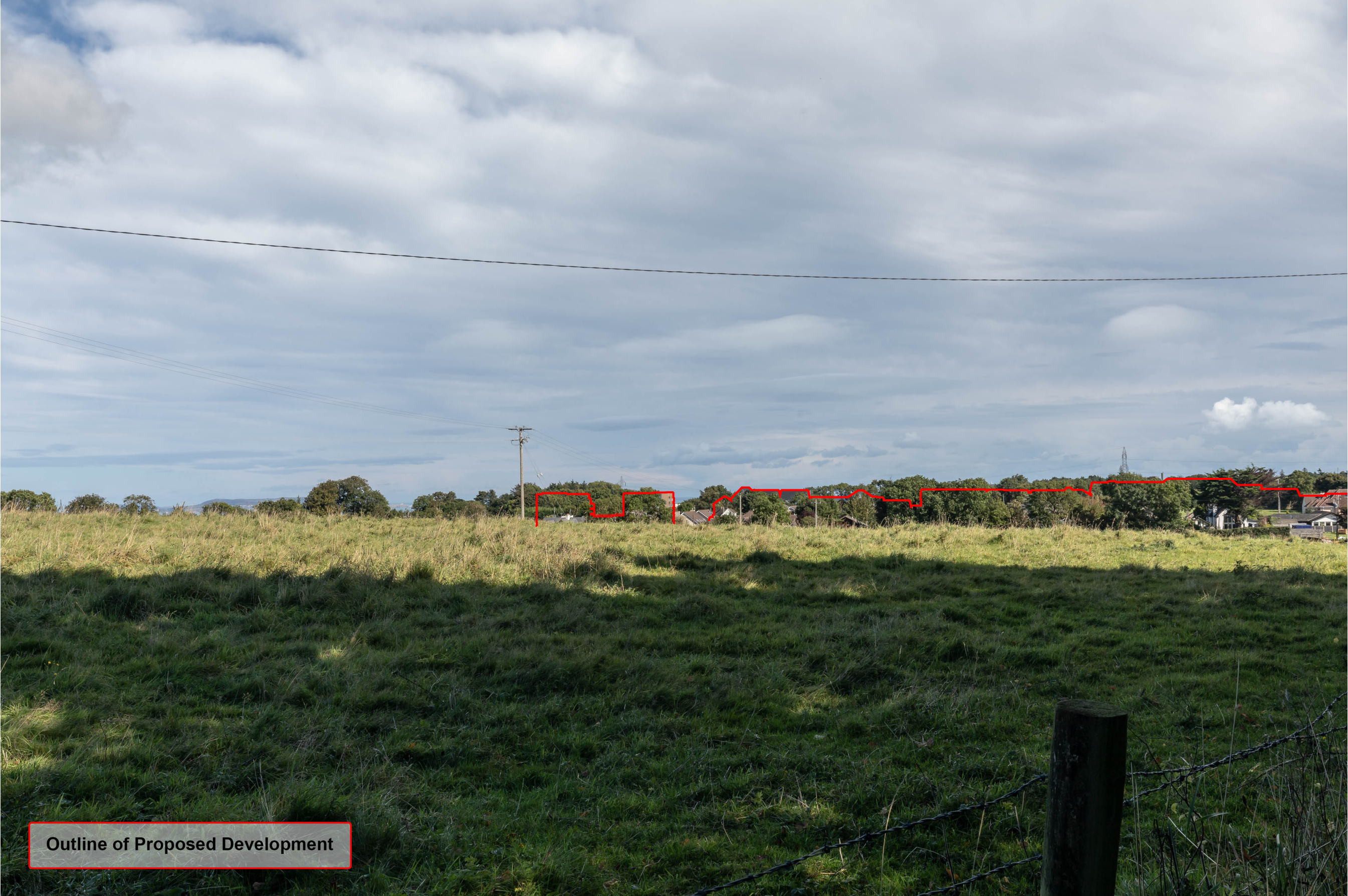
Outline of Proposed Development