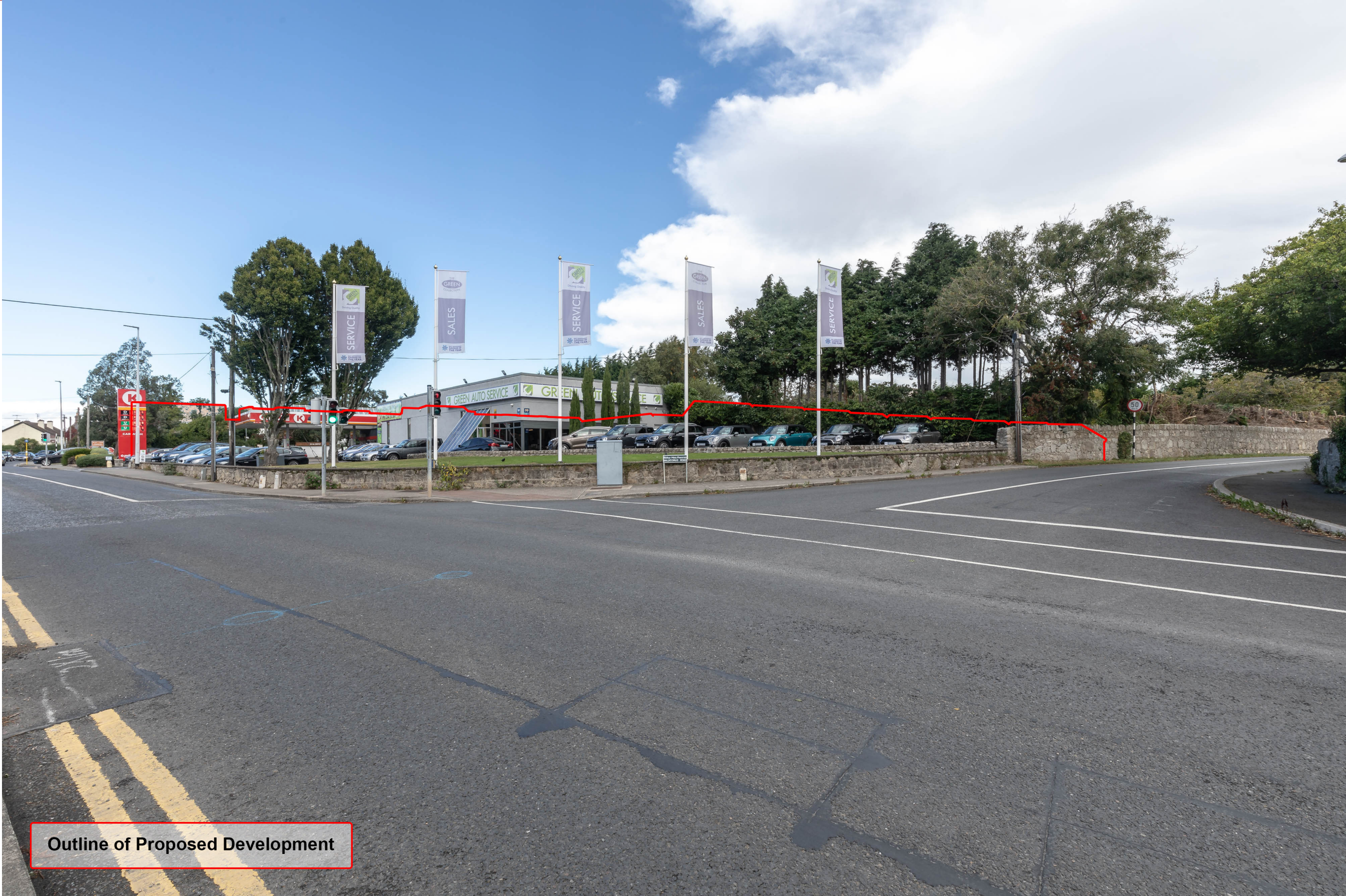
Outline of Proposed Development