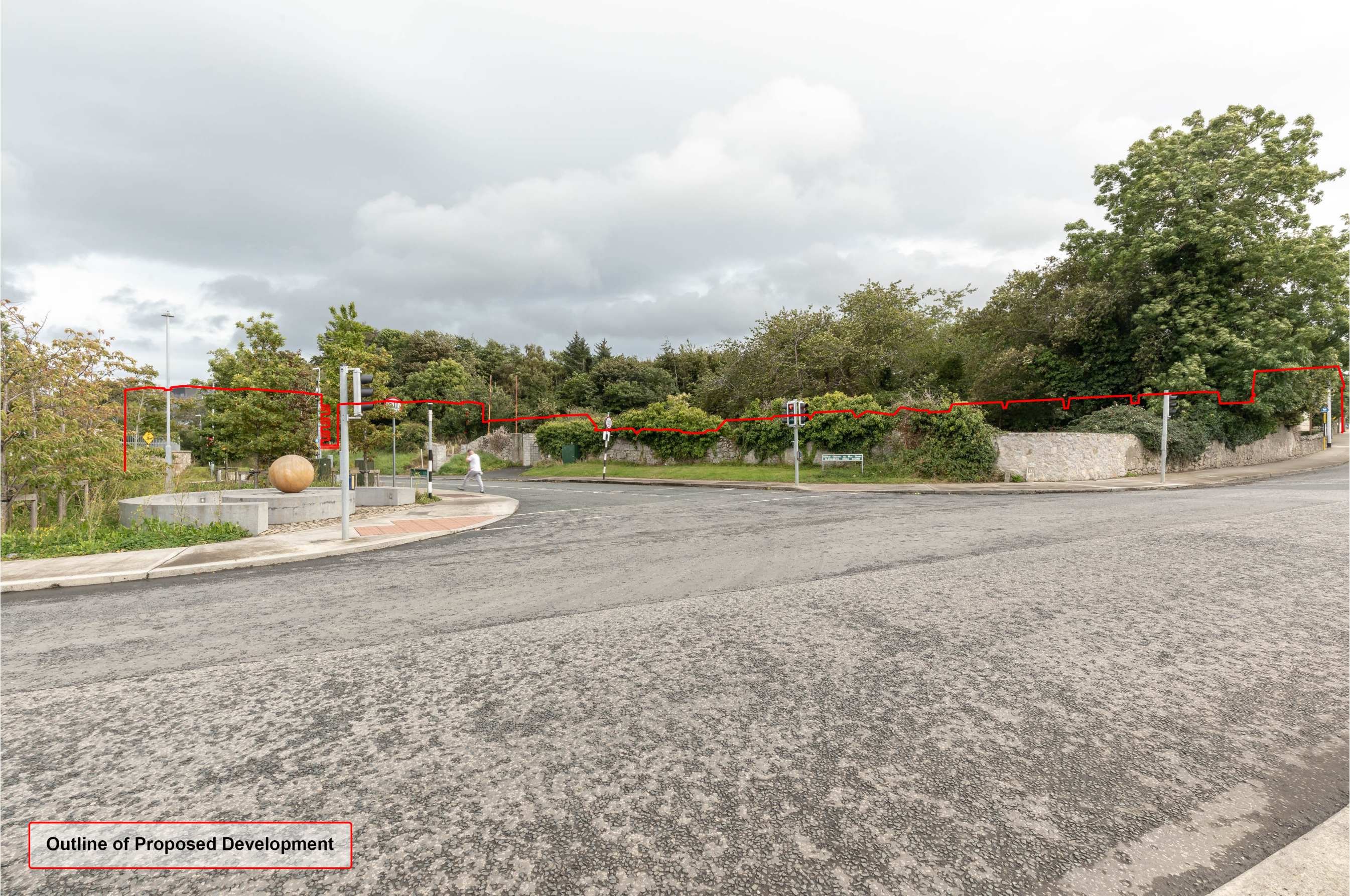
Outline of Proposed Development