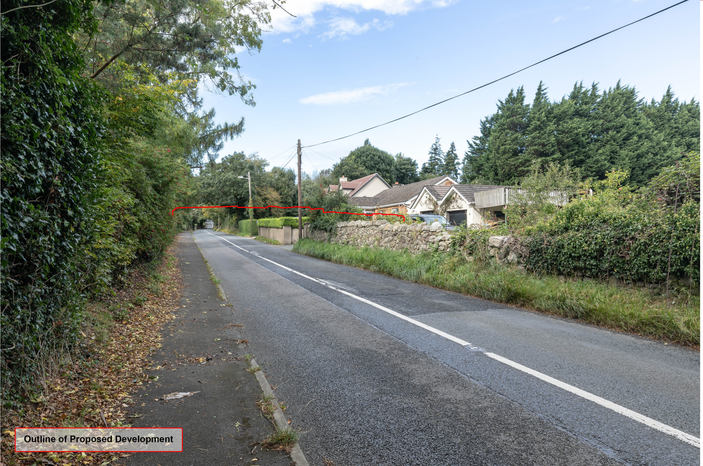
Outline of Proposed Development