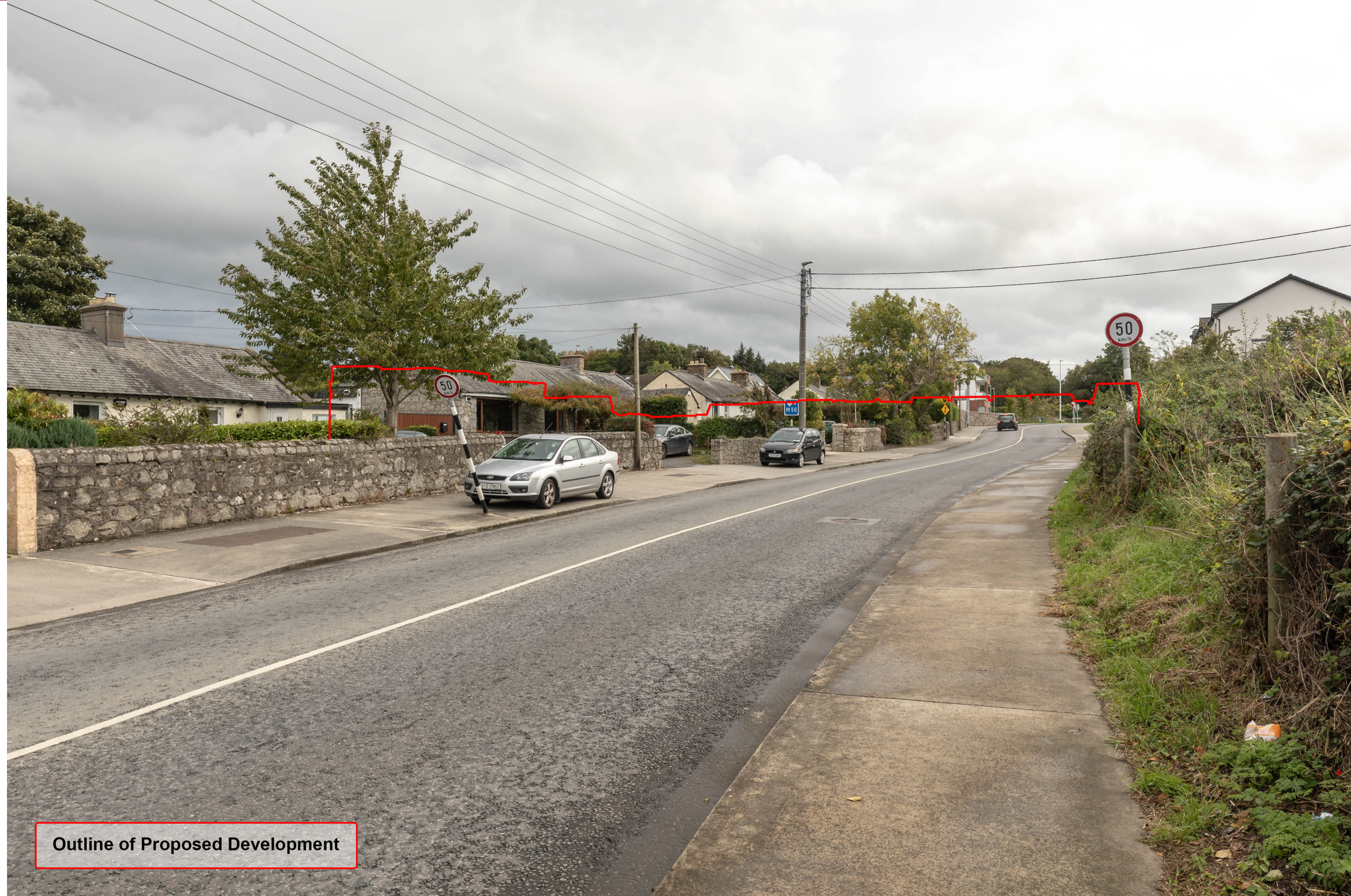
Outline of Proposed Development