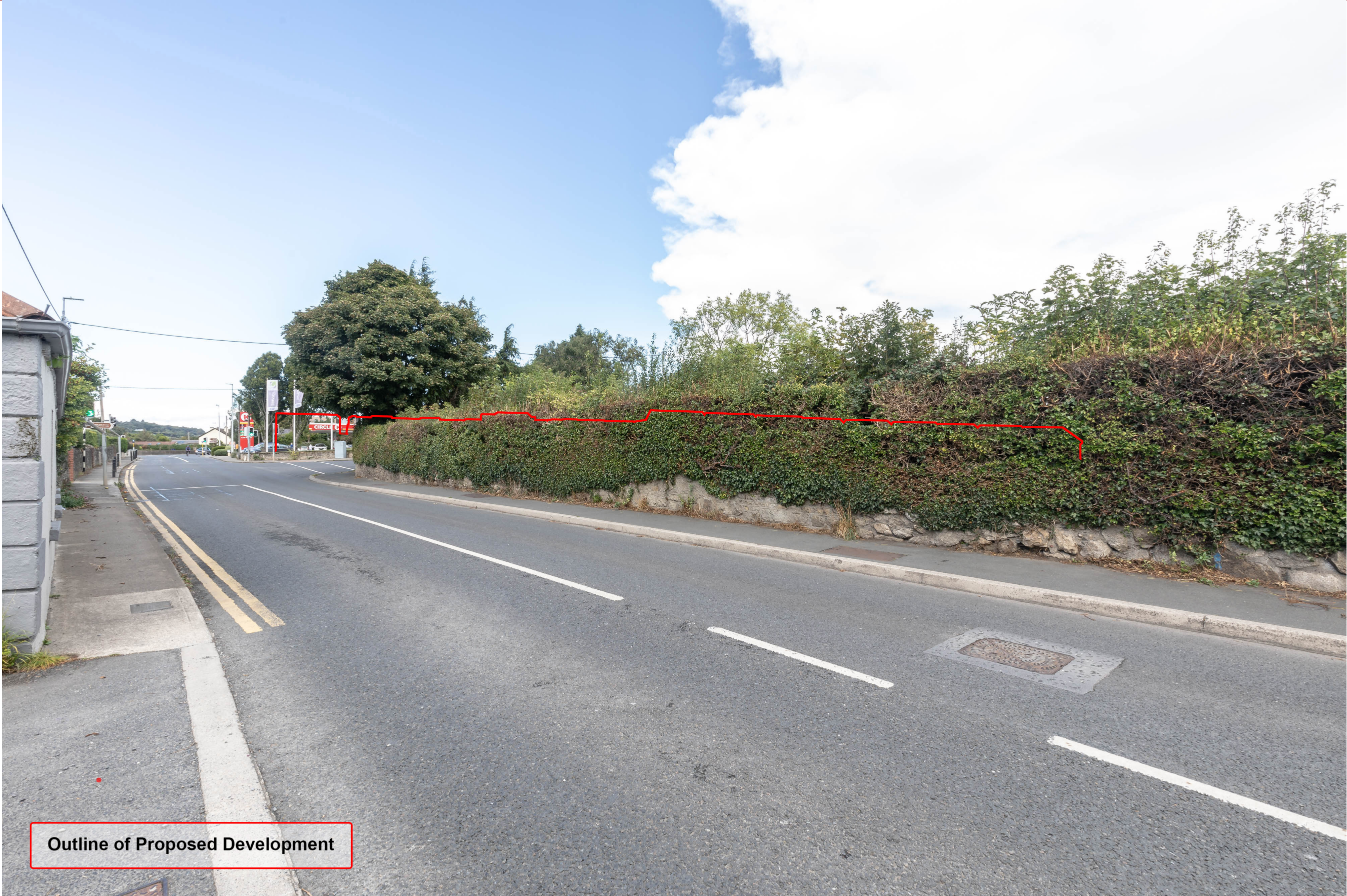
Outline of Proposed Development