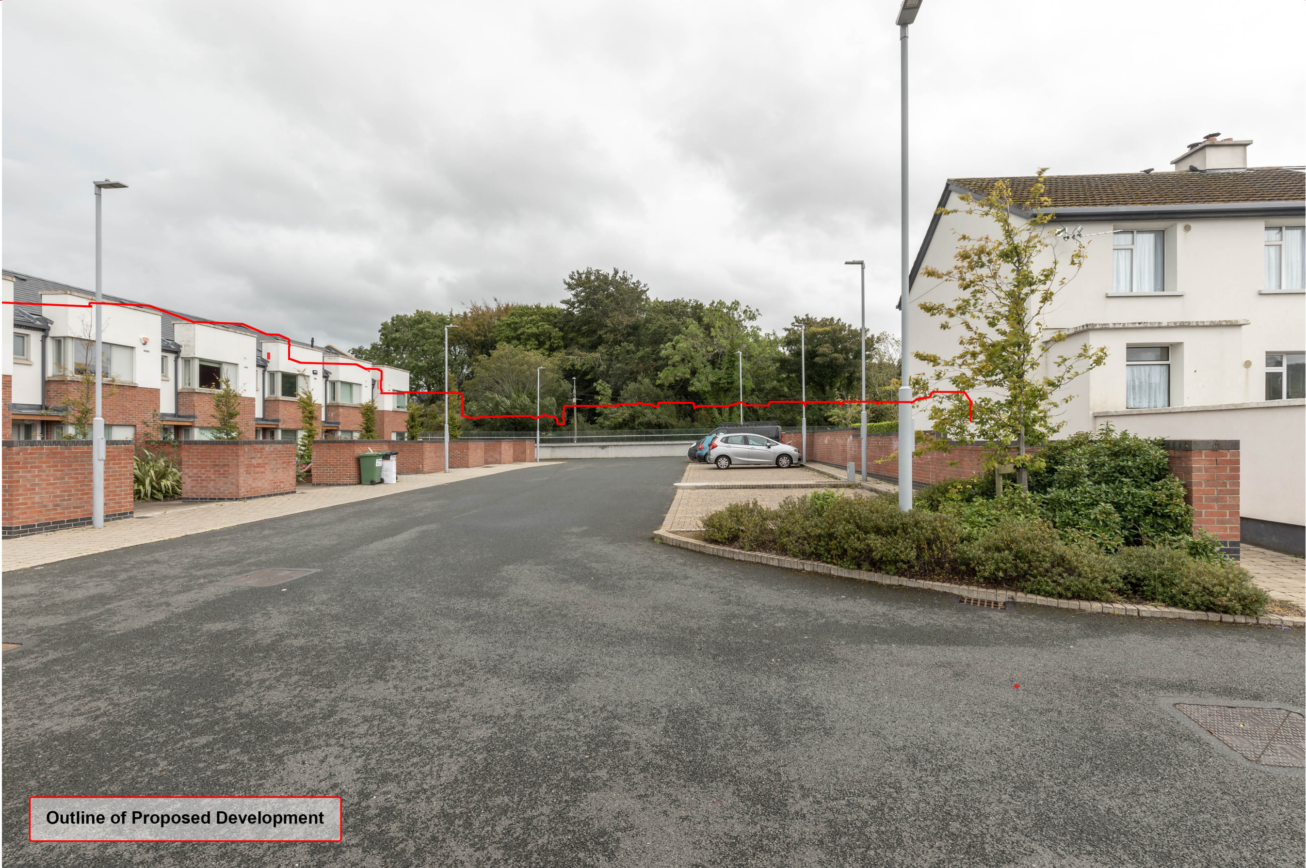
Outline of Proposed Development