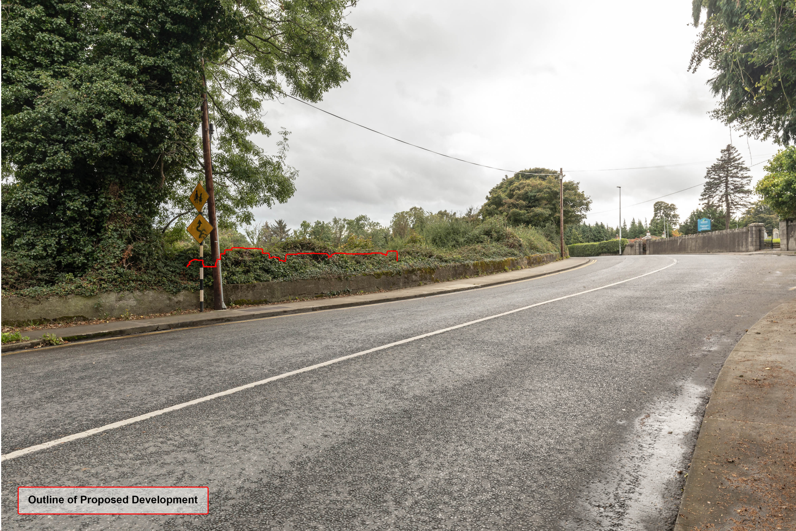
Outline of Proposed Development