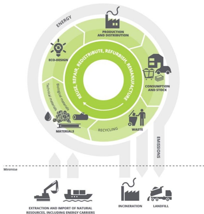
Image 18.1: A Simplified Model of the Circular Economy for Materials and Energy (European Environment Agency (EEA) 2016)

The principal objective of sustainable resource and waste management is to use resources more efficiently, where the value of products, material and resources is maintained in the economy for as long as possible such that the generation of waste is minimised. To achieve resource efficiency there is a need to move from a traditional linear economy to a circular economy (refer to Image 18.1).