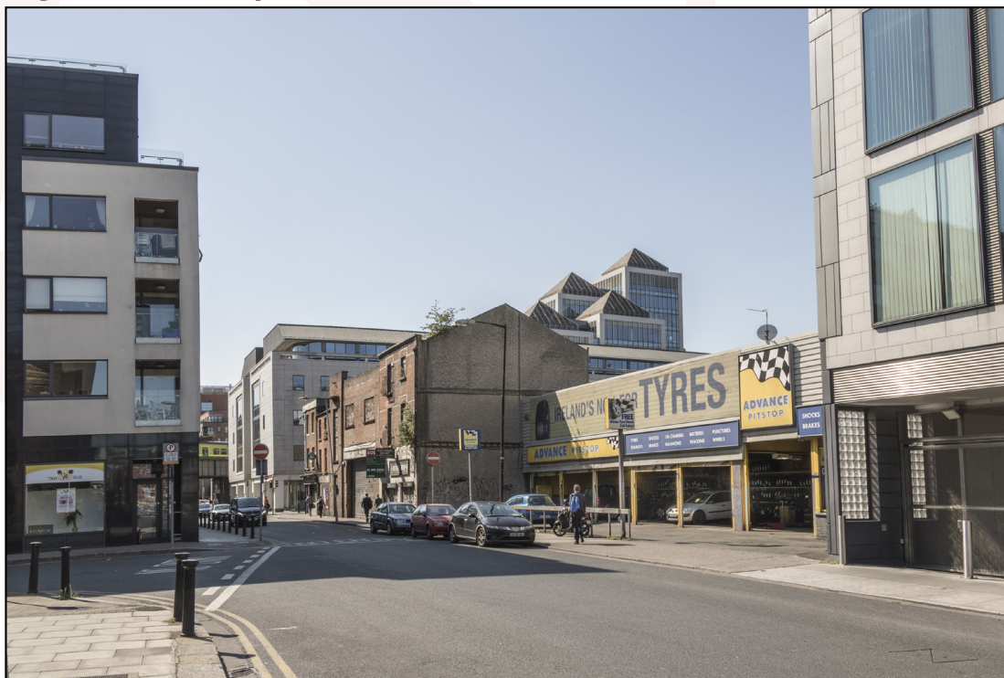
Fig.5: Baseline photo for view 4