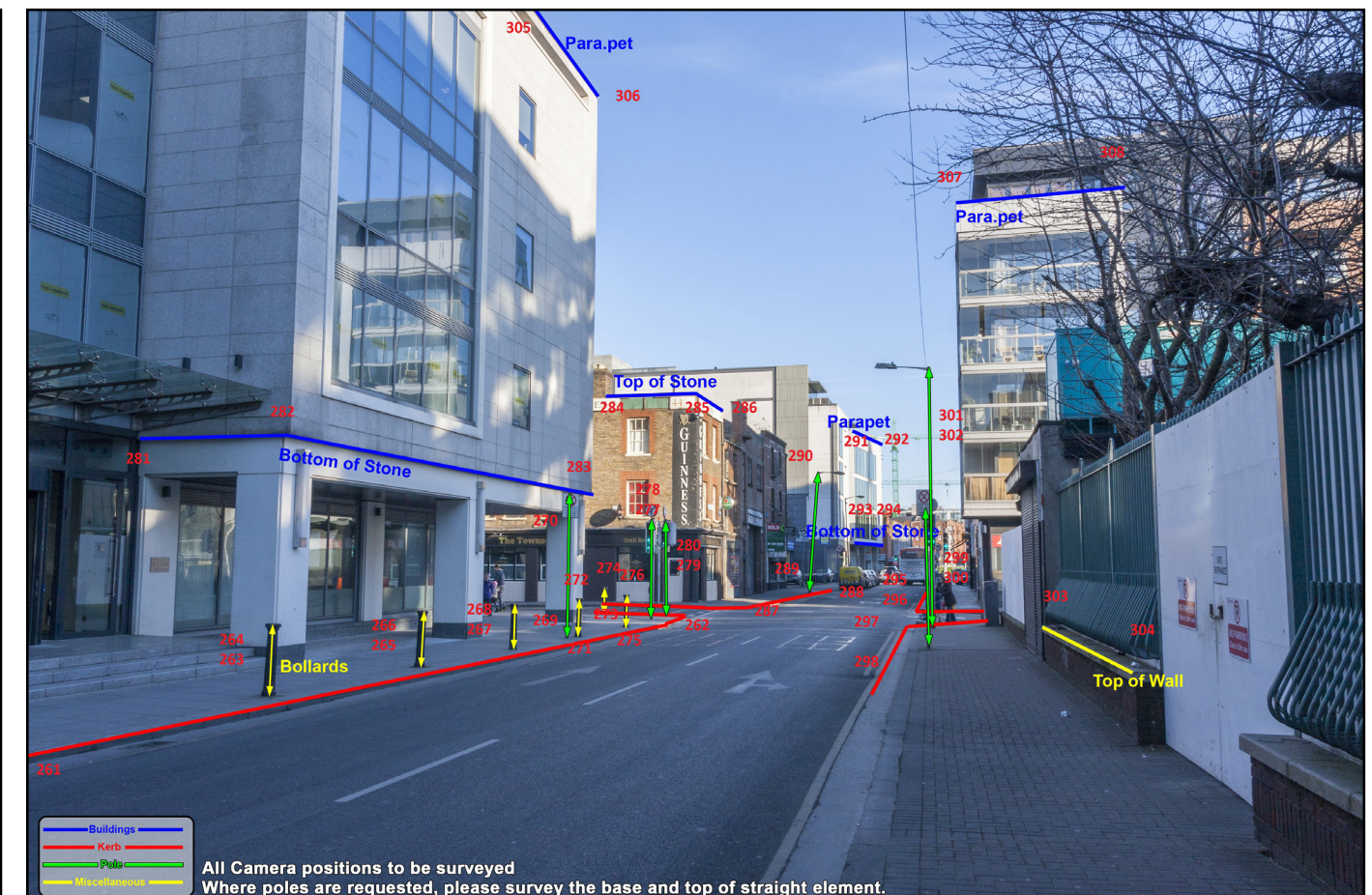
Fig.8: Fixed reference points surveyed and numbered by surveyor.