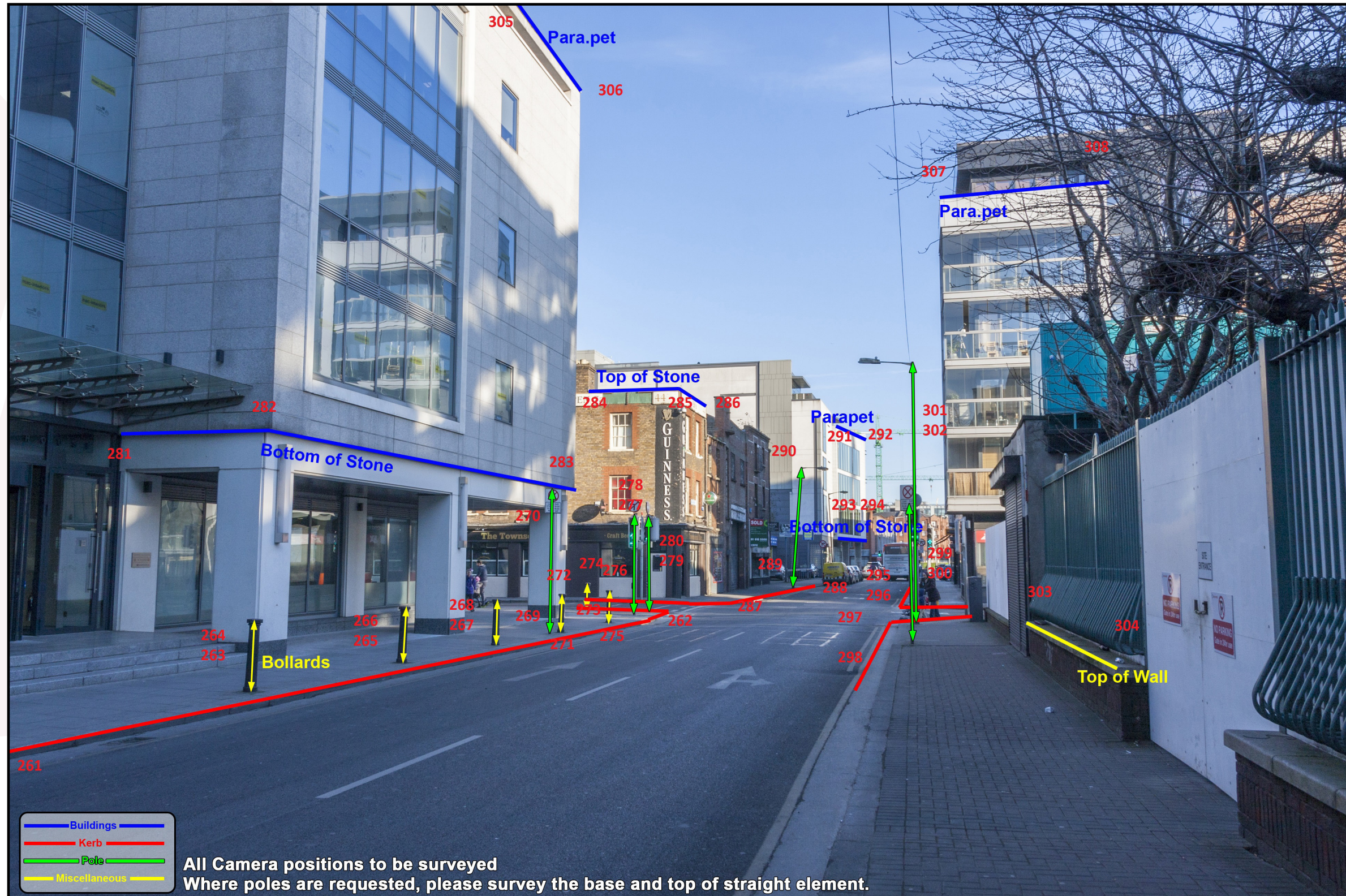
Fig.10: Fixed reference points for surveyor on Baseline untreated photo.