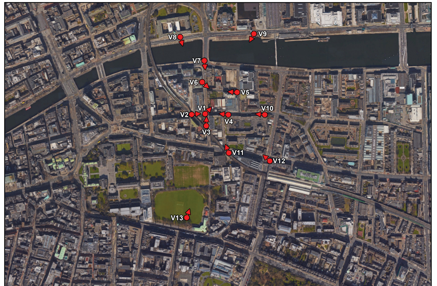
Fig.2: Viewpoint location map post site visit.