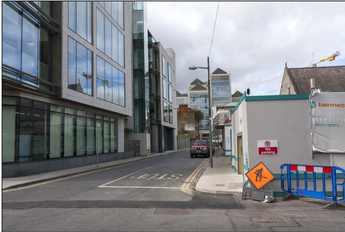
Fig.3: Baseline photo for view 5

Sample baseline photographs prior to selection and prior to marking up for surveying.