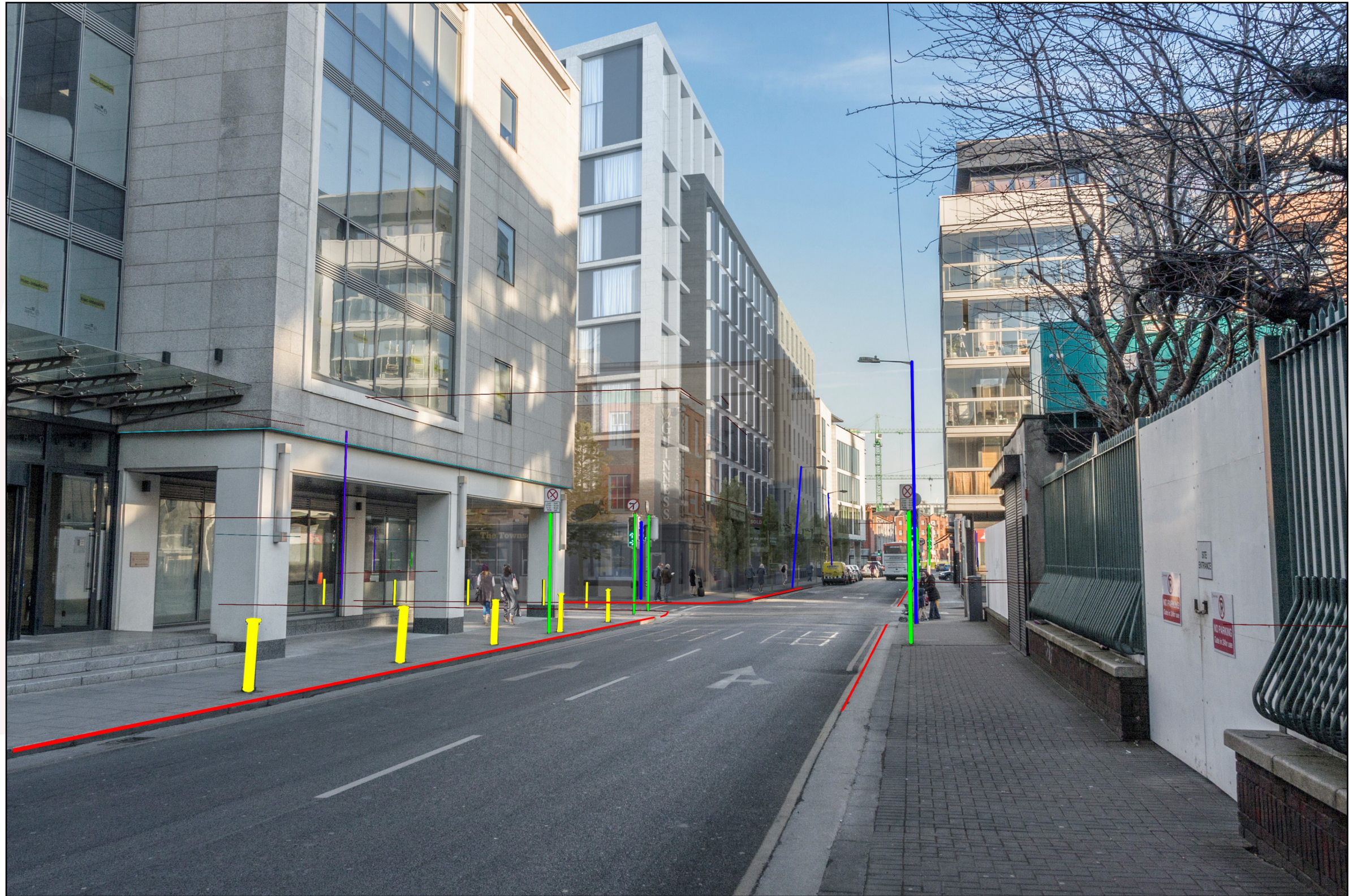
Fig.11: Fixed reference points modelled, rendered and overlaid on baseline photo confirming accuracy