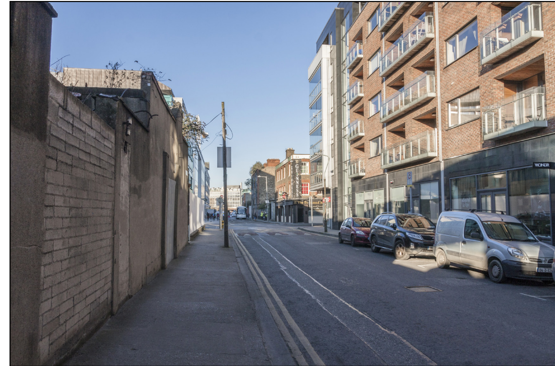
Fig.4: Baseline photo for view 3