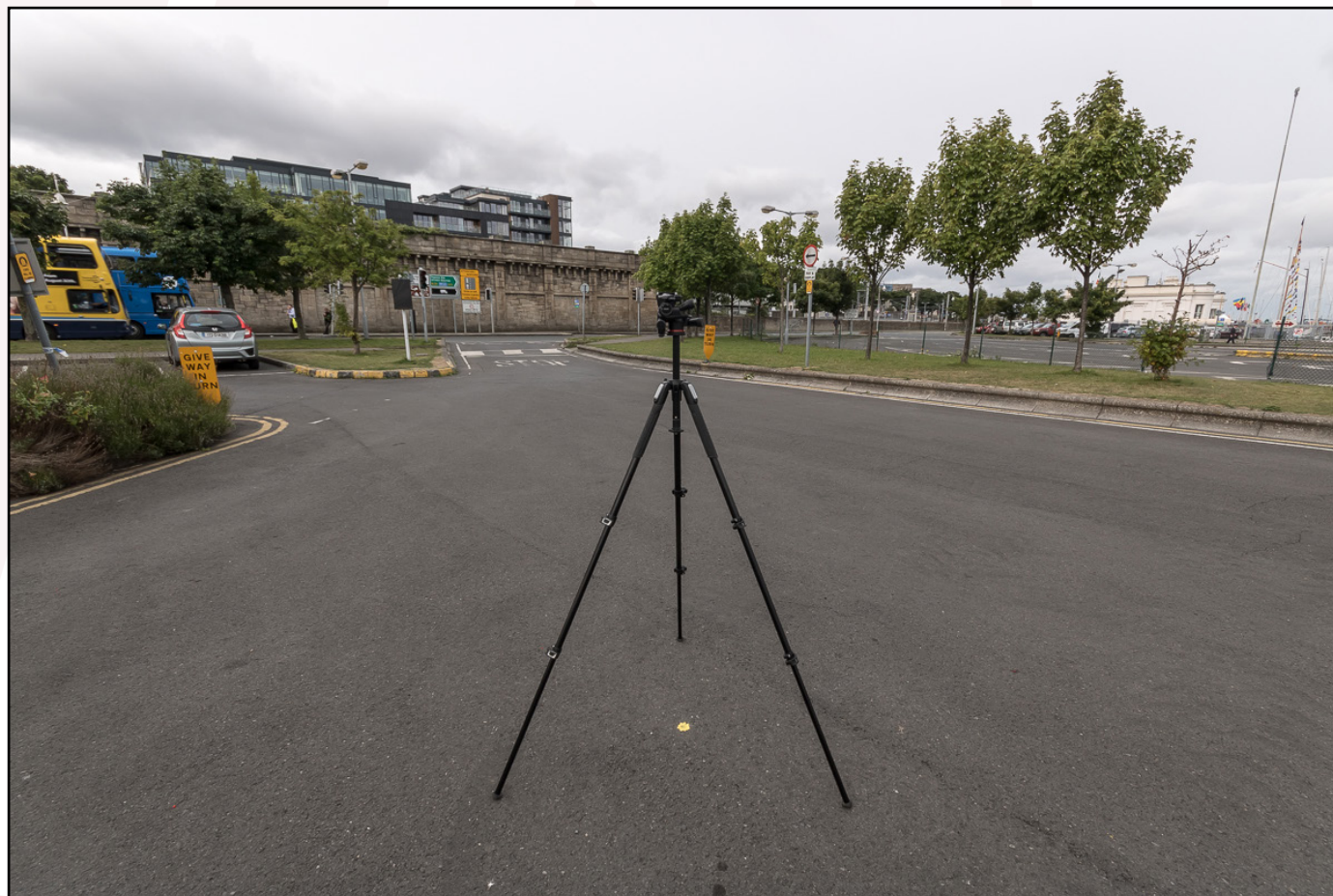
Fig.1: Camera Location marked and photographed.

All photographs go through post processing back in the studio. The full set of photos along with a viewpoint location map (Fig 2 below) are issued to the client for review and to choose the best shots that will demonstrate the visual impact that the proposed scheme may/may not have. For each photo at each location, two focal lengths will be issued – the 50mm option and a wider field of view option. The most appropriate shot will be chosen depending on the surrounding context and location of the shot. See earlier section 3.2 for further explanation.