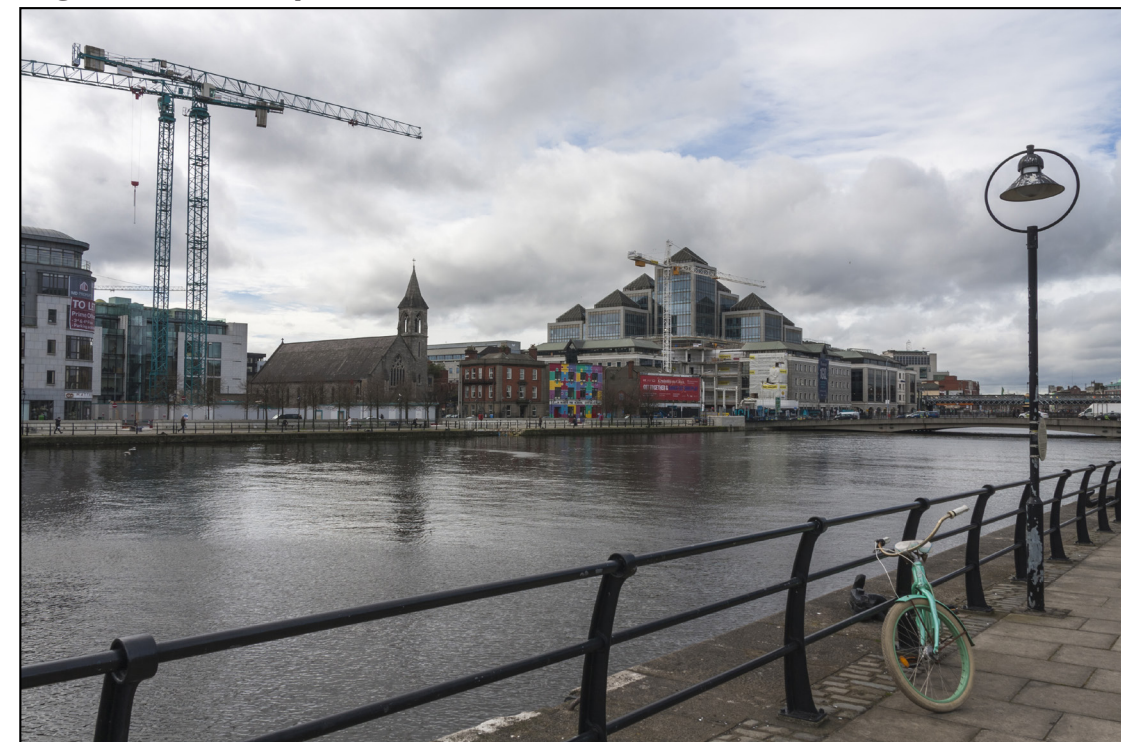
Fig.6: Baseline photo for view 9