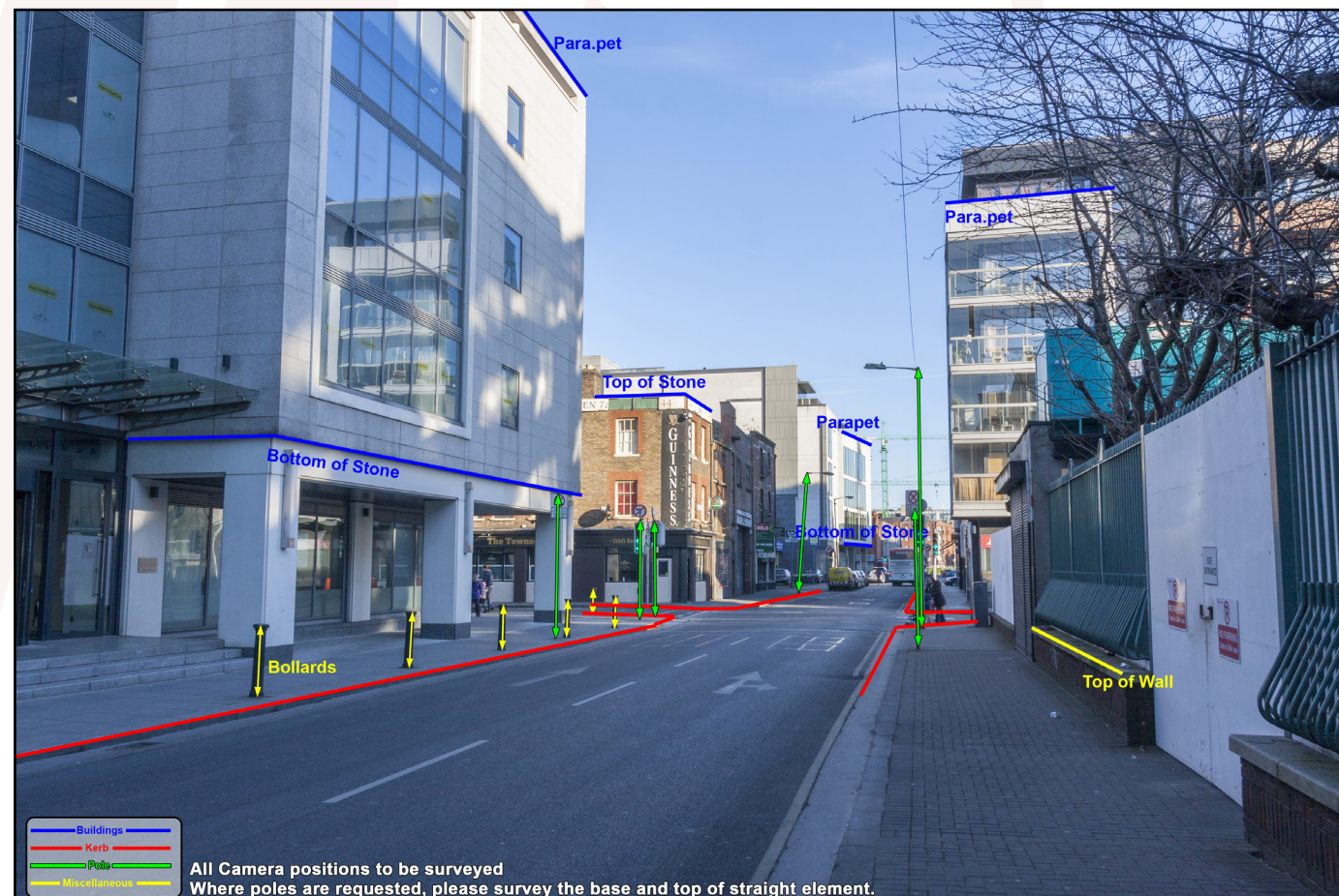
Fig.7: Fixed reference points marked for surveyour.

The survey team records the camera/tripod position using GPS and Total Station to an accuracy of +/-1cm Northing and Easting and to an accuracy of +/- 2cm Elevation. The 'marked up' fixed reference points identified in each photo are then surveyed to establish exact orientation of the view and to verify the photomontage process. (Fig 8 below). This survey data is later modelled and included in the digital 3D model of the proposed development. (See section 3.4)