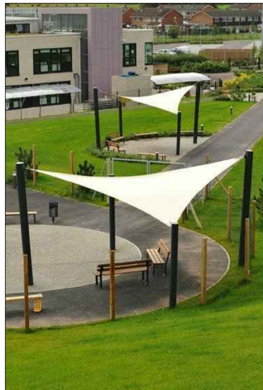
PRECEDENT IMAGE REPRESENTING THE DESIGN INTENT FOR THE CANOPY STRUCTURE.