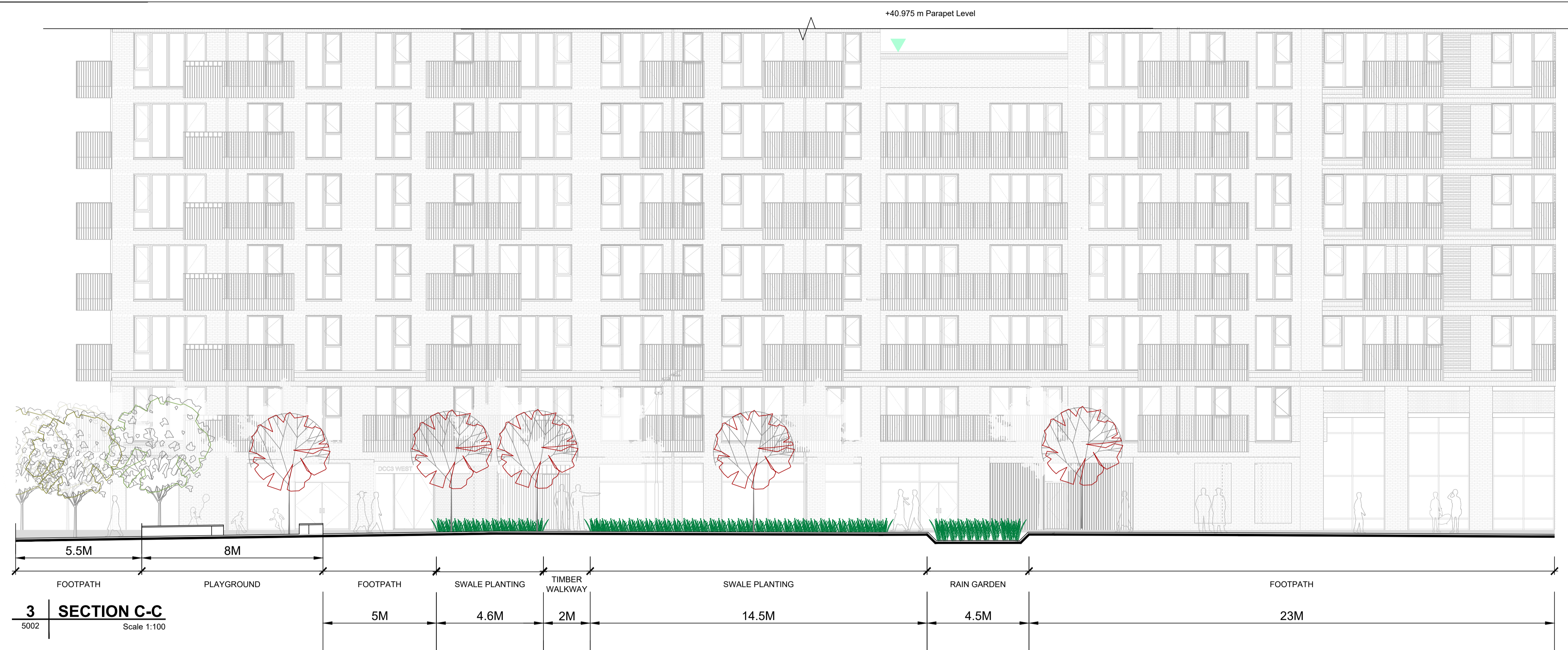
3 SECTION C-C 5002 Scale 1:100