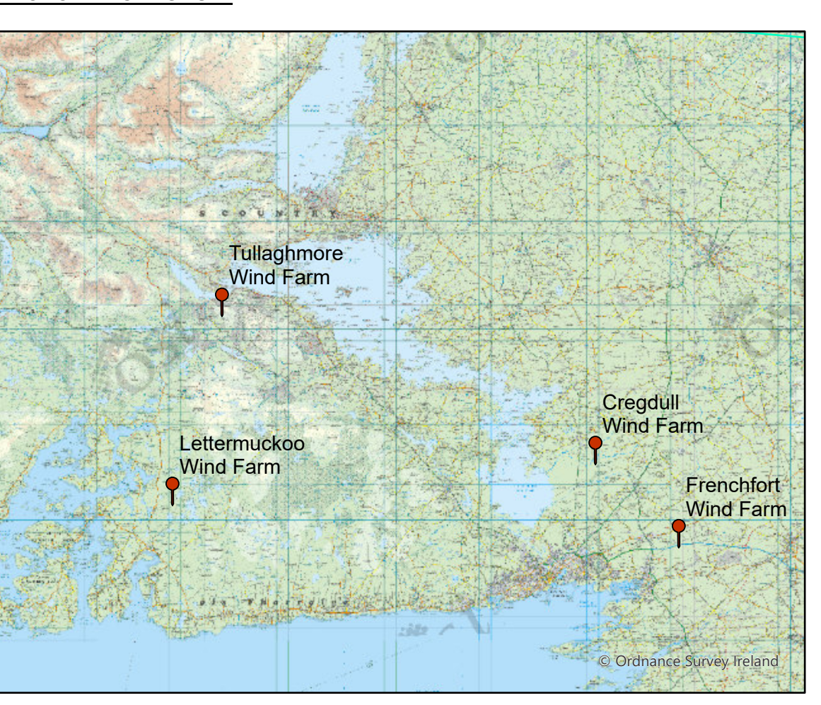
PROPOSED WIND FARM LOCATIONS