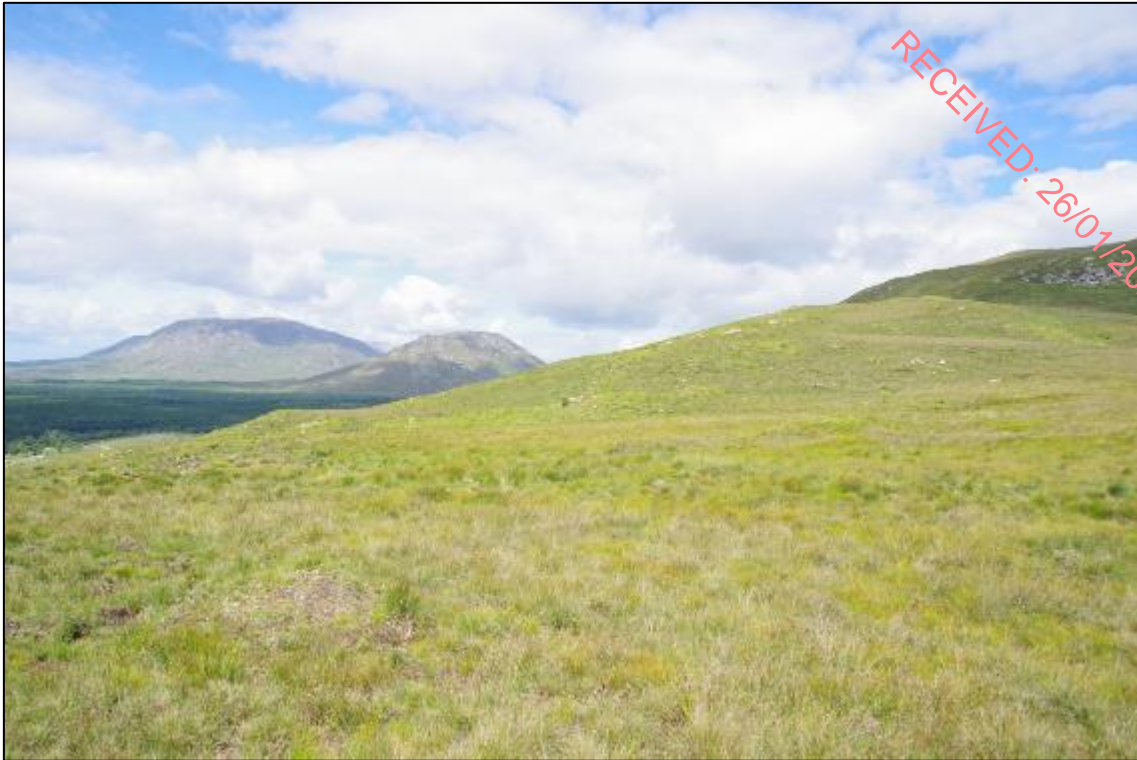
Plate 13.5: View towards proposed location of T5 from southeast