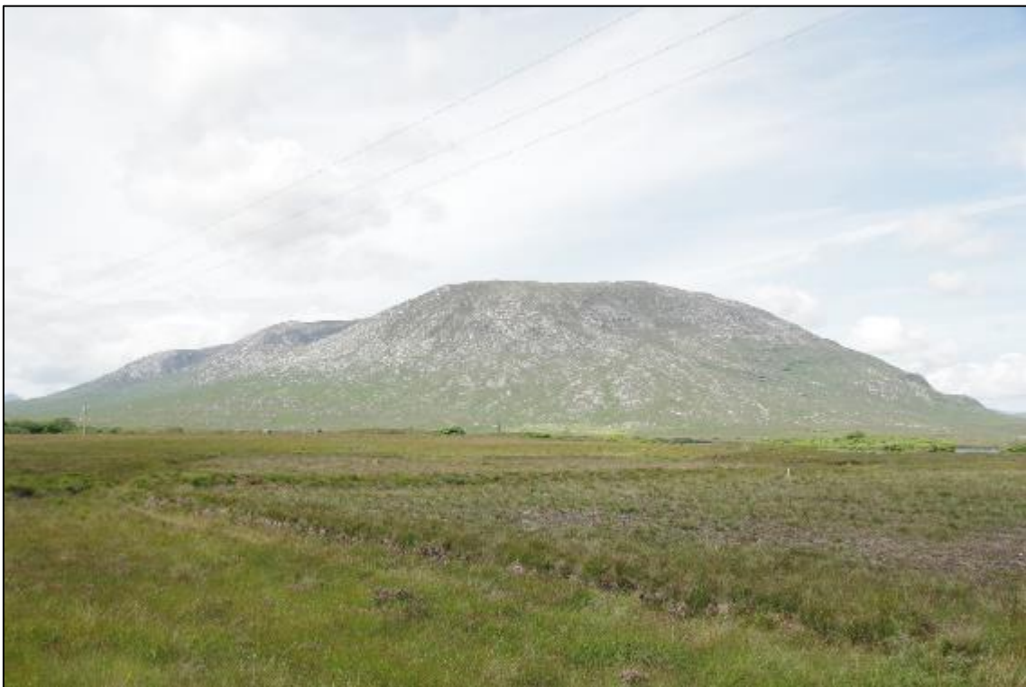
Plate 13.12: View of northern spoil/enhancement area from southeast