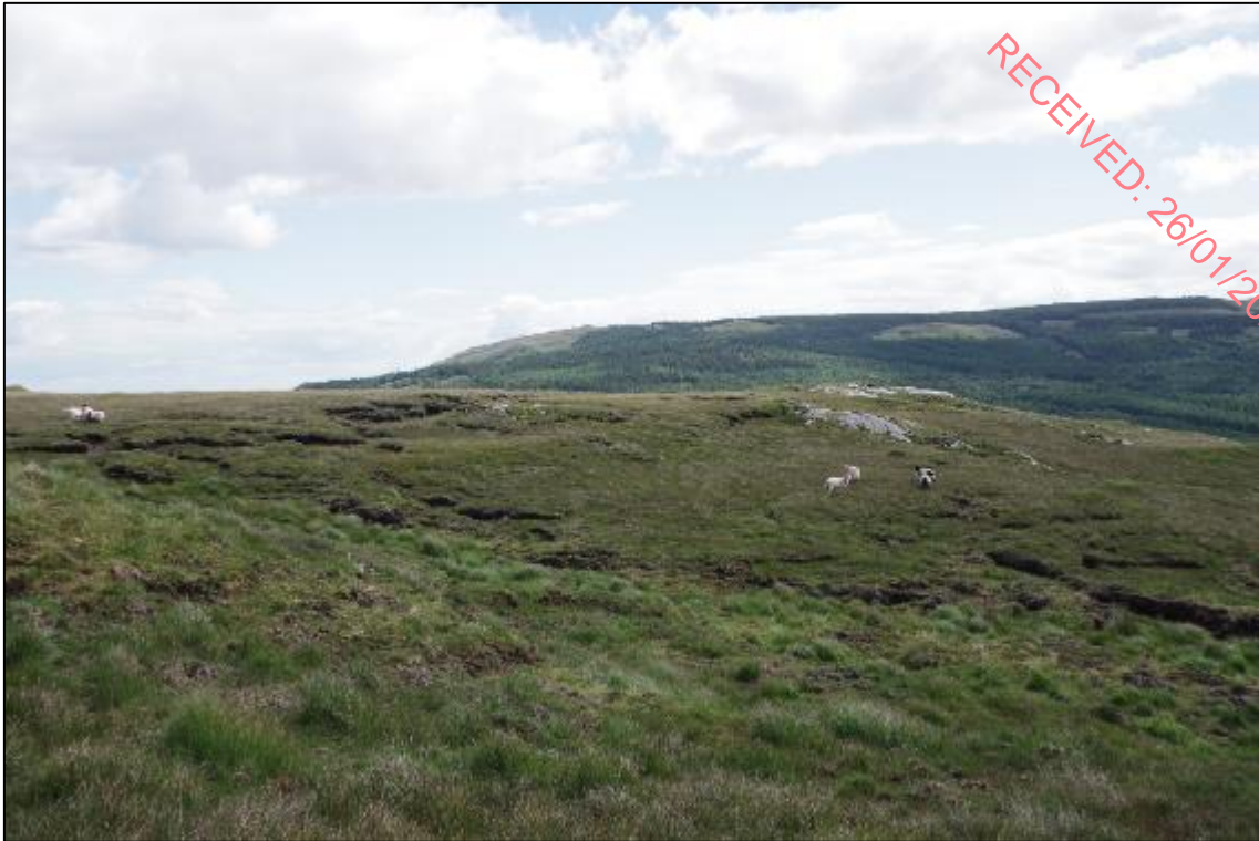
Plate 13.3: View towards proposed location of T3 from west