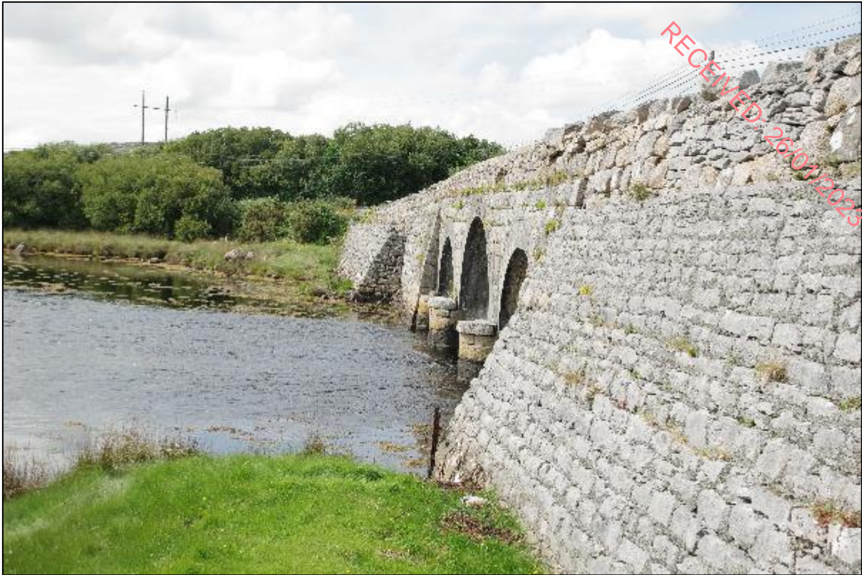
Plate 13.19: South façade of bridge PS3959 on grid route from east