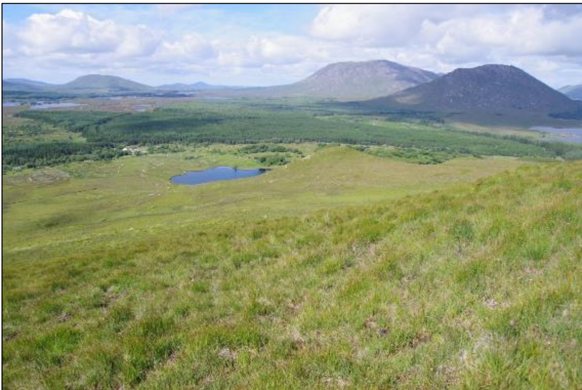
Plate 13.4: View towards proposed location of T4 from southeast