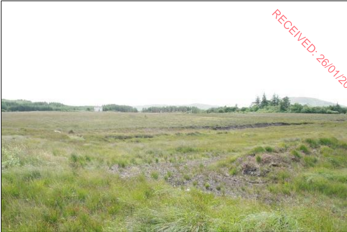
Plate 13.11: View of southern spoil/enhancement area from northeast