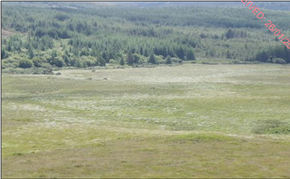
Plate 13.1: View of proposed location of T01 from northwest