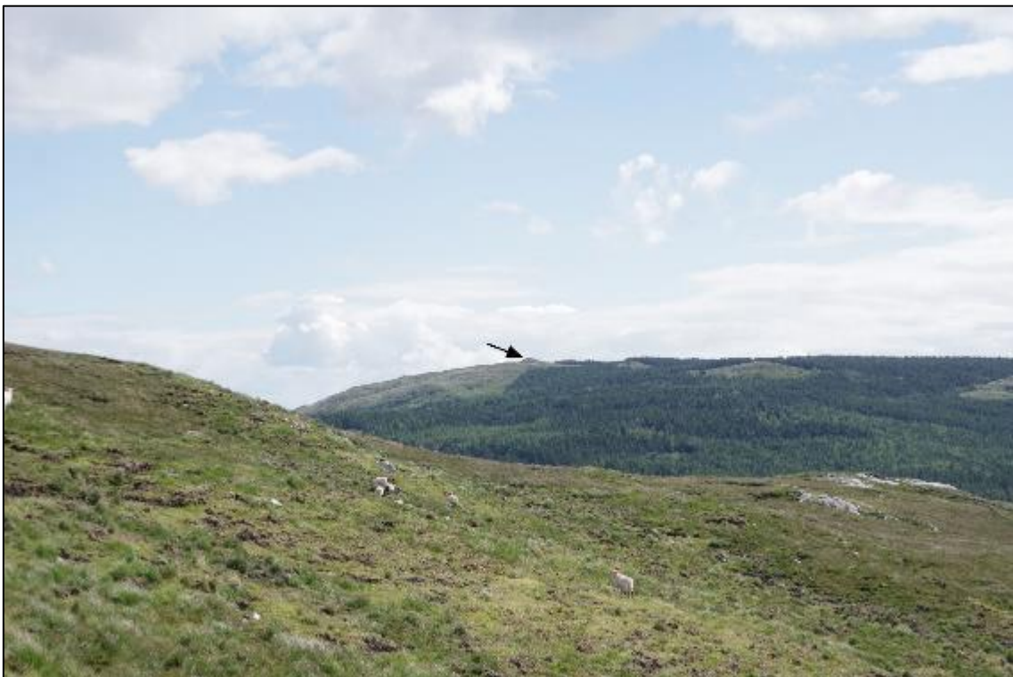
Plate 13.10: View towards Cairn GA039-010---- from Site (location indicated with arrow)