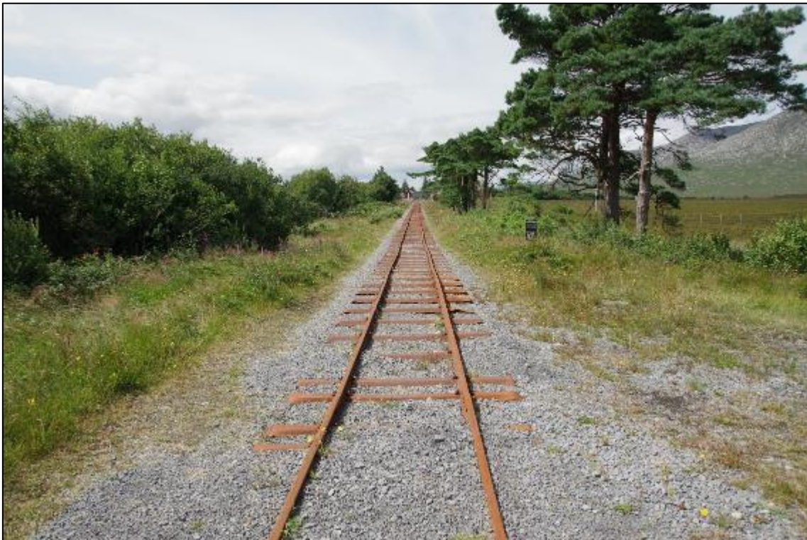
Plate 13.14: View of recently reconstructed railway line between the spoil/enhancement areas