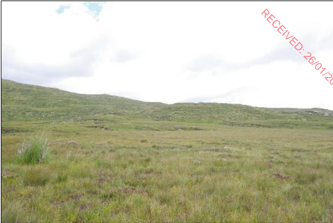
Plate 13.7: View towards proposed location of substation from west