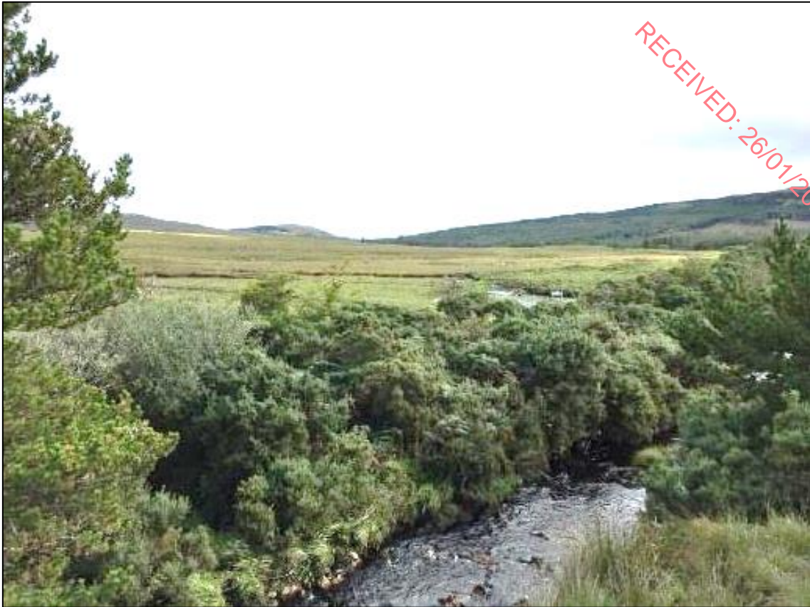
Plate 13.9: View towards former location of Letterfore Bridge (GA053-002----) from north