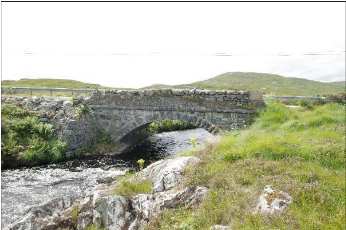
Plate 13.18: East façade of Knockdav bridge on grid route from east