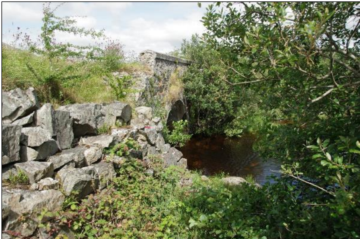
Plate 13.16: Original east façade of bridge RPS 3359 on grid route from southeast