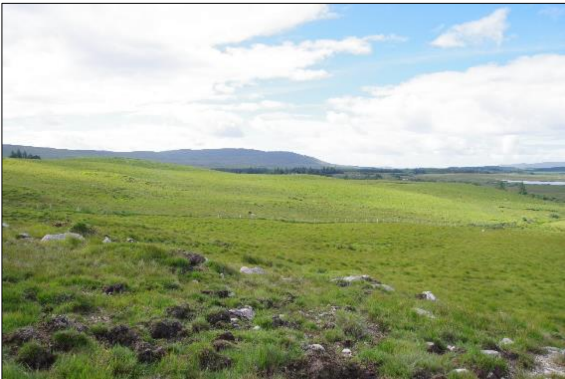
Plate 13.6: View towards proposed location of T6 from northwest