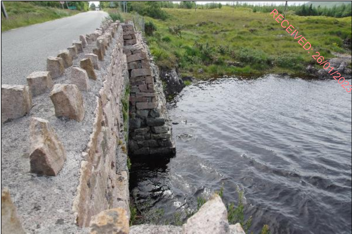
Plate 13.17: Rebuilt west façade of bridge RPS 3359 on grid route from southeast