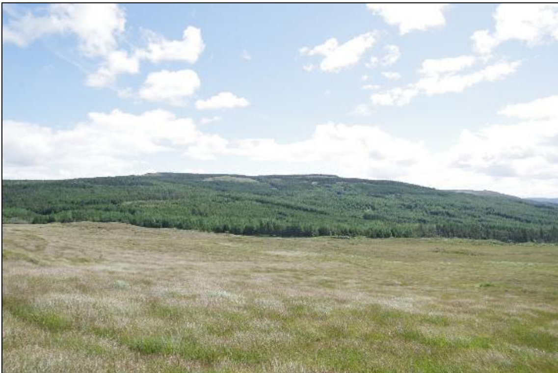
Plate 13.2: View of proposed location of T02 from west