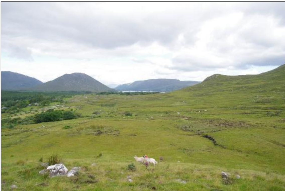
Plate 13.8: View towards proposed location of met mast from south