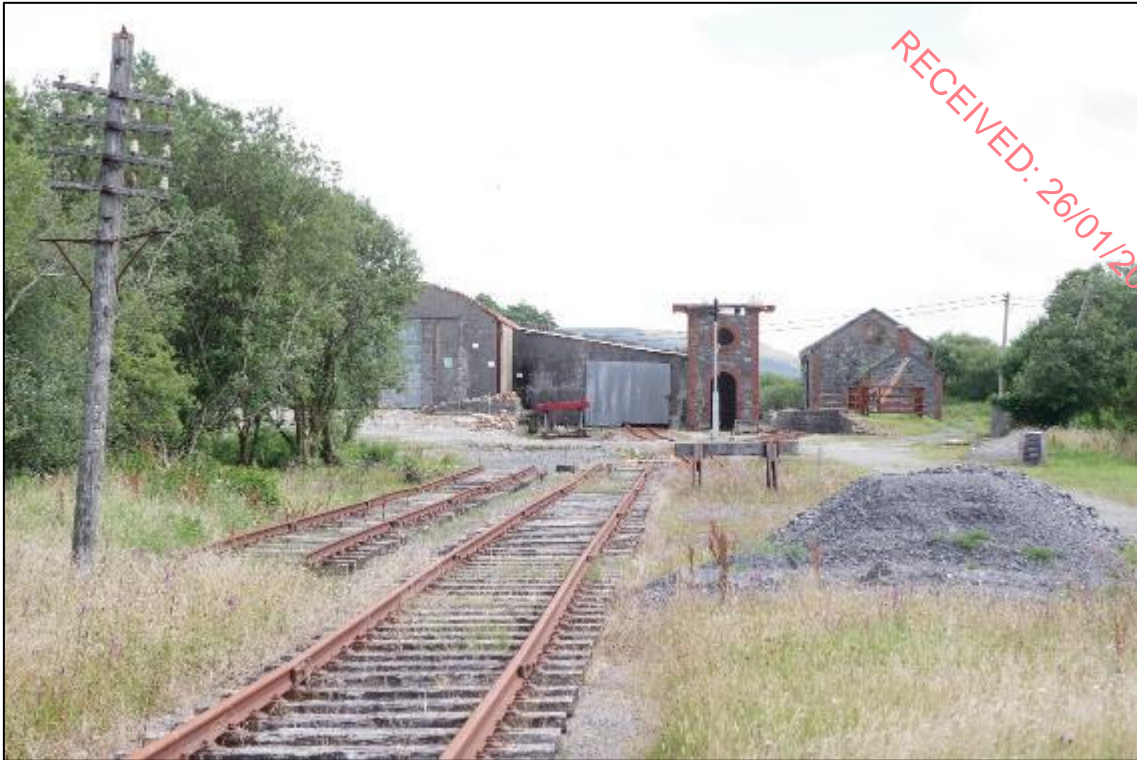
Plate 13.13: View of former Maam Cross railway station (NIAH 30403902) from west