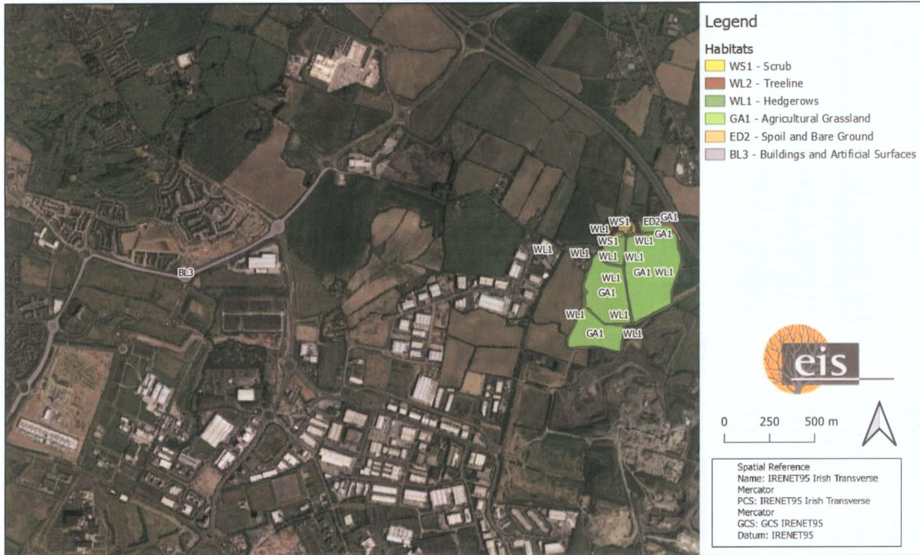
Figure 6 Habitat map of the proposed development site as of February 2022; using Fossitt coding for habitats