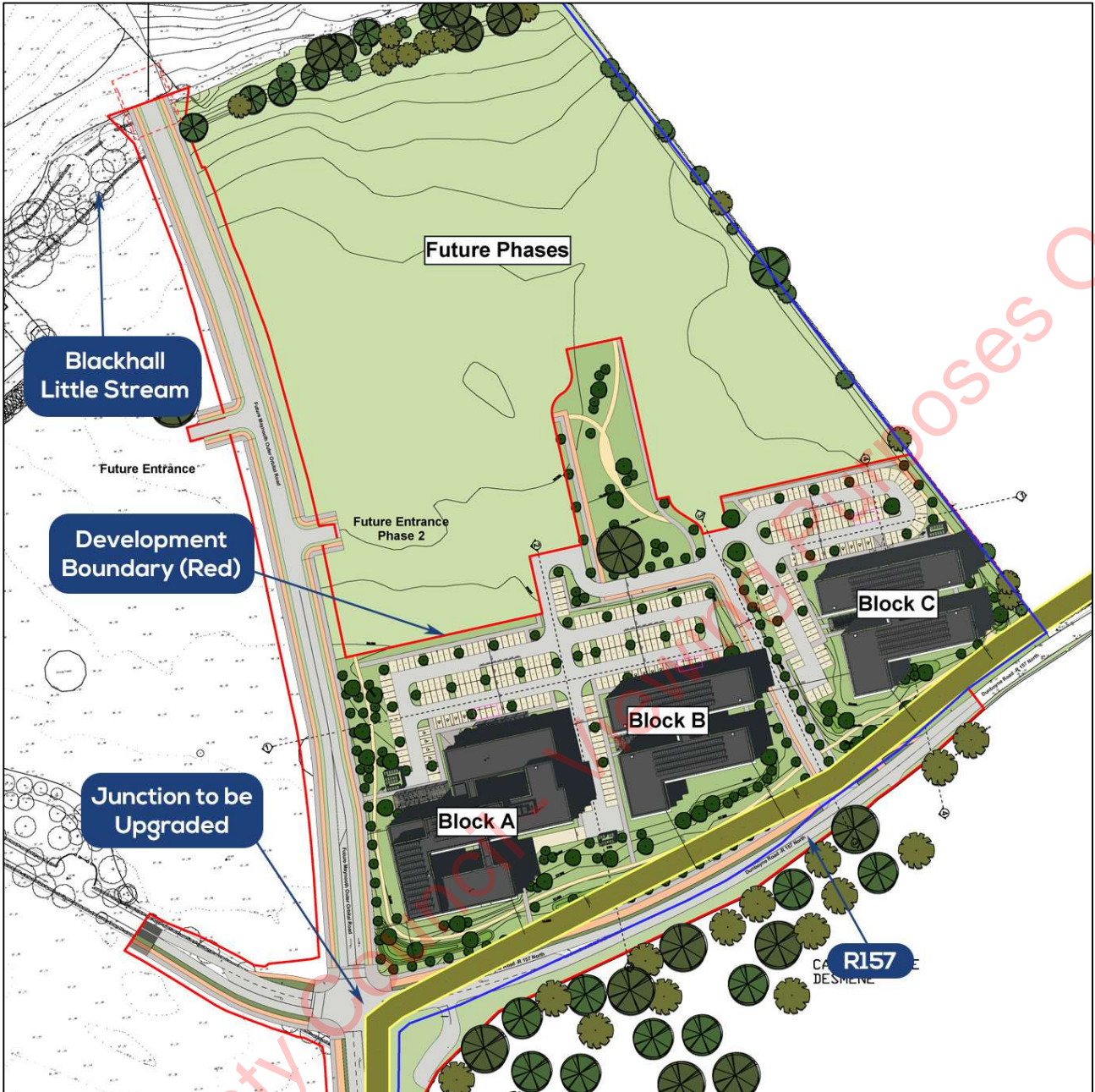
Figure 1: Site Layout