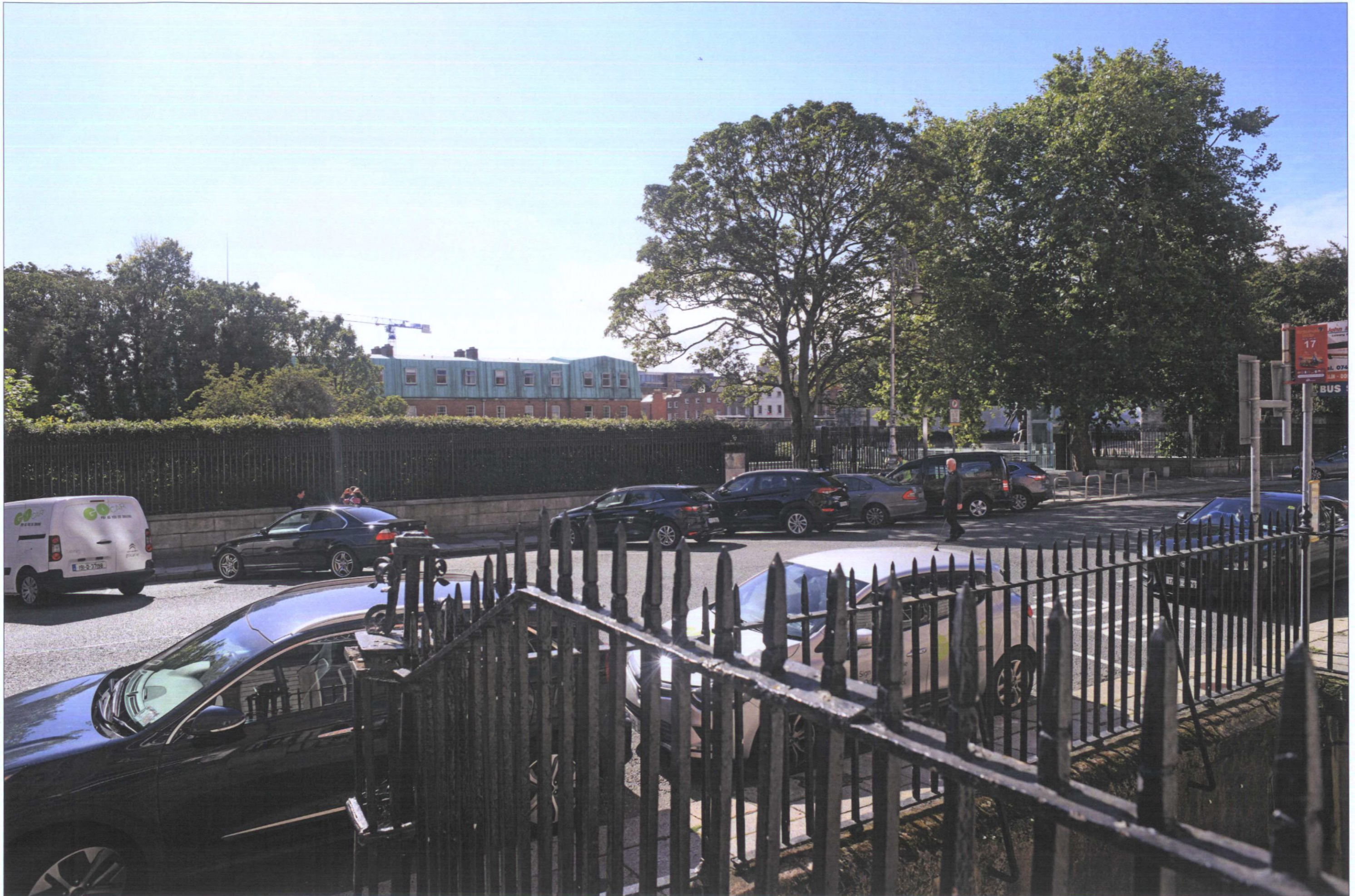
DUBLIN CENTRAL 2021 • PHOTOMONTAGE VIEWS