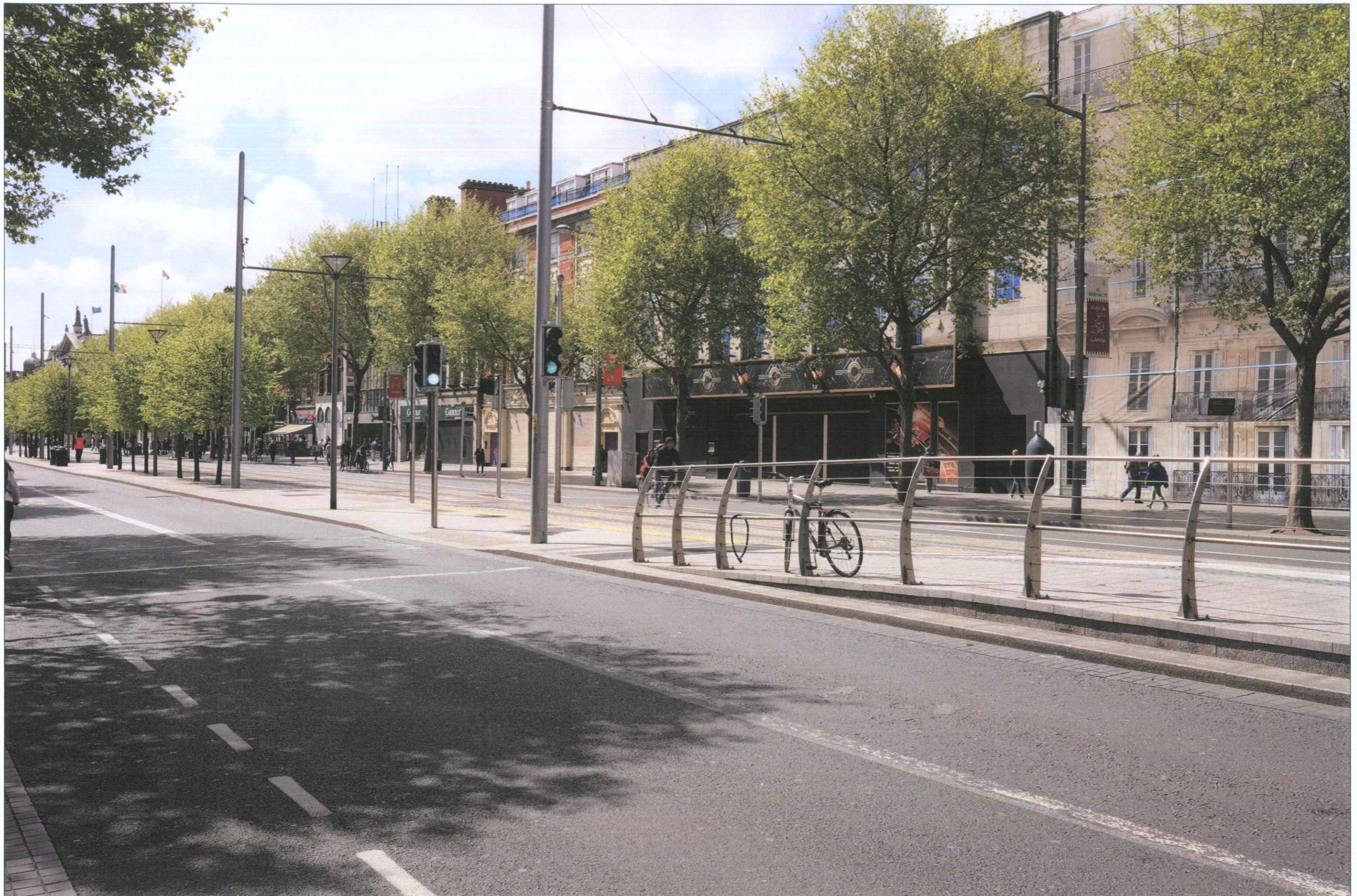
DUBLIN CENTRAL 2021 • PHOTOMONTAGE VIEWS