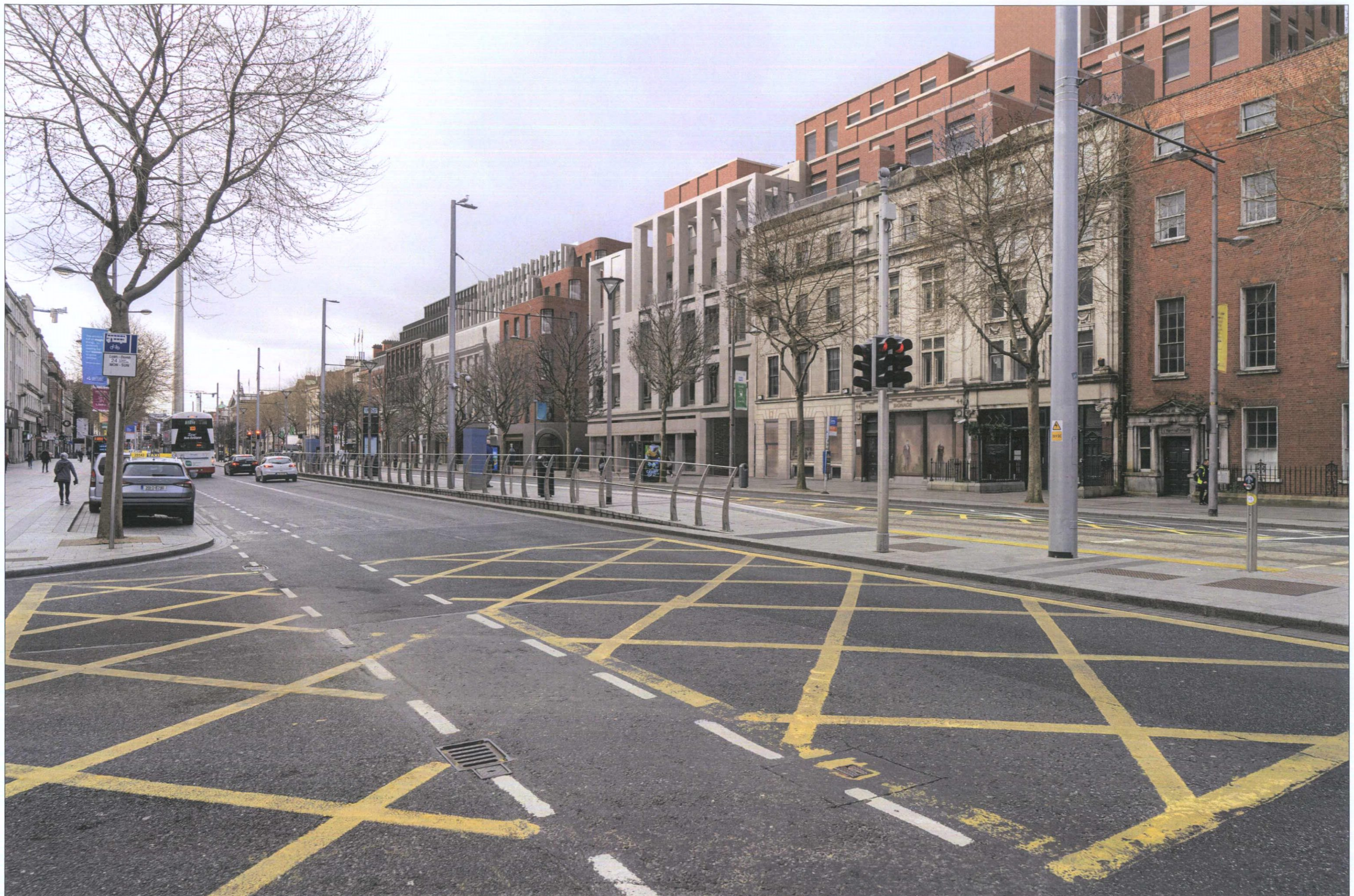
DUBLIN CENTRAL 2021 • PHOTOMONTAGE VIEWS