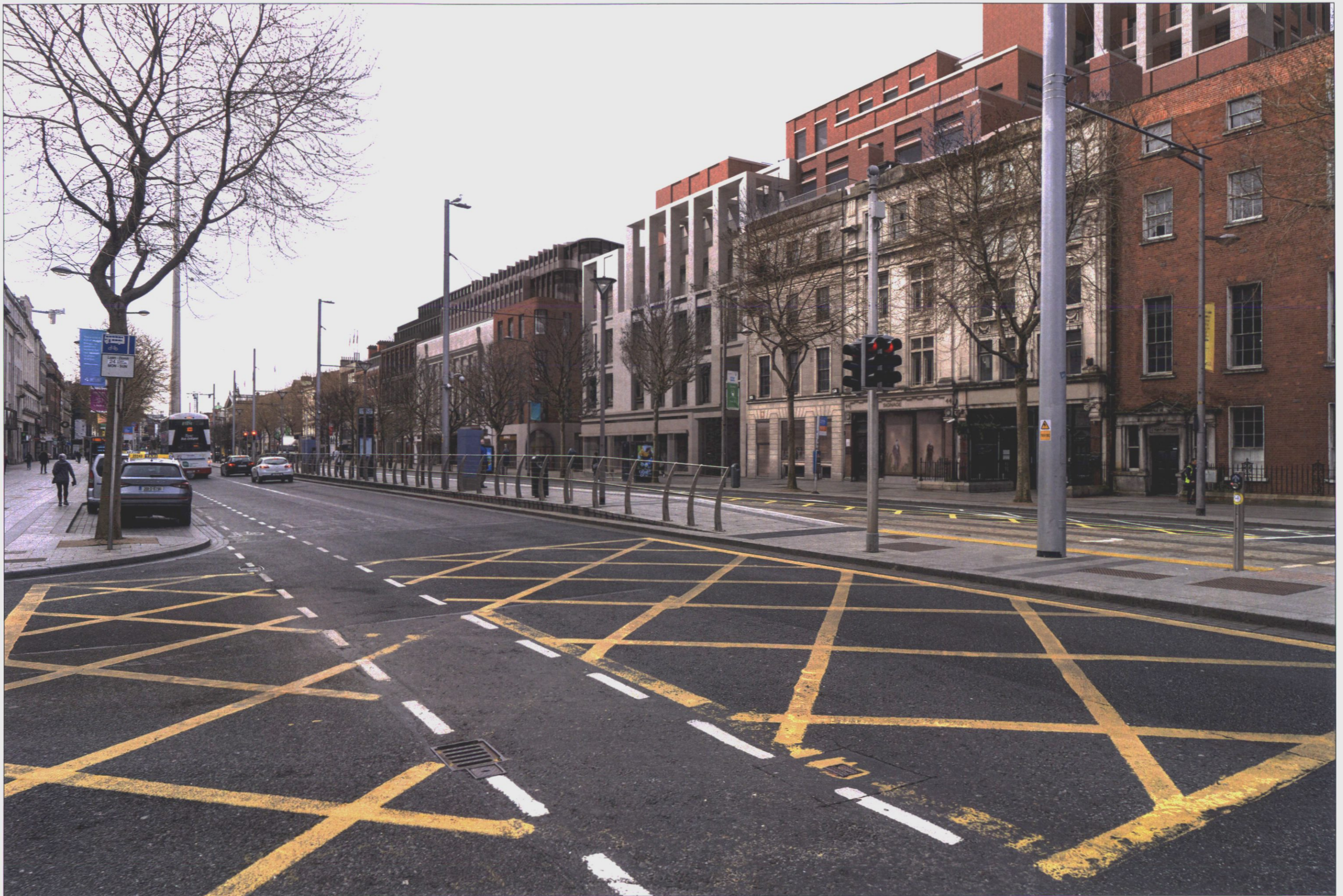
DUBLIN CENTRAL • PHOTOMONTAGE VIEWS