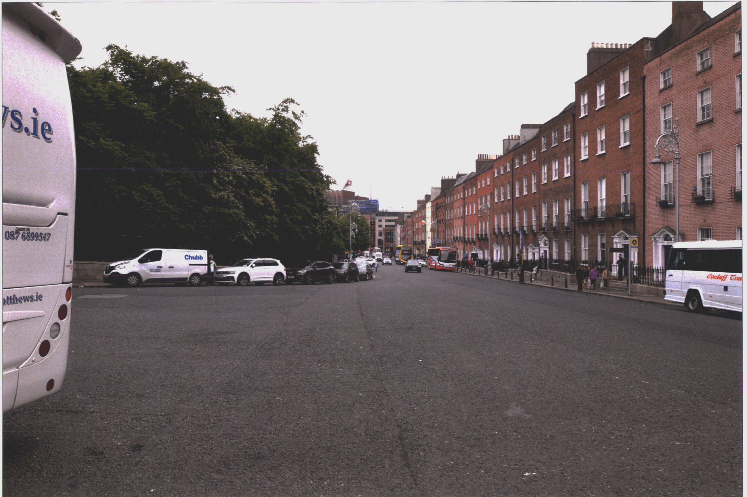
DUBLIN CENTRAL • PHOTOMONTAGE VIEWS