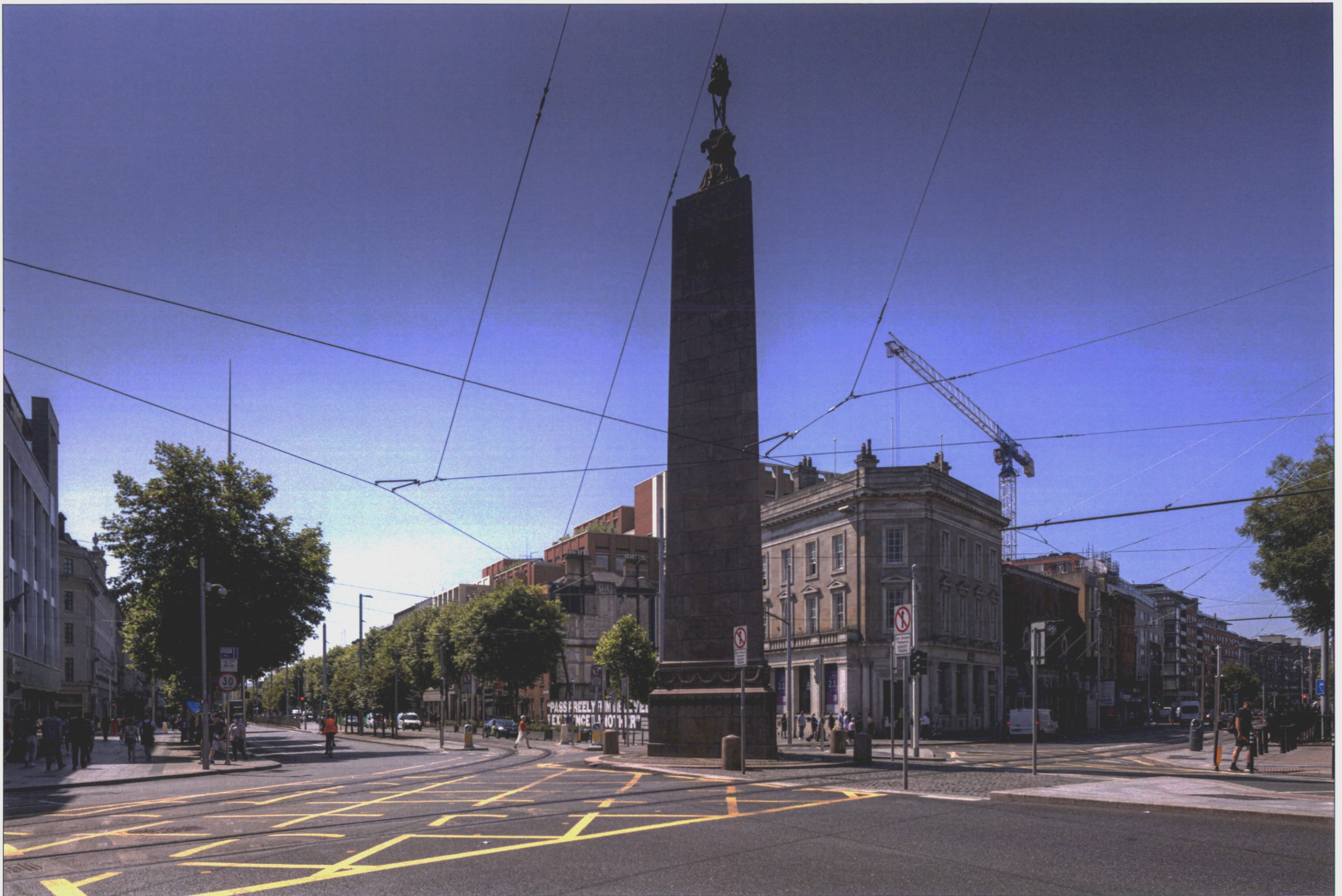
DUBLIN CENTRAL • PHOTOMONTAGE VIEWS

AS NOW PROPOSED IN RESPONSE TO A REQUEST FOR FURTHER INFORMATION