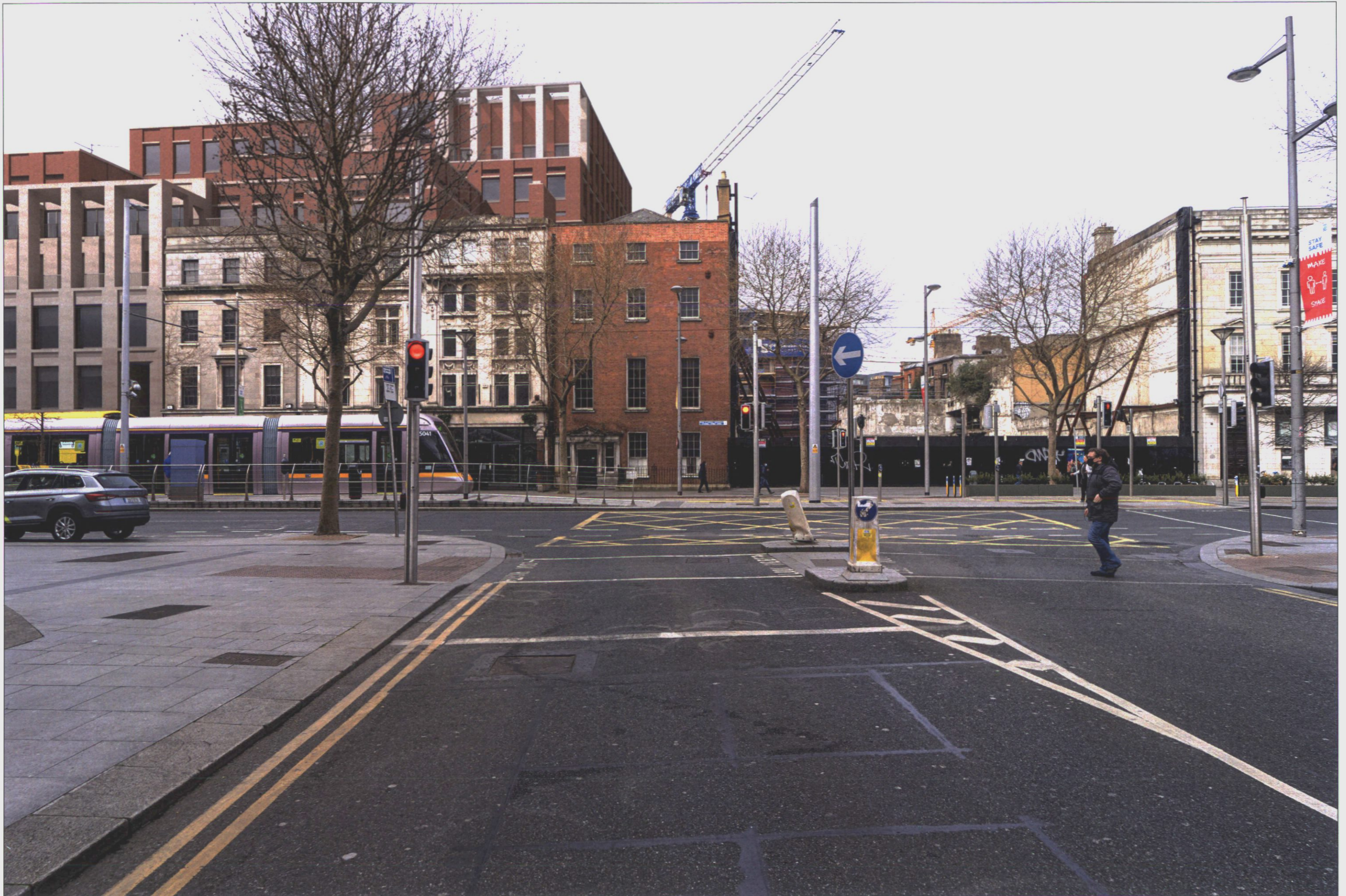
DUBLIN CENTRAL • PHOTOMONTAGE VIEWS