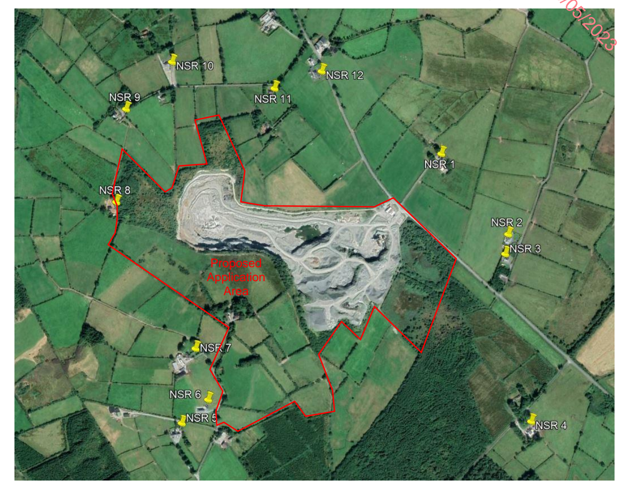
Figure 10.3: Nearest Sensitive Receptors (NSR) in proximity to Aughnacliffe Quarry

direction. Beyond 250m it is highly unlikely that any receptors will experience a dust nuisance.