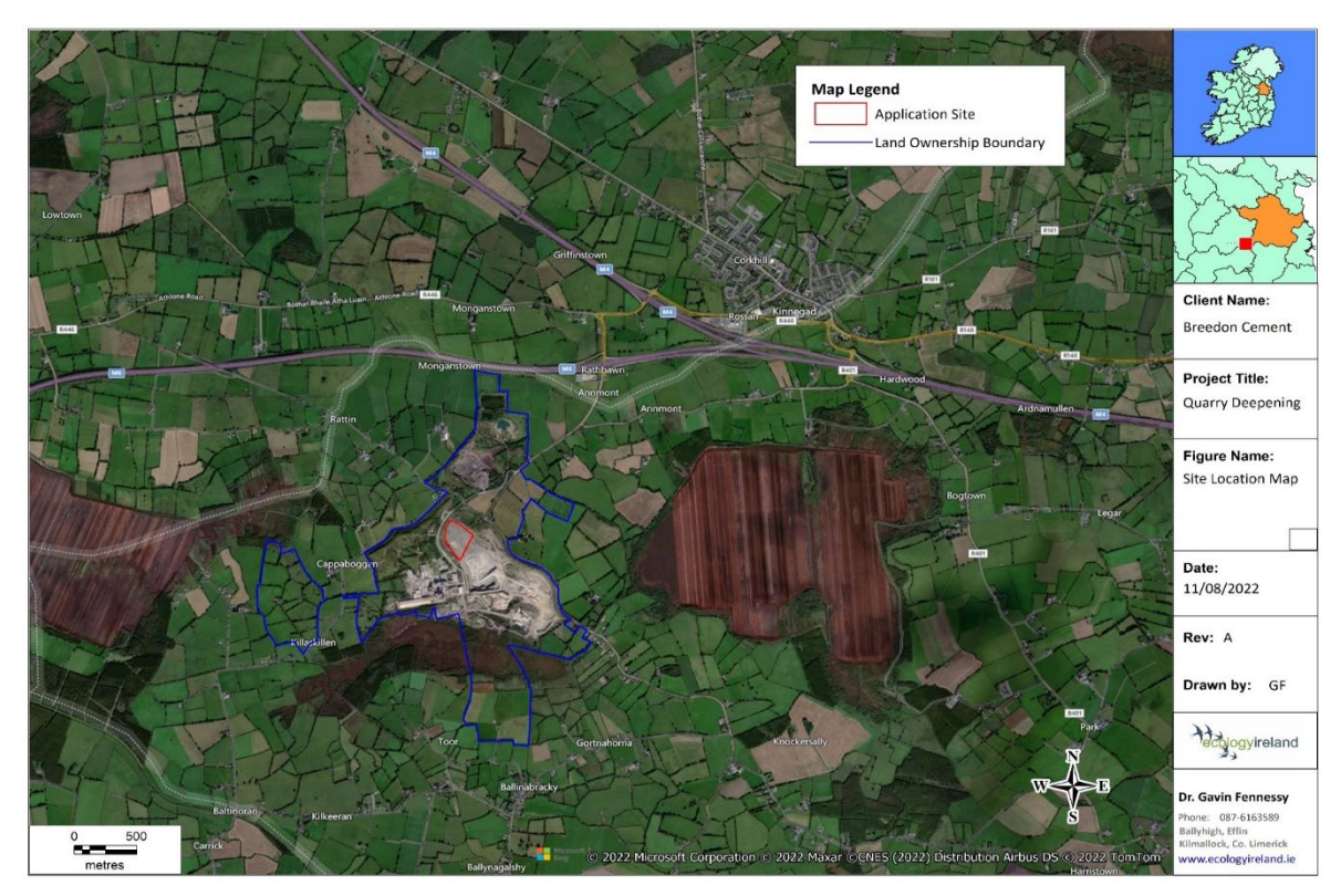
Figure 1.1: Aerial view of the site and its surrounding context, with indicative red line boundary.

This Environmental Impact Assessment Report (EIAR) relates to a proposed development by Breedon Cement Ireland Limited (hereafter referred to as Breedon or the Applicant throughout) comprising, inter alia , the deepening of the north-western portion of the current permitted limestone quarry<sup>1</sup> at Killaskillen, Kinnegad Co. Meath by four extractive benches to 10m OD, over an area of c. 4.13 hectares. The proposed development will not result in any increase to the annual output of the existing limestone quarry or to the production capacity of the existing cement plant.