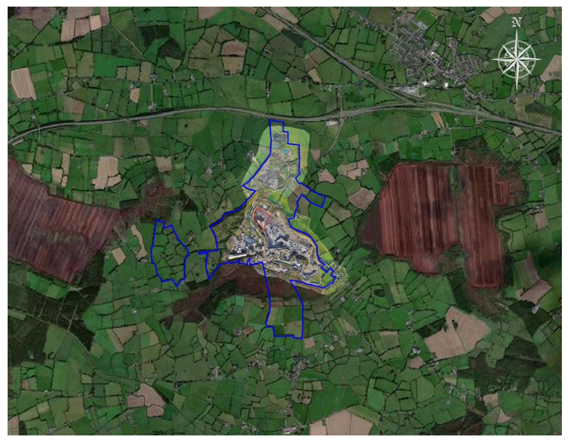
Figure 2.2: Location of Subject Site (indicative site outlined red).

The nearest surface watercourse to the application site is the Kinnegad River which forms the northern boundary of the landholding. The general character of the landscape immediately north of the site is an open river valley with few trees and only low intermittent hedges. A number of field boundaries near the Kinnegad River are simple post and wire fences. The course of the Kinnegad River has been straightened in sections, including that forming the northern boundary of the overall cement plant site. To the east is slightly higher ground with dense tree and hedge cover, while to the west is an area of open fields and hedges lying along the valley of the Kinnegad River.