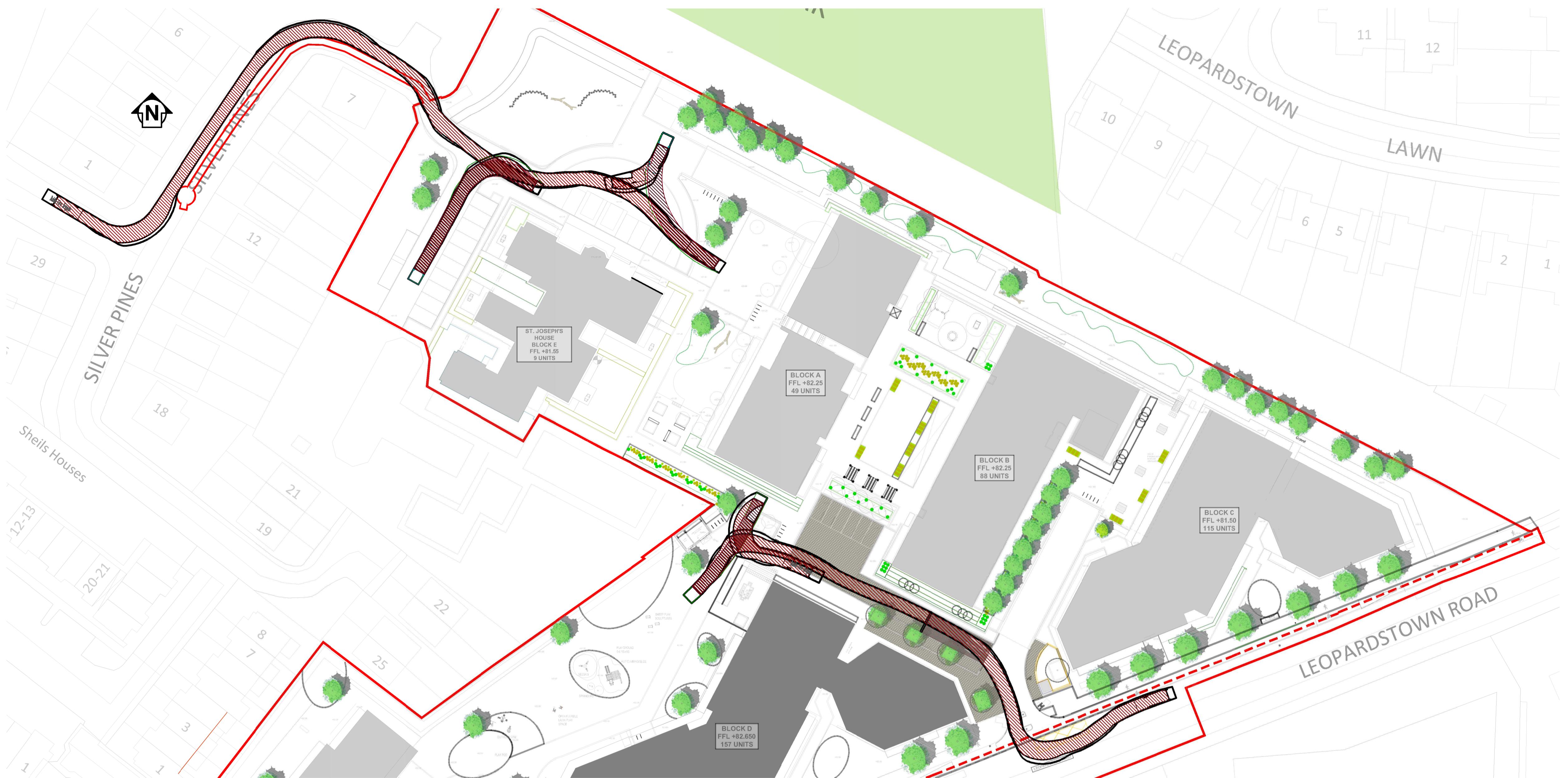
SWEPT PATH ANALYSIS - FIRE TENDER NORTH ACCESS