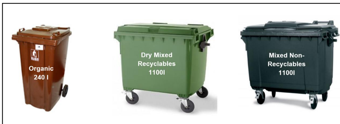
Figure 5.1 Typical waste receptacles of varying size (240L and 1100L)