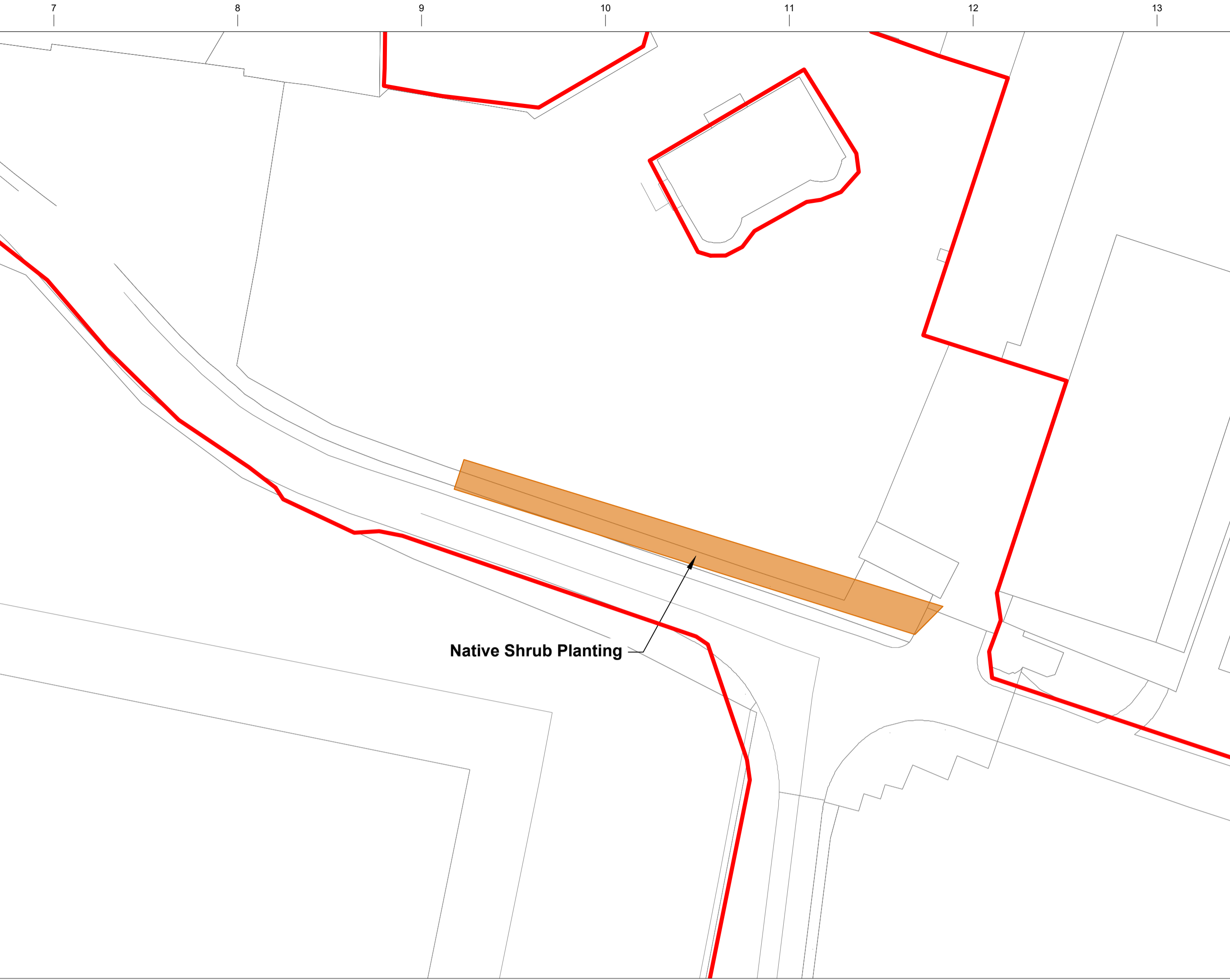
PIGEON HOUSE ROAD AREA