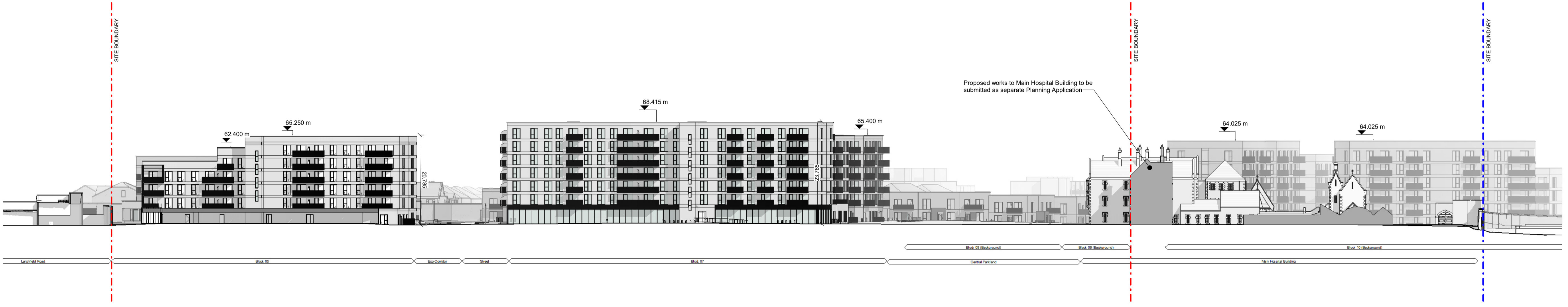
Site Wide Section E-E Part 10 1 : 500