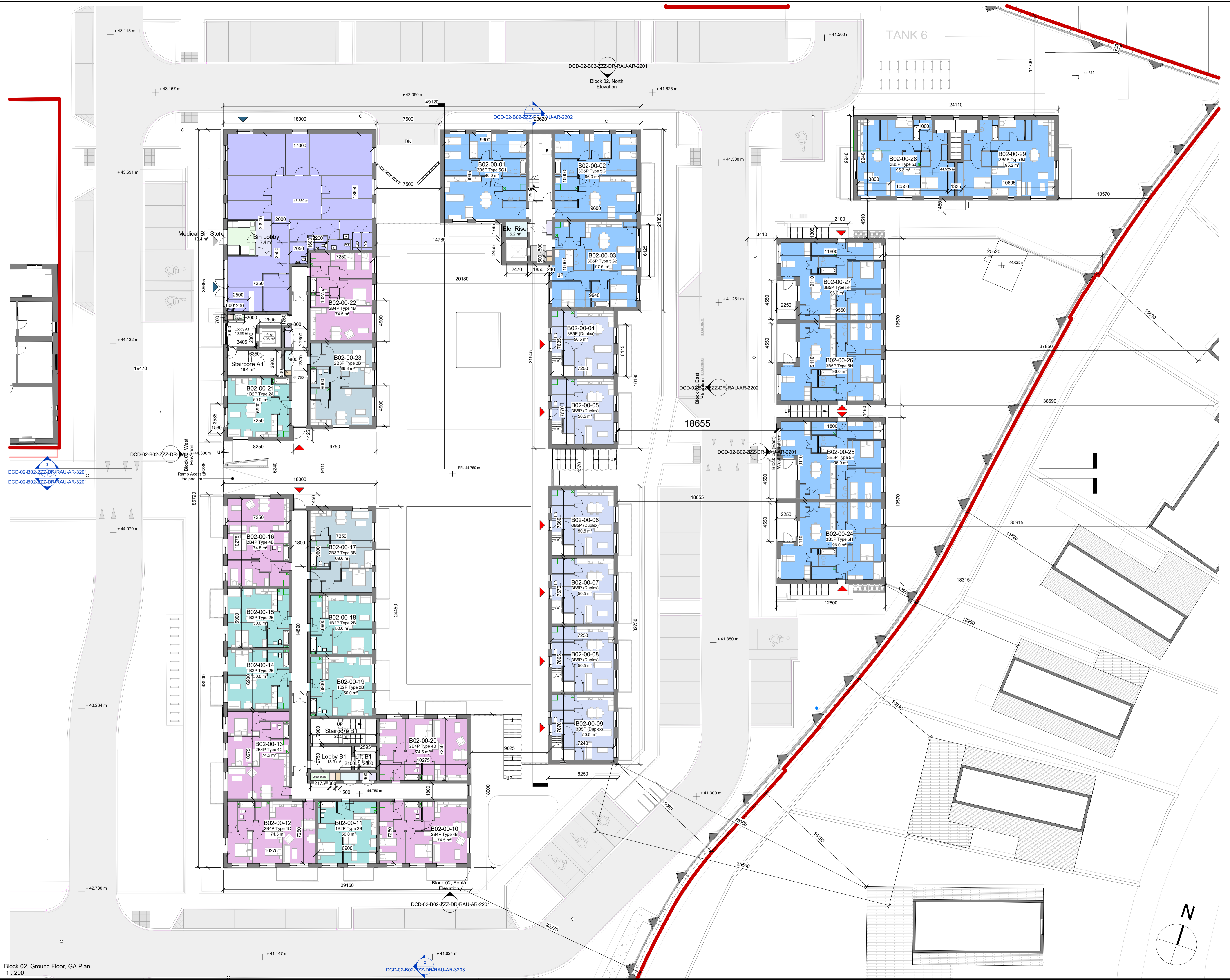
Block 02, Ground Floor, GA Plan 1 : 200

Notes: - Do not scale from this drawing. Use figured dimensions in all cases. - Verify dimensions on site and report any discrepancies to the Architect immediately. - This drawing is to be read in conjunction with the Architect's Specification. - © This drawing is copyright and may only be reproduced with the Architect's permission.