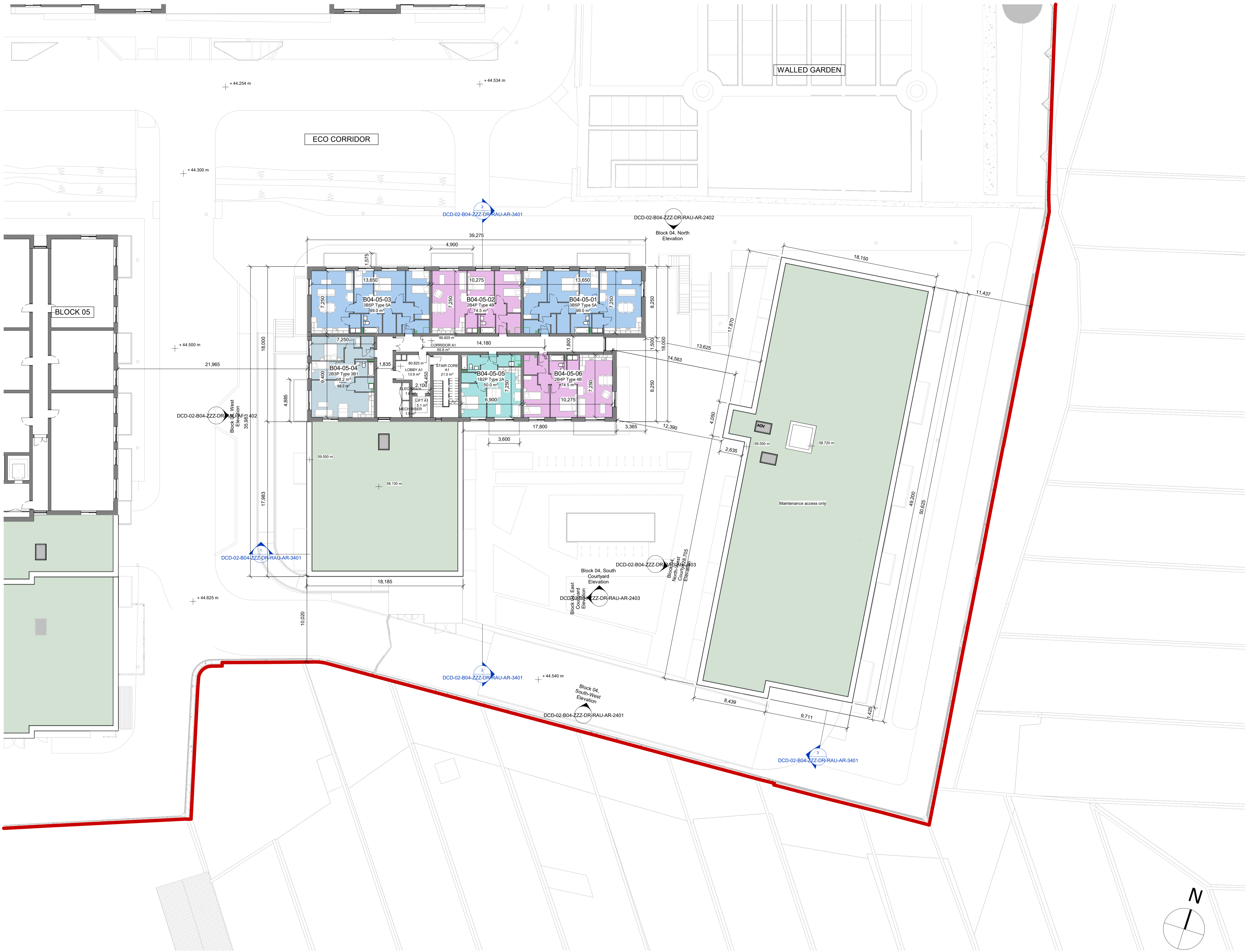
L05 Block 04, Fifth Floor Level 1 : 200

Notes: - Do not scale from this drawing. Use figured dimensions in all cases. - Verify dimensions on site and report any discrepancies to the Architect immediately. - This drawing is to be read in conjunction with the Architect's Specification. - © This drawing is copyright and may only be reproduced with the Architect's permission.