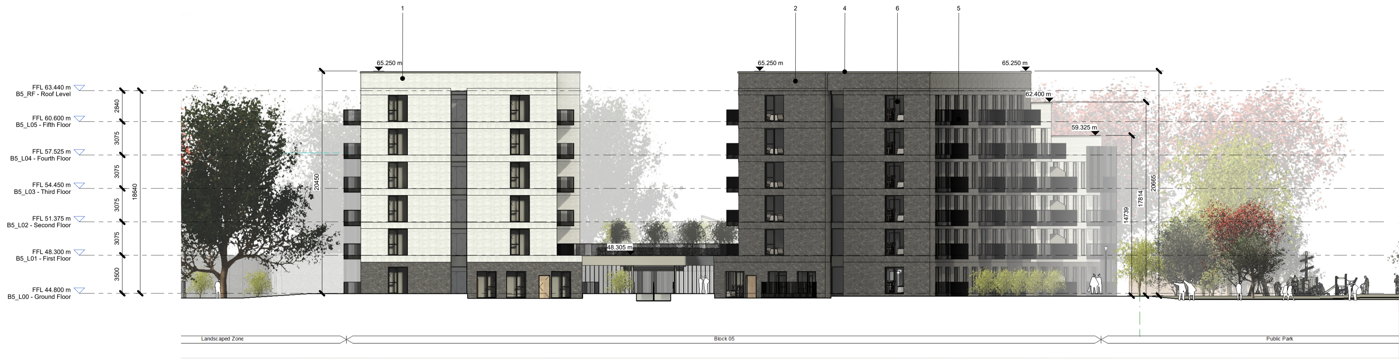
Block 05, North Elevation 1 : 200