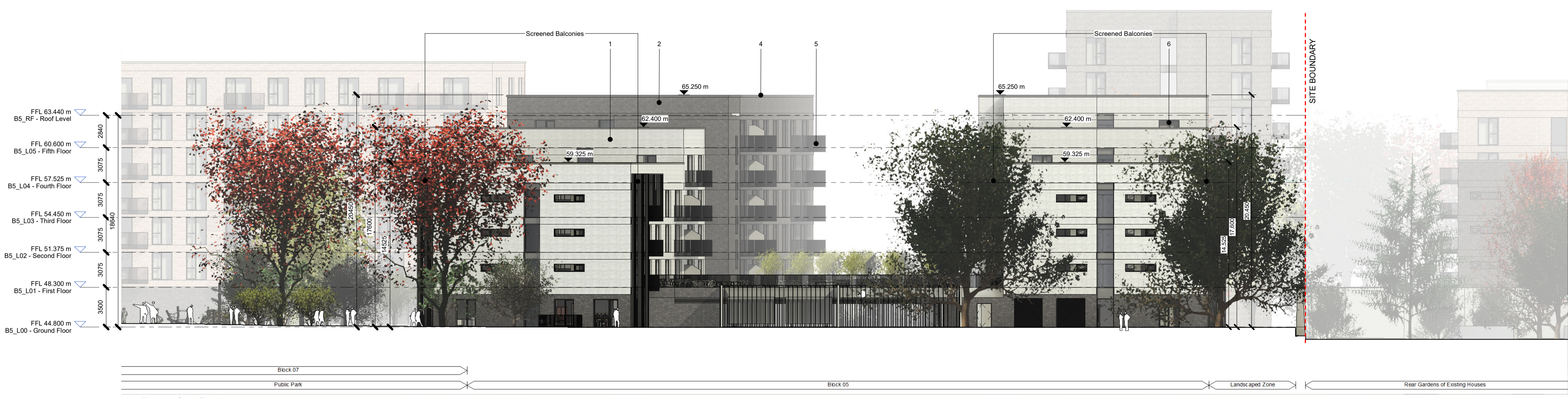
Block 05, South Elevation 1 : 200