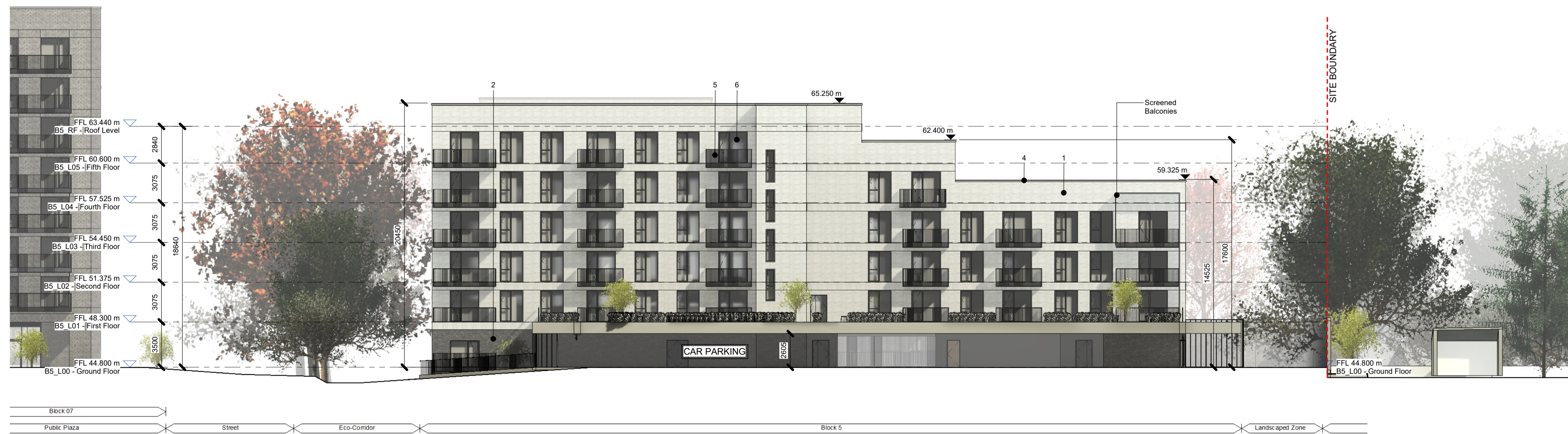
Block 05, N/S Section D-D1 1 : 200

Notes: - Do not scale from this drawing. Use figured dimensions in all cases. - Verify dimensions on site and report any discrepancies to the Architect immediately. - This drawing is to be read in conjunction with the Architect's Specification. - © This drawing is copyright and may only be reproduced with the Architect's permission.