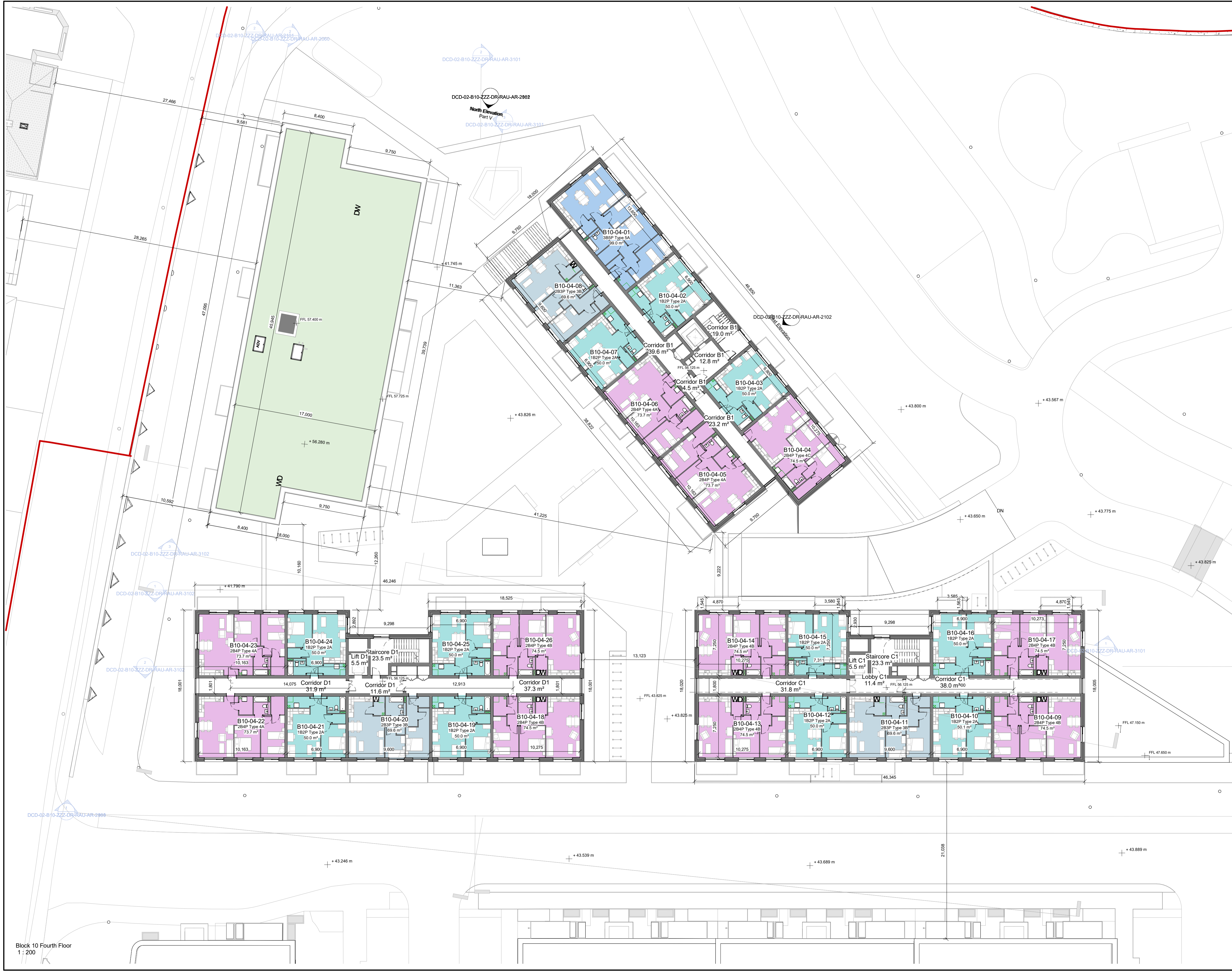
Block 10 Fourth Floor 1 : 200

Notes: - Do not scale from this drawing. Use figured dimensions in all cases. - Verify dimensions on site and report any discrepancies to the Architect immediately. - This drawing is to be read in conjunction with the Architect's Specification. - © This drawing is copyright and may only be reproduced with the Architect's permission.