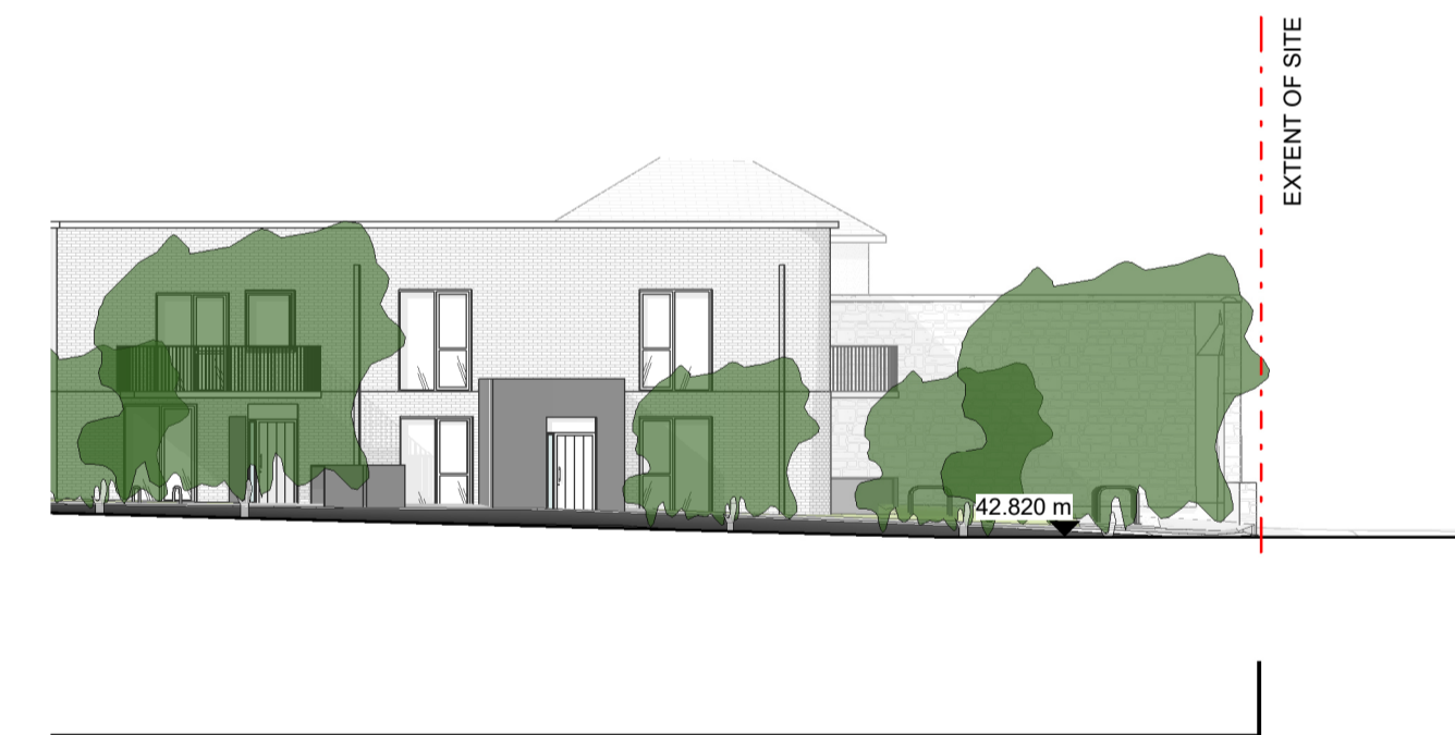
Site Entrance Section - Main Gate South Cross Section (Proposed) 1 : 200