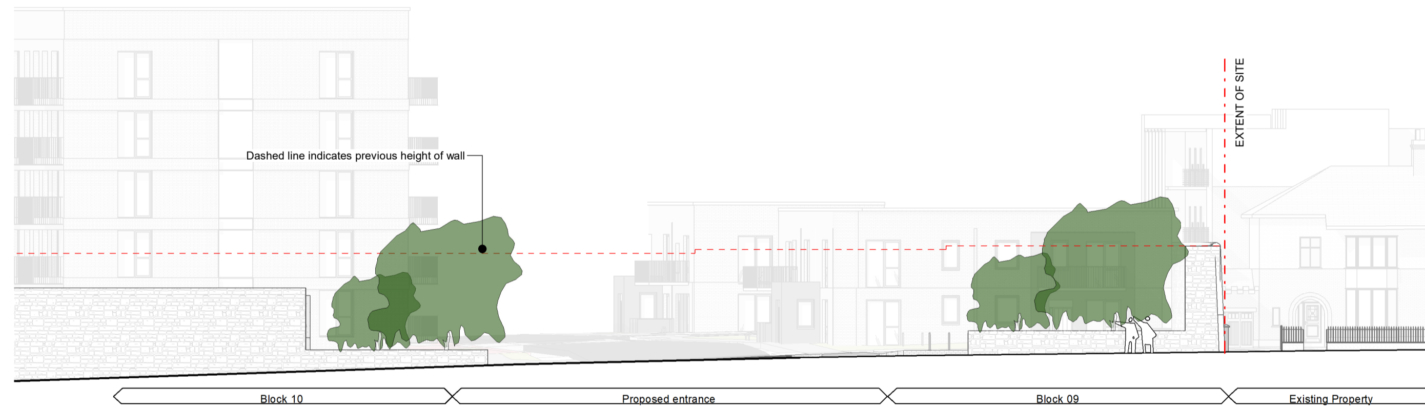
Site Entrance Section - Main Gate South External (Proposed) 1:100 1 : 200