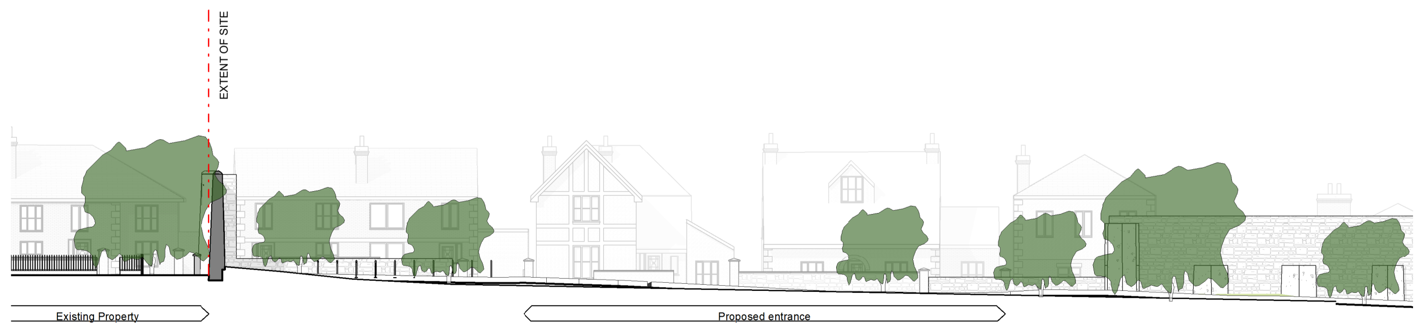
Site Entrance Section - Main Gate South Internal (Proposed) 1 : 200

Notes: - Do not scale from this drawing. Use figured dimensions in all cases. - Verify dimensions on site and report any discrepancies to the Architect immediately. - This drawing is to be read in conjunction with the Architect's Specification. - © This drawing is copyright and may only be reproduced with the Architect's permission.