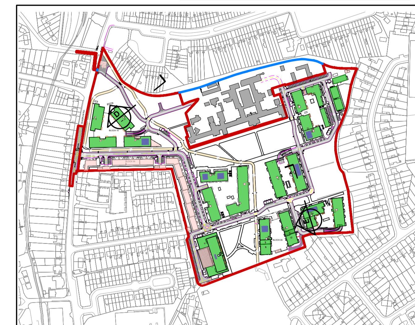
KEYPLAN SCALE @ A1: 1:4000 @ A1 SCALE @ A3: 1:8000 @ A3