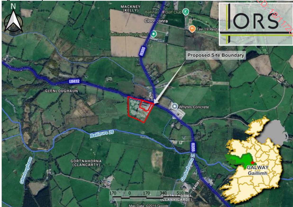
Figure 1.1: Proposed Development Site Location.

The total site area measures ca. 4.0 ha. The site is partially brownfield and partially greenfield in nature and is currently used as agricultural pastureland. It is bounded to the north by Torva Ireland Limited, a meat processing and preserving facility, with agricultural pastureland to the south, east and west. Whytes Concrete plant is located approximately 150 m east of the site. The Ballinure River is the primary surface-water feature in the vicinity, located approximately 125 m south of the site boundary. Field drainage ditches run along the southern and eastern boundaries of the site and discharge to the Ballinure River.