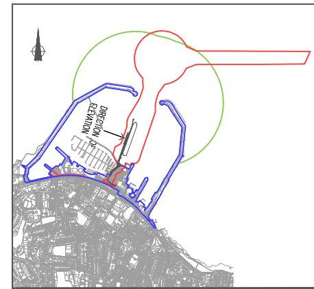
KEY PLAN - SCALE 1:25,000

VESSEL INDICATED BASED ON "FREEDOM OF THE SEAS"