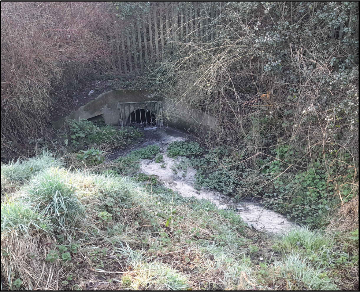
EXISTING SURFACE WATER OUTFALL