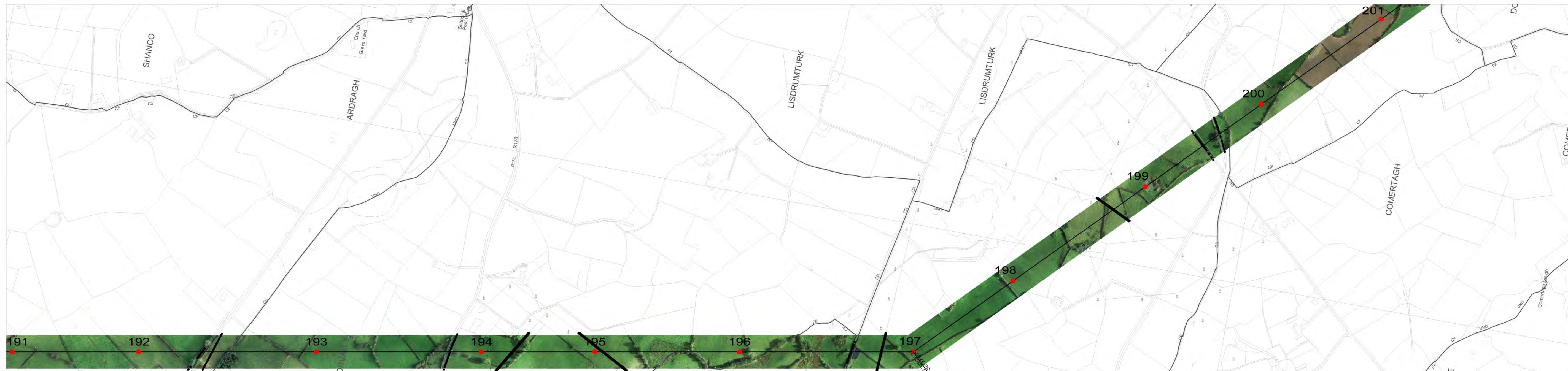
LiDAR data flow in October 2013 (80m)