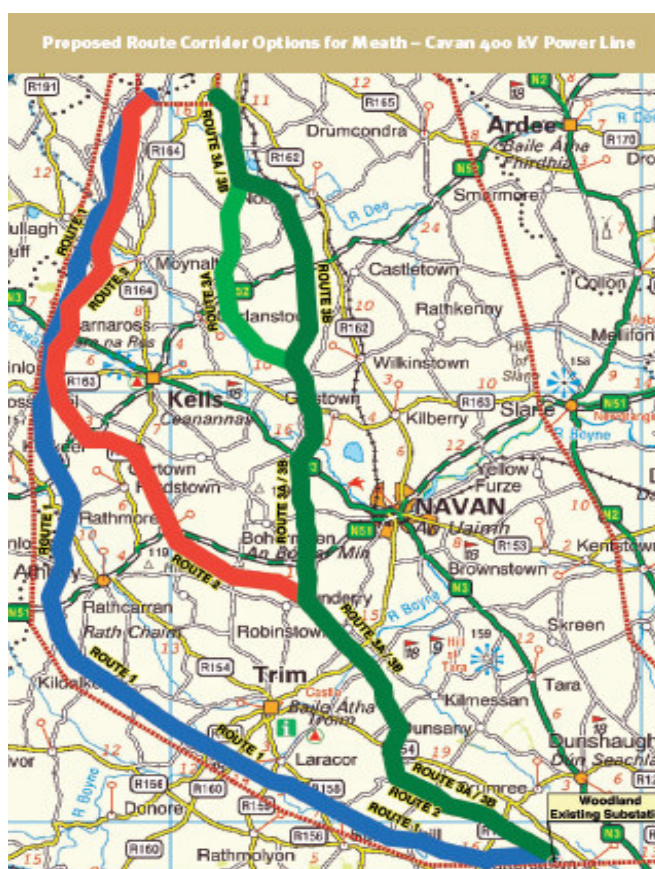
Fig. 2.2 Potential Route Corridors of the Meath-Cavan Transmission Circuit Project

Three potential route corridors have been identified in this Route Constraints Report. Again, each route corridor is approximately 1 km wide within which the OHL transmission infrastructure will be located. The 3 no. corridors are detailed in Fig. 2.2 and their characteristics are summarised below.