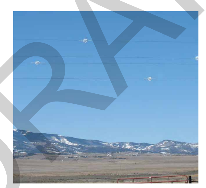
Plate 1: Electricity line marked with swan flight diverters

Marking the earth wire with flight diverters (see Plate 1) has been shown in numerous studies to be a useful mitigation tool at reducing potential collision impacts with powerlines.