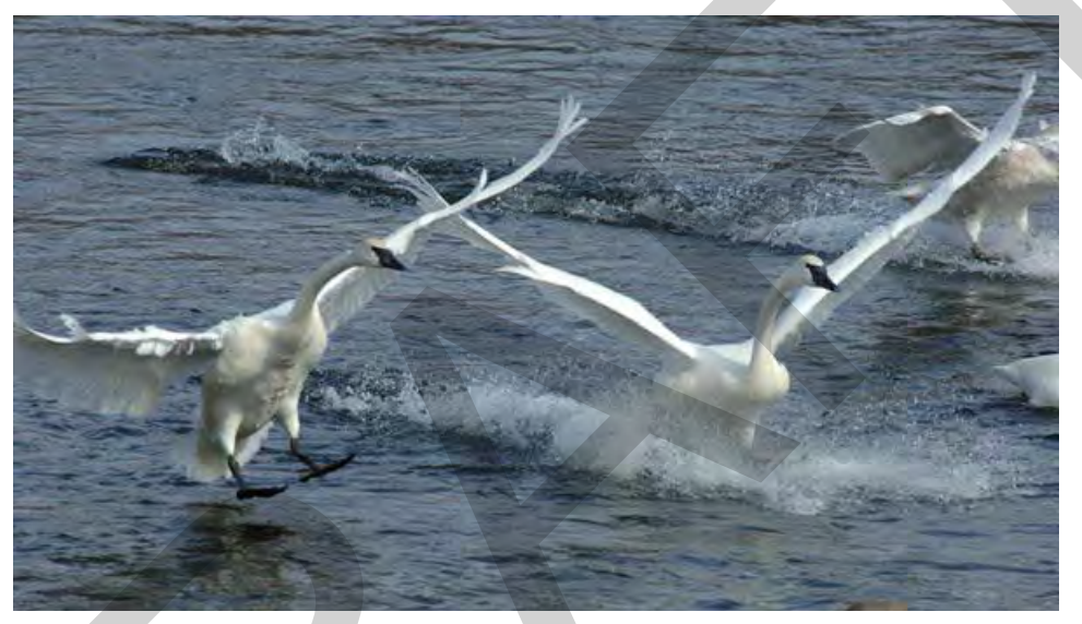
Plate 2: Trumpeter Swans