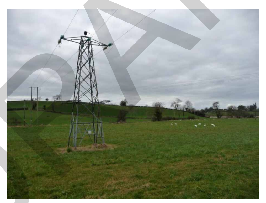
Plate 3: Flock of Mute Swans which regularly forage in a field beside a Transmission Line in the CMSA study area.