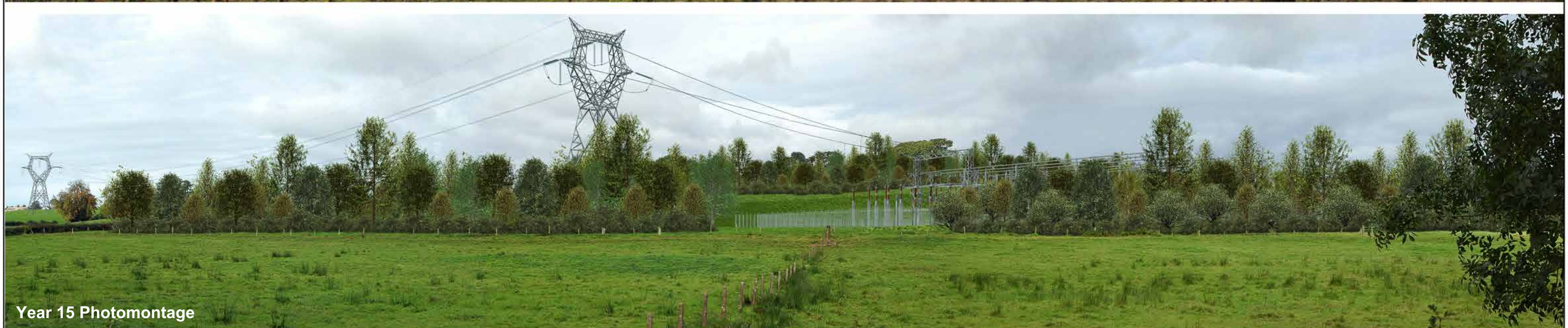
Year 15 Photomontage