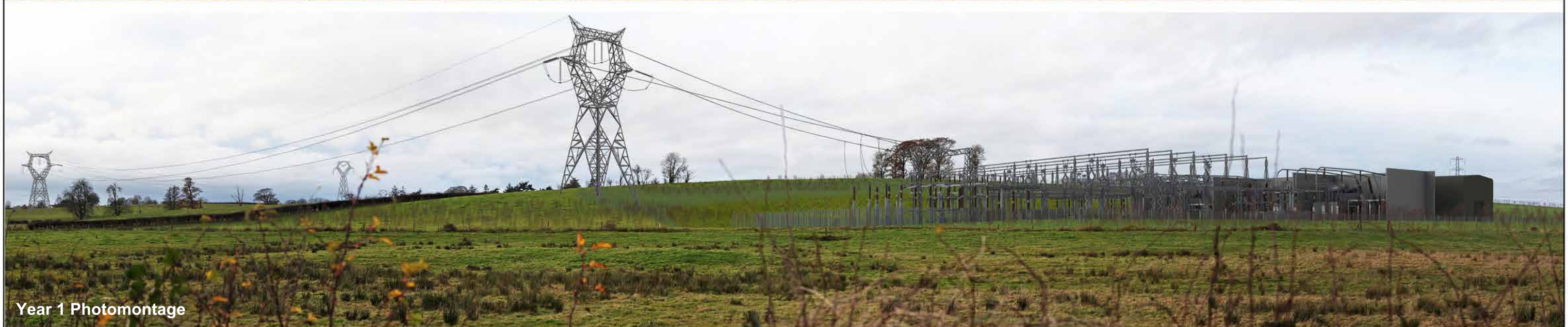
Year 1 Photomontage