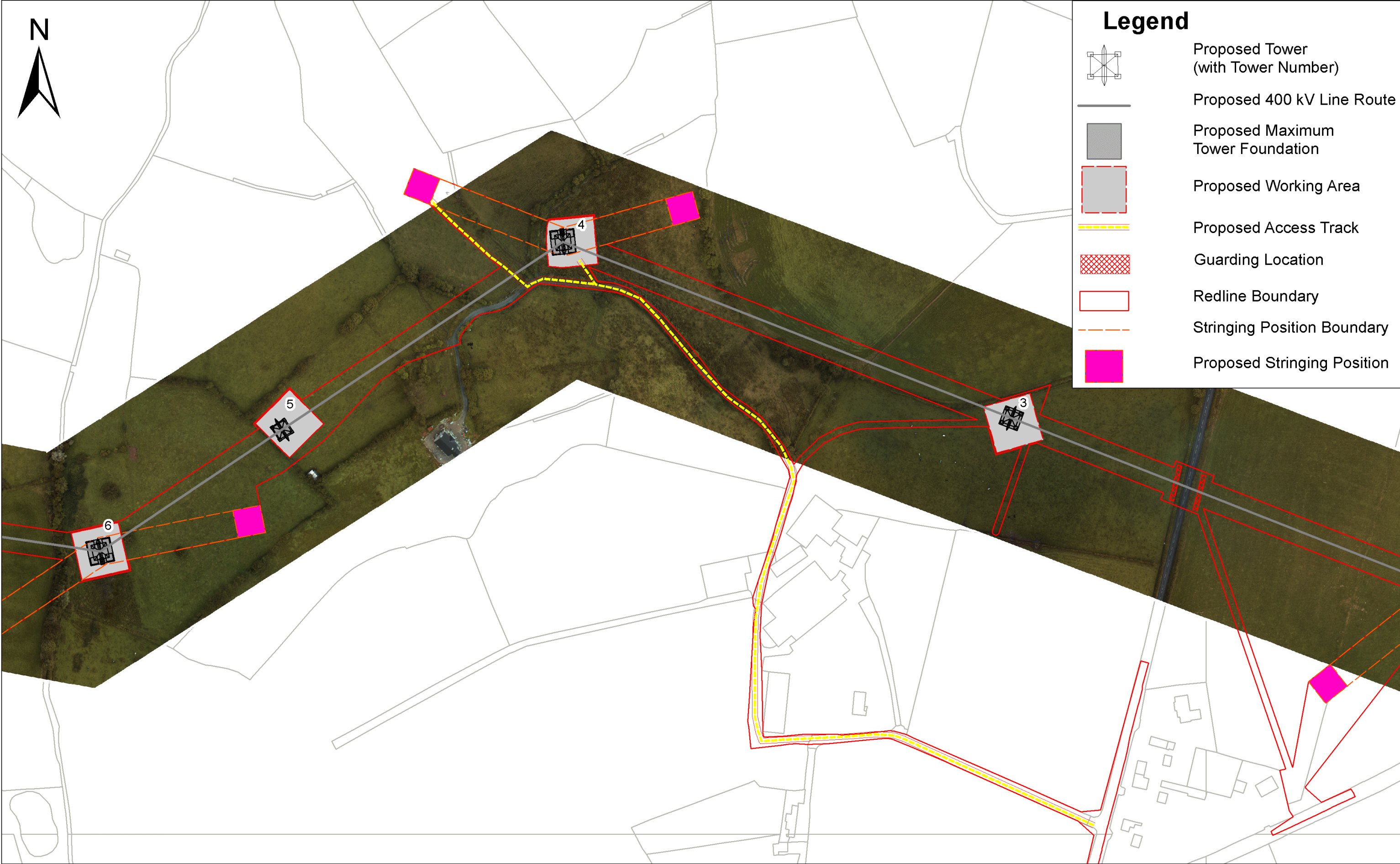
View 1: 1/2,500