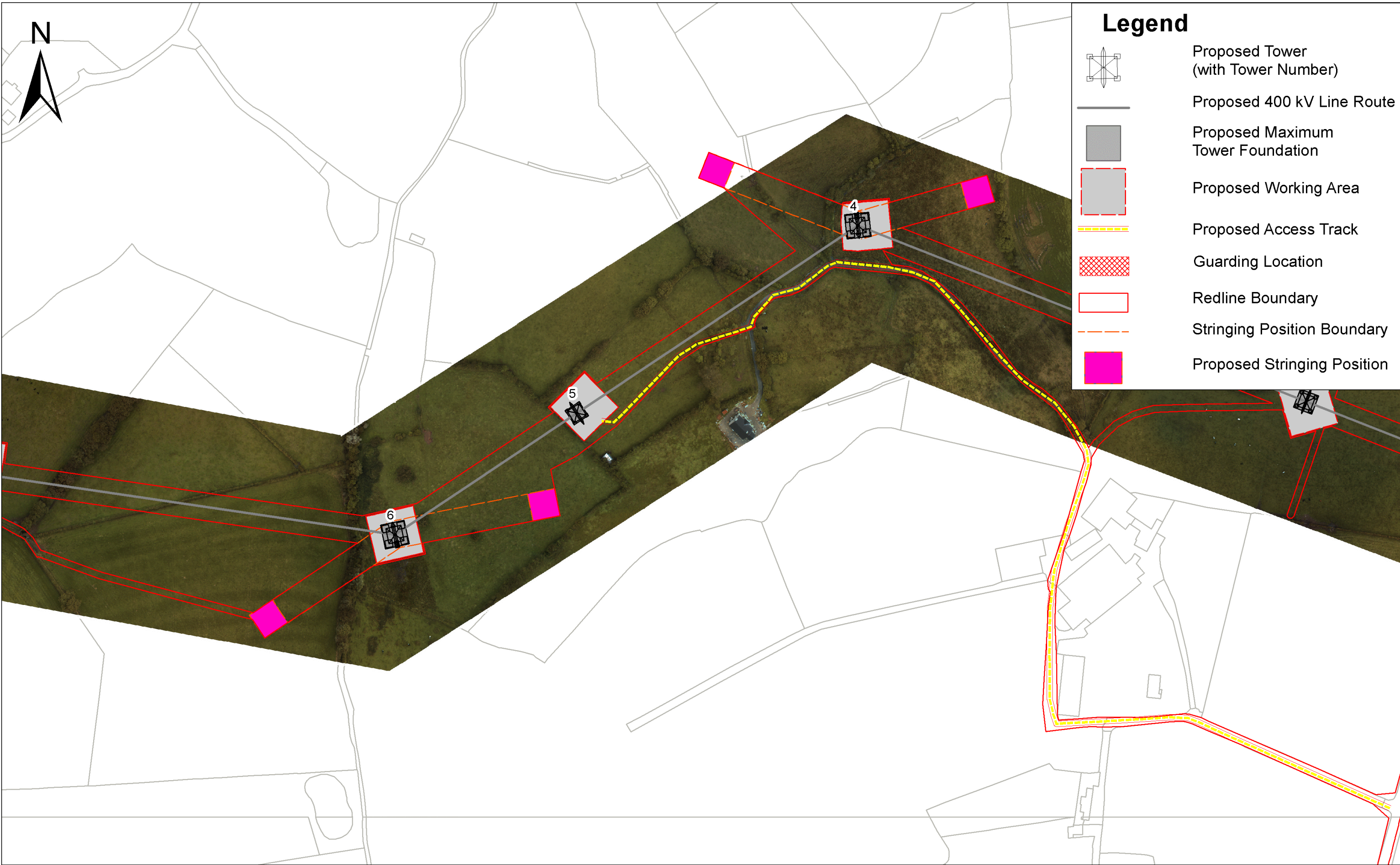
View 1: 1/2,500