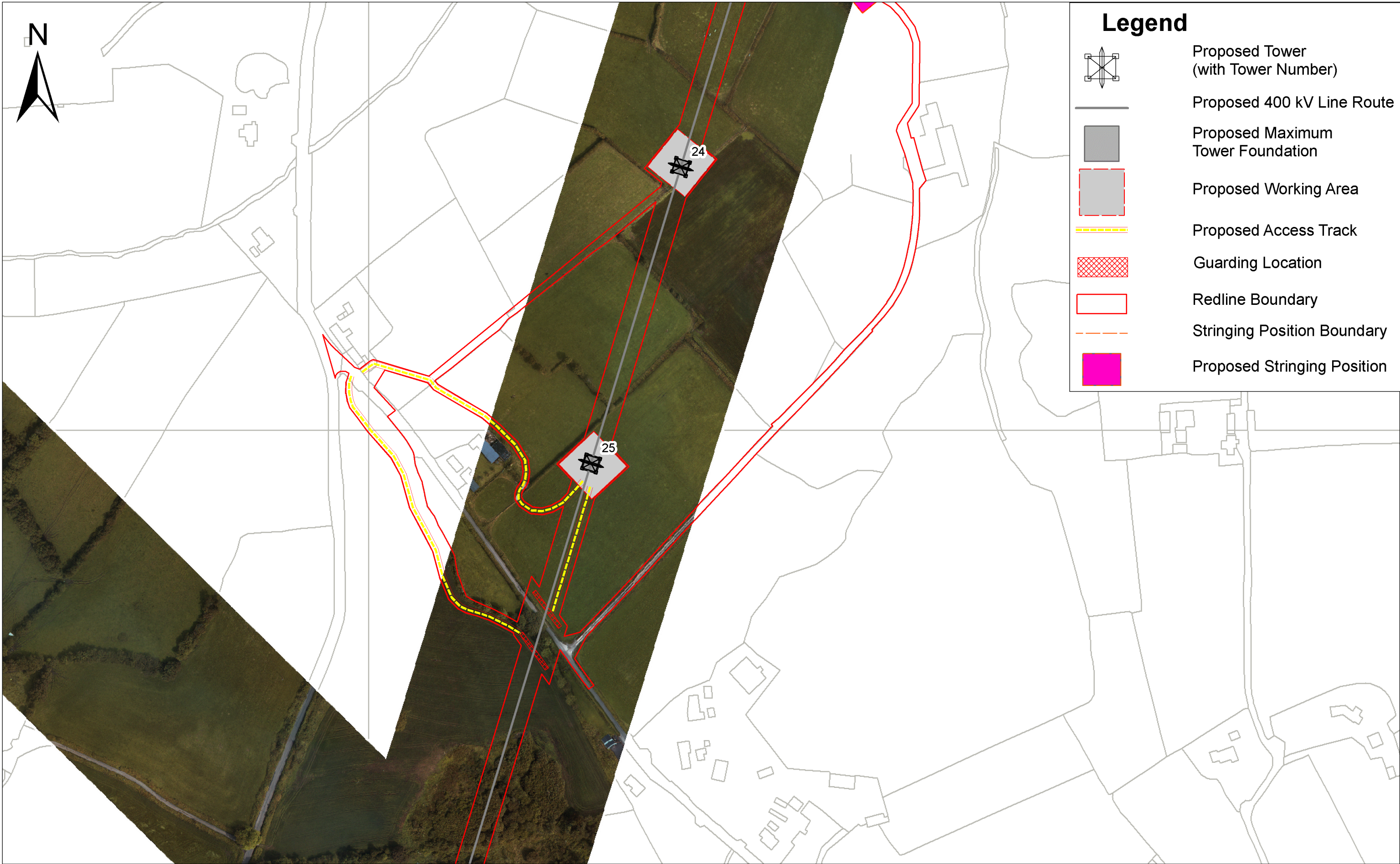
View 1: 1/2,500