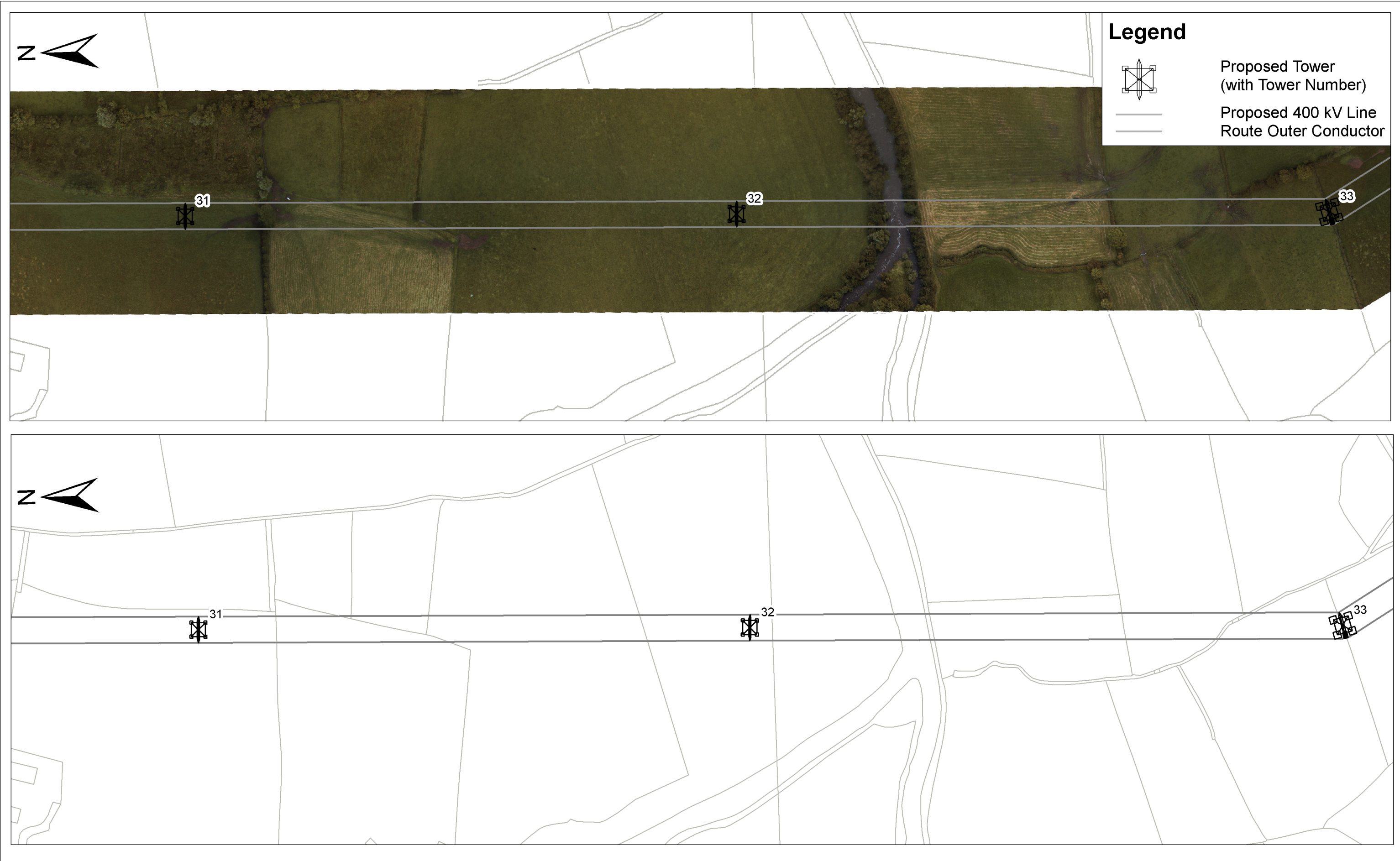
View 2: 1/2,500