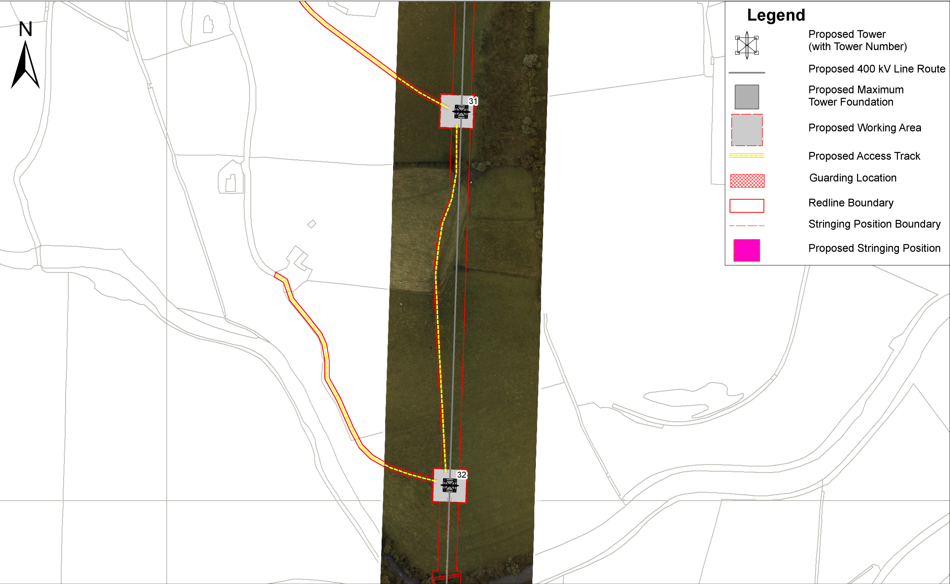
View 1: 1/2,500