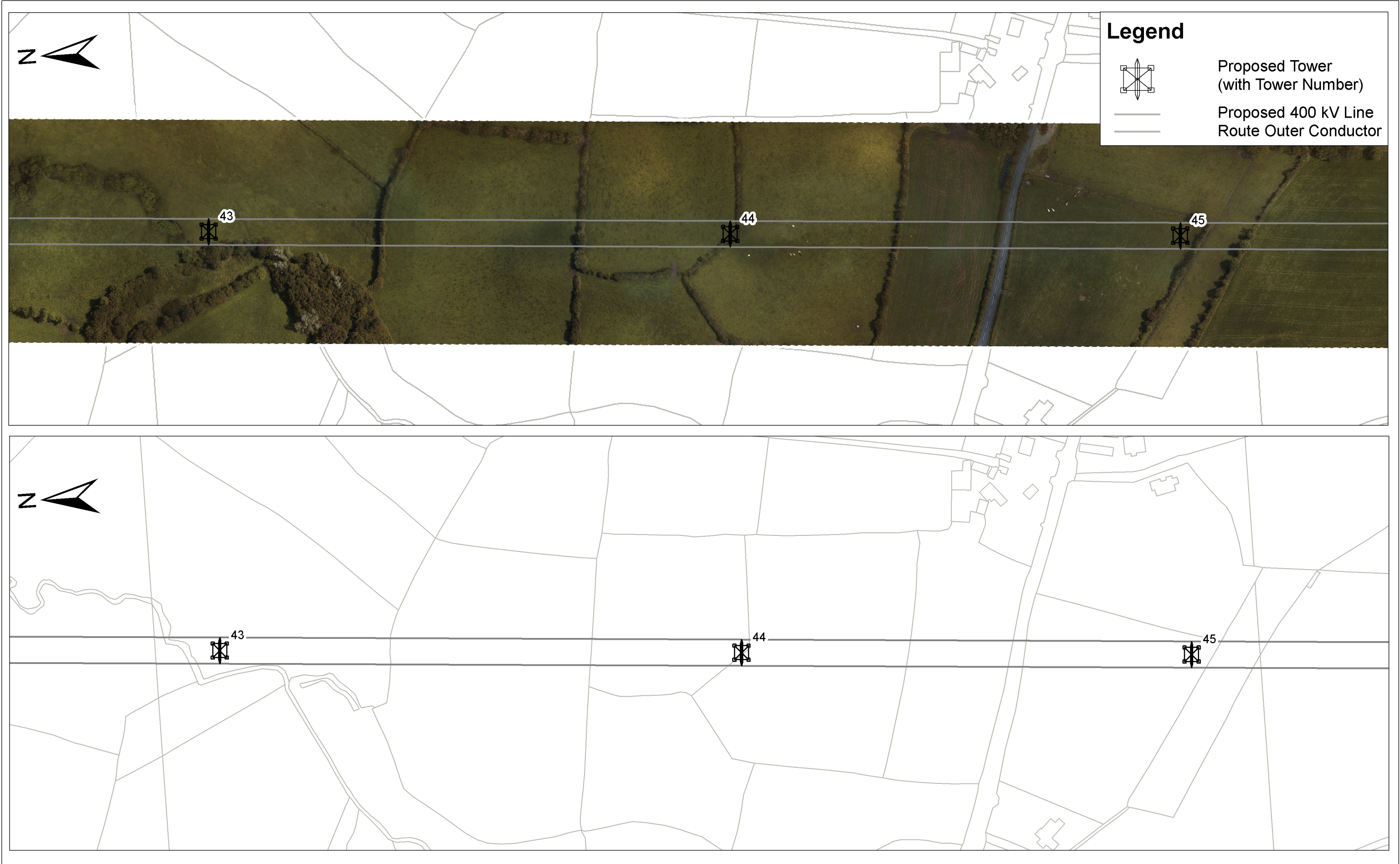
View 2: 1/2,500