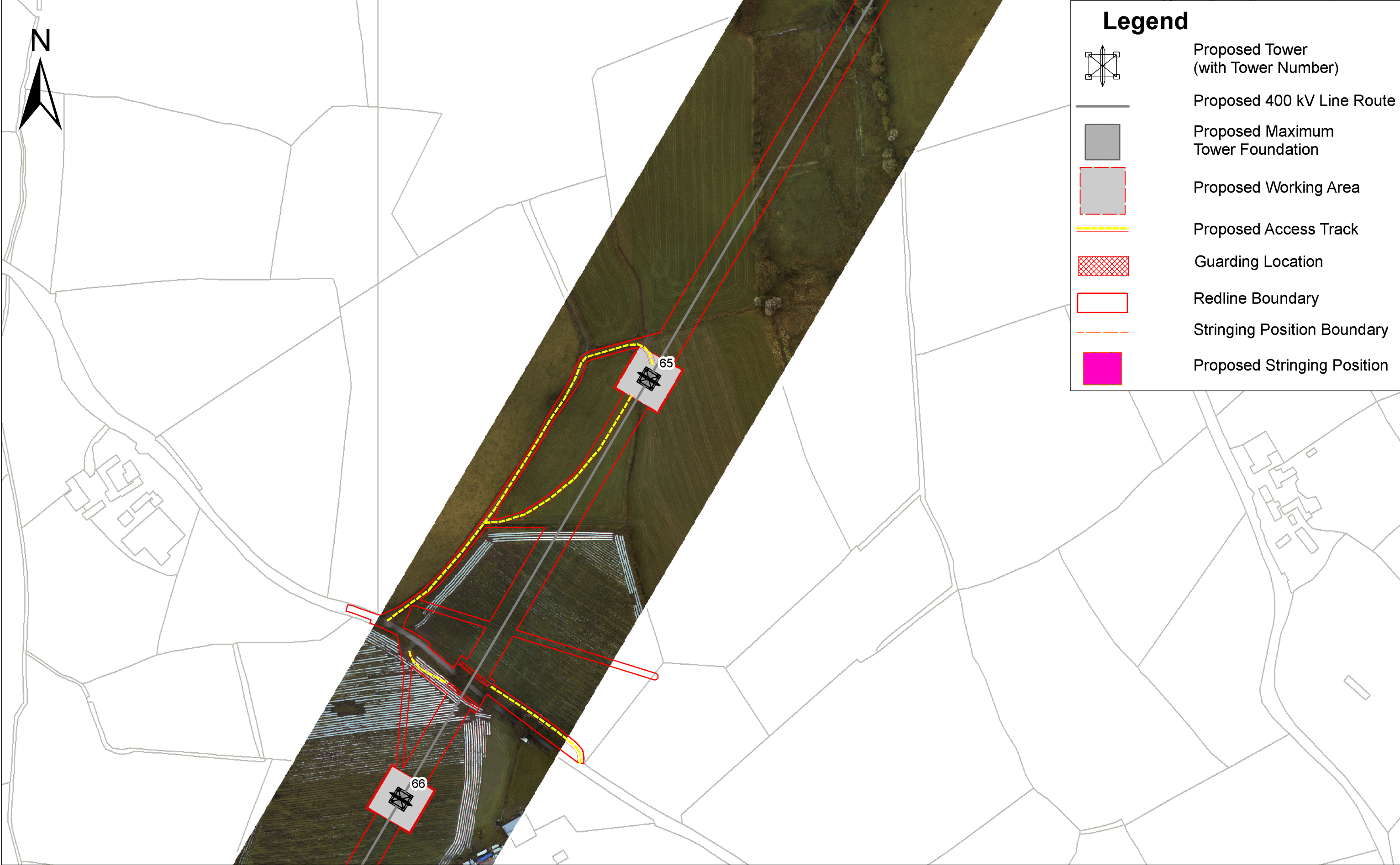
View 1: 1/2,500