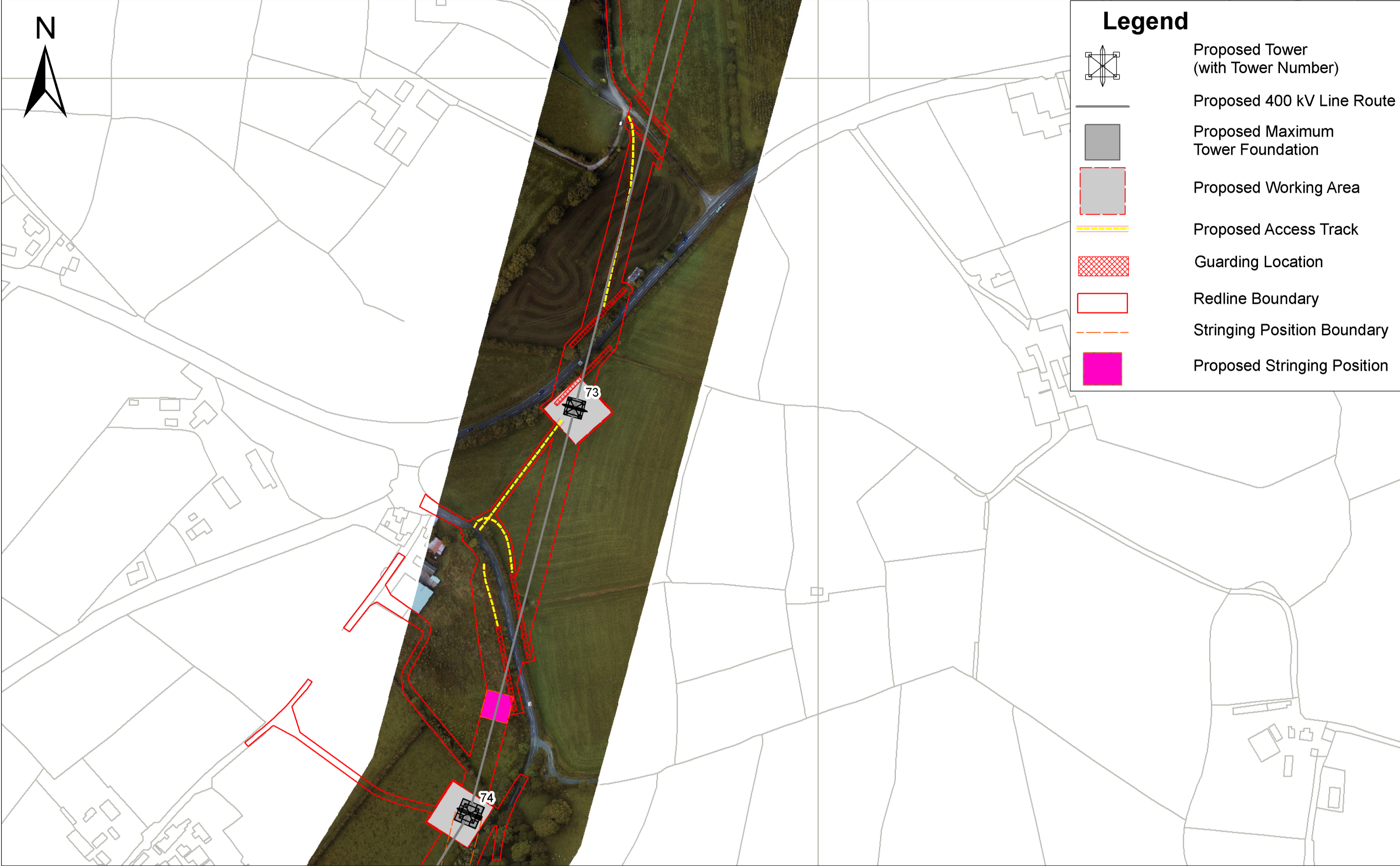
View 1: 1/2,500