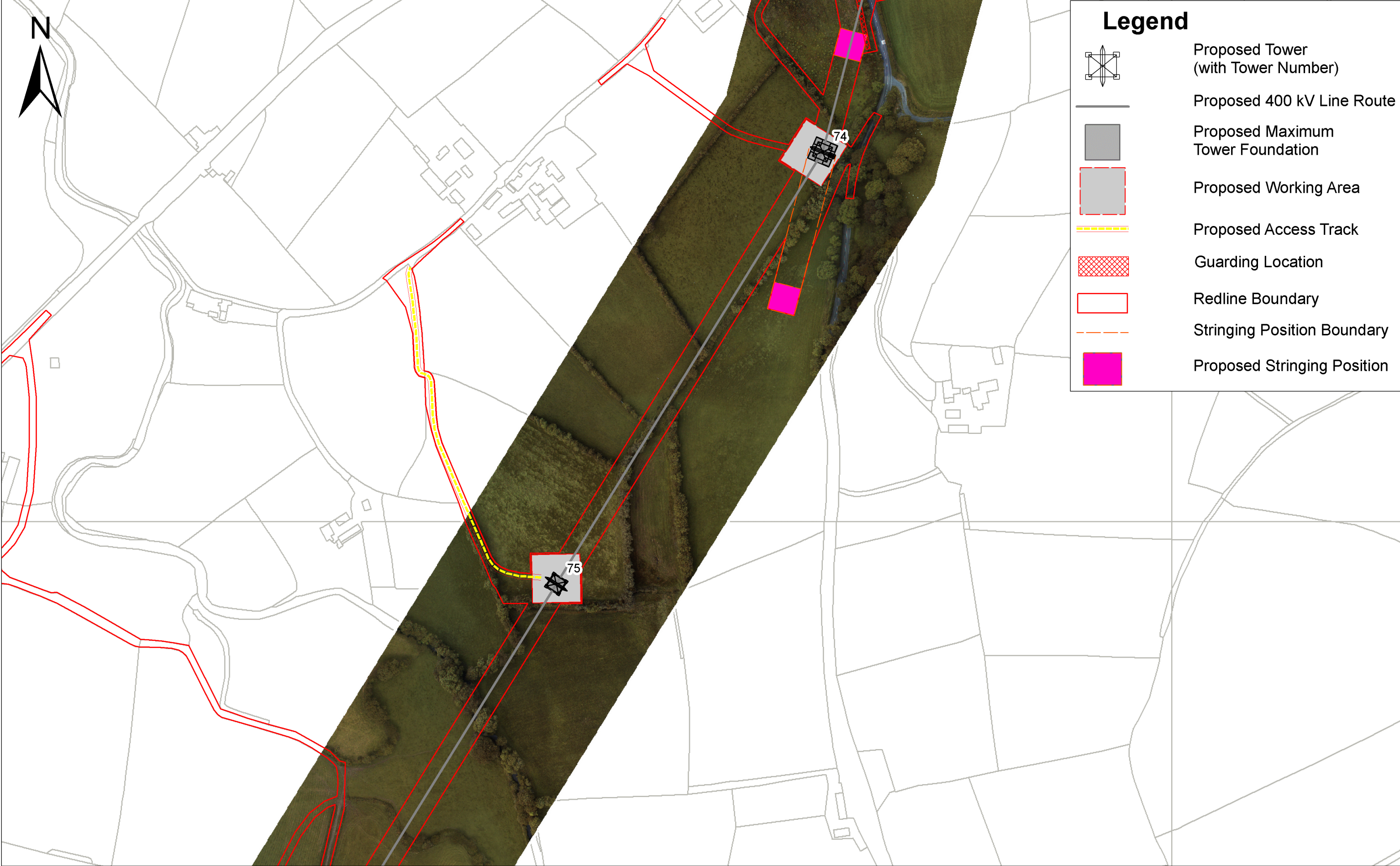
View 1: 1/2,500