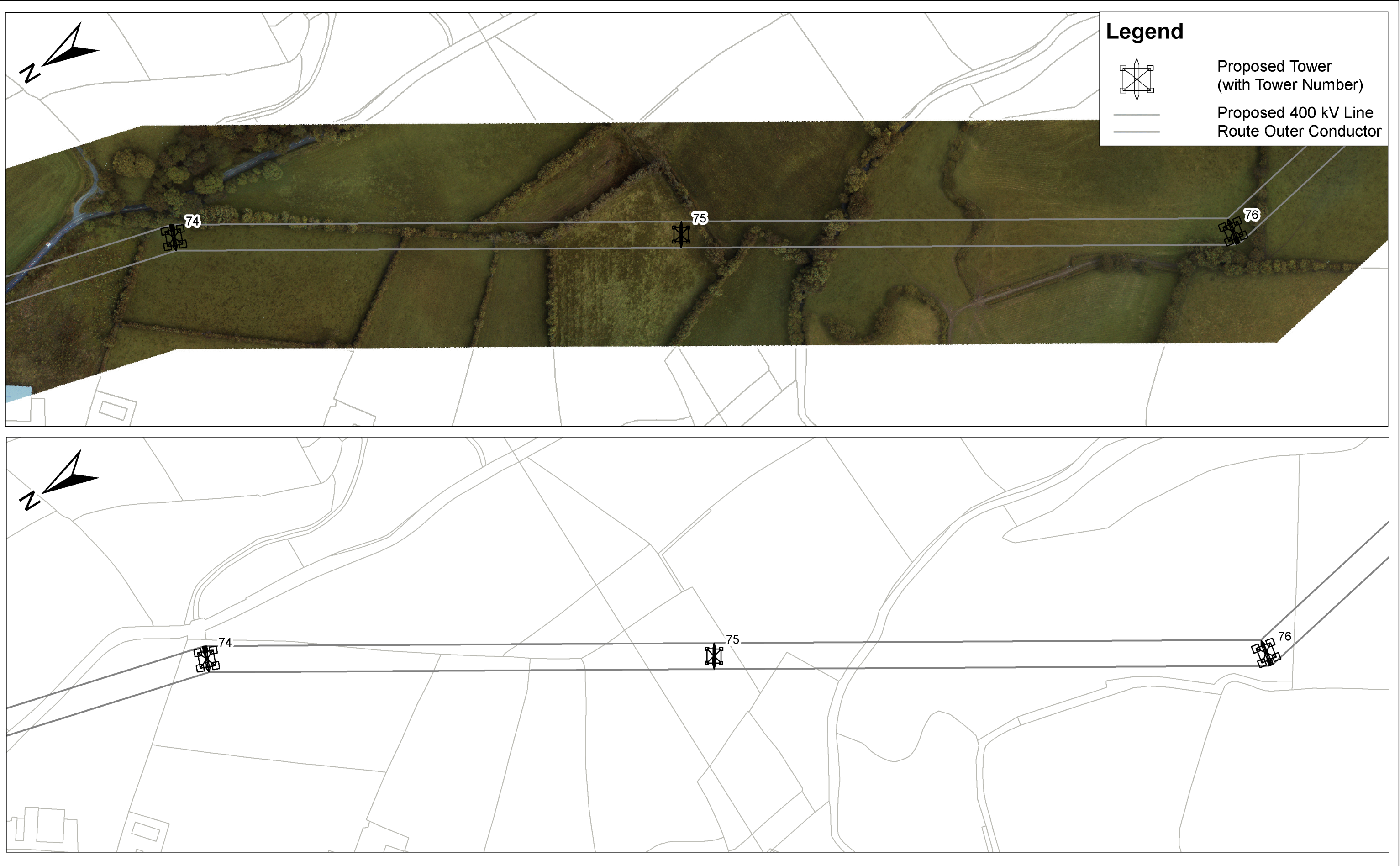
View 2: 1/2,500