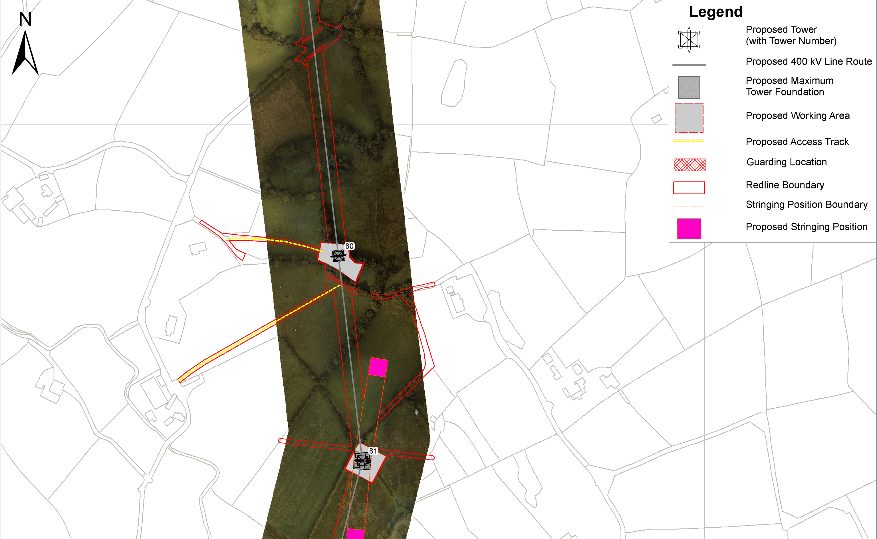
View 1: 1/2,500