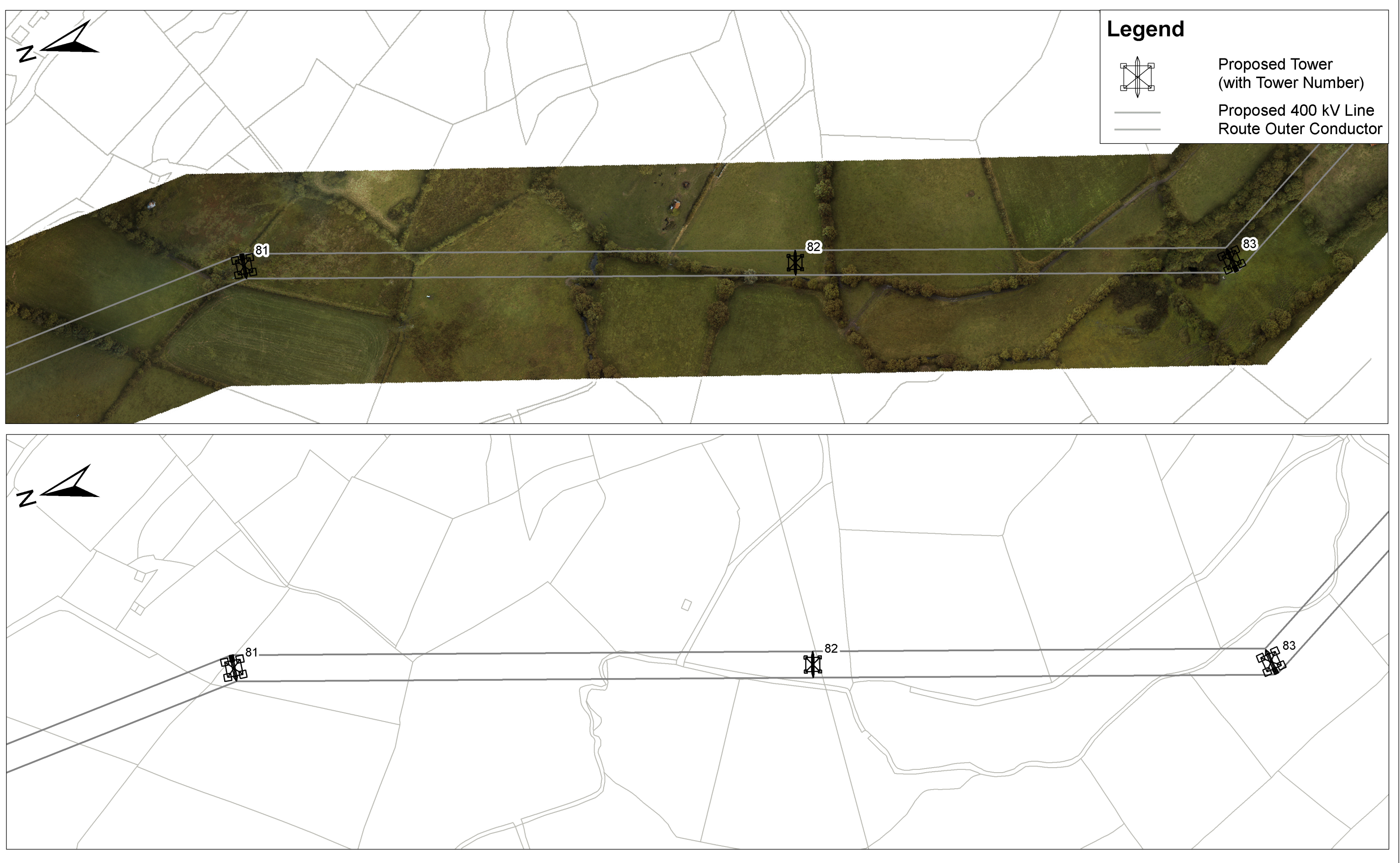
View 2: 1/2,500