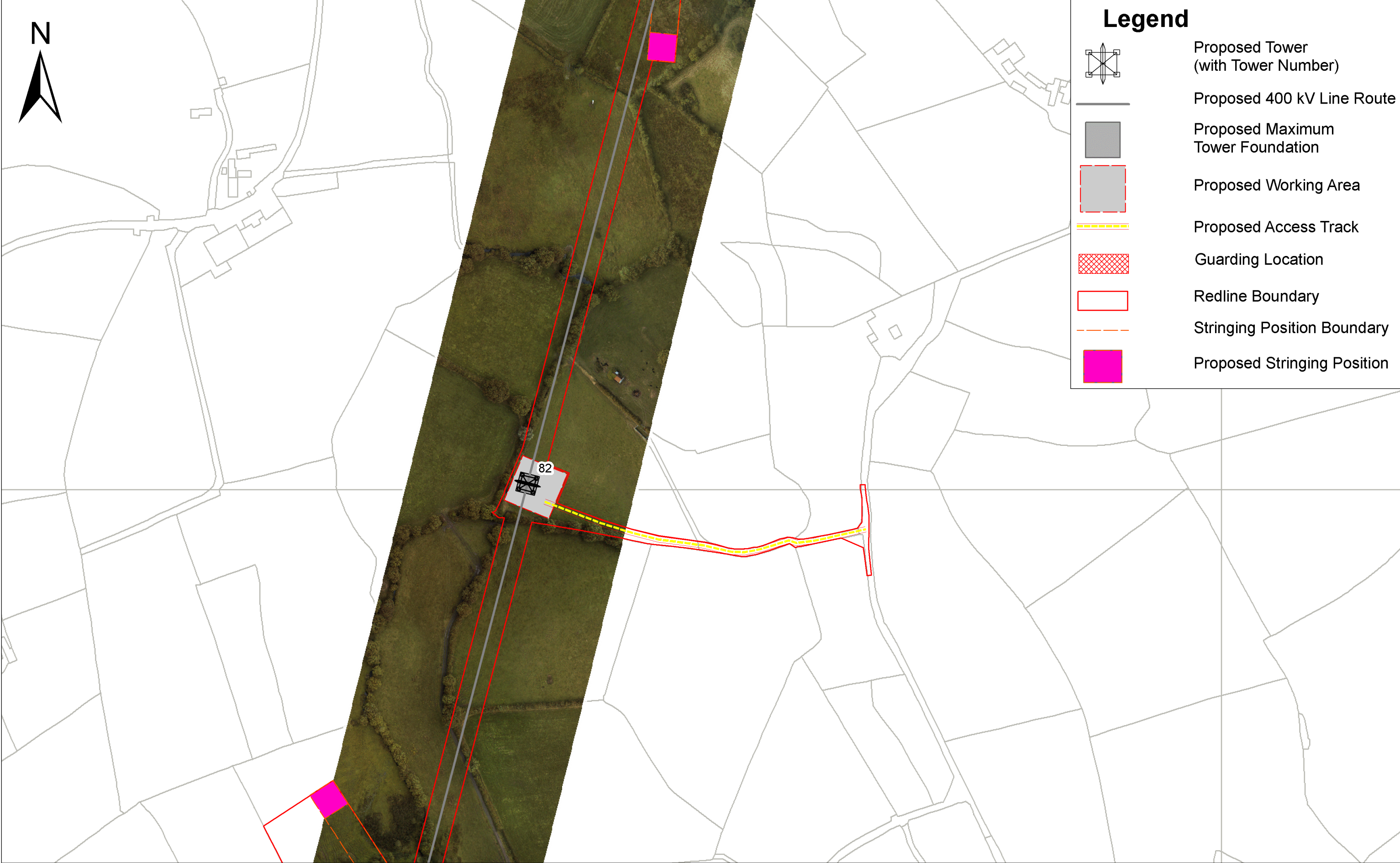
View 1: 1/2,500