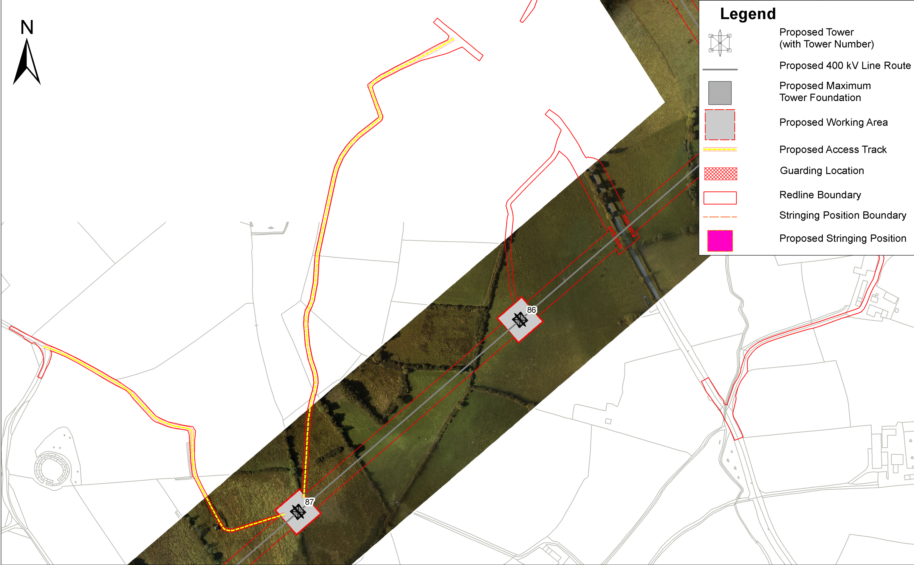
View 1: 1/2,500