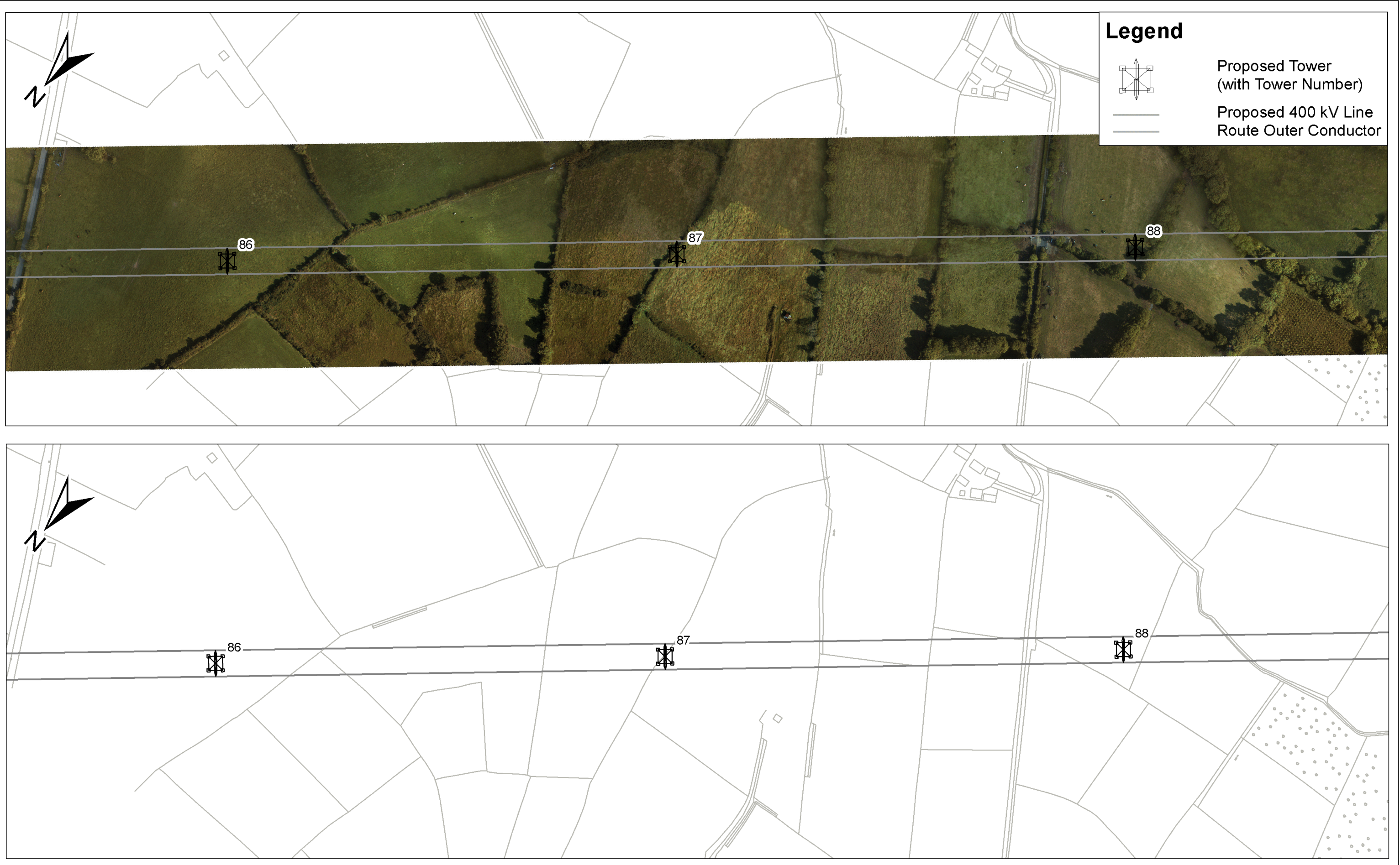
View 2: 1/2,500